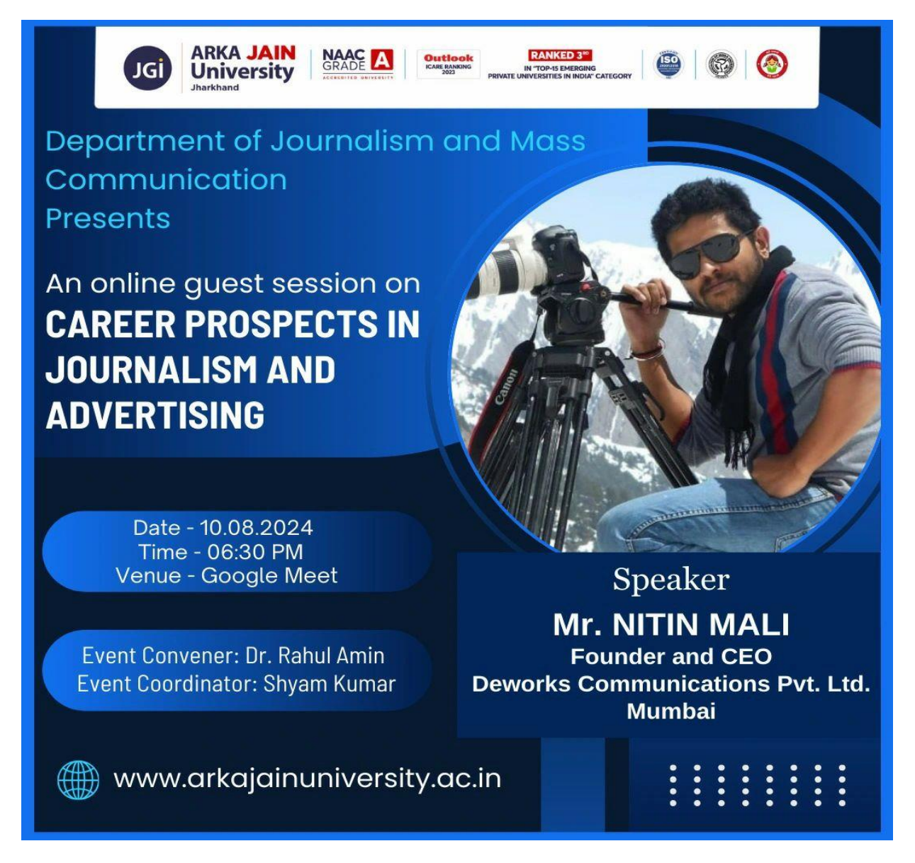
Figure 1: Poster of an online session on Career Prospects in Journalism and Advertising