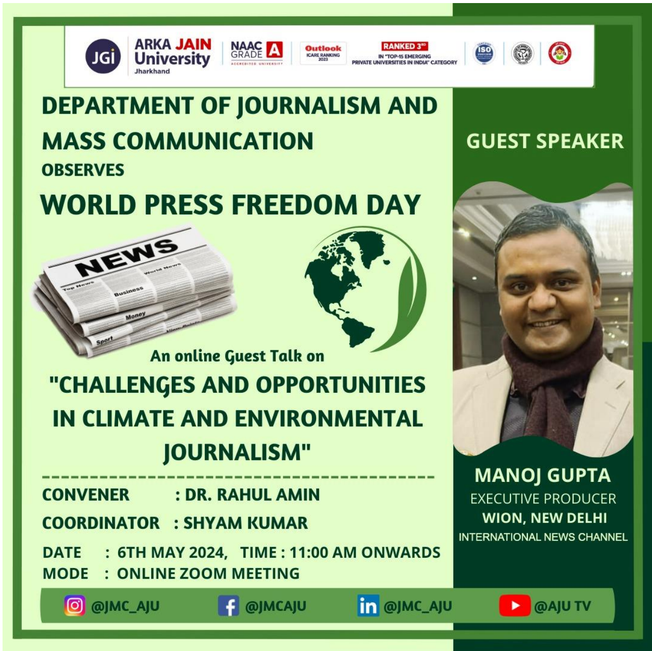
Figure 1: Poster of World Press Freedom Day Observation and online guest talk on 'Challenges and Opportunities in Climate and Environmental Journalism'