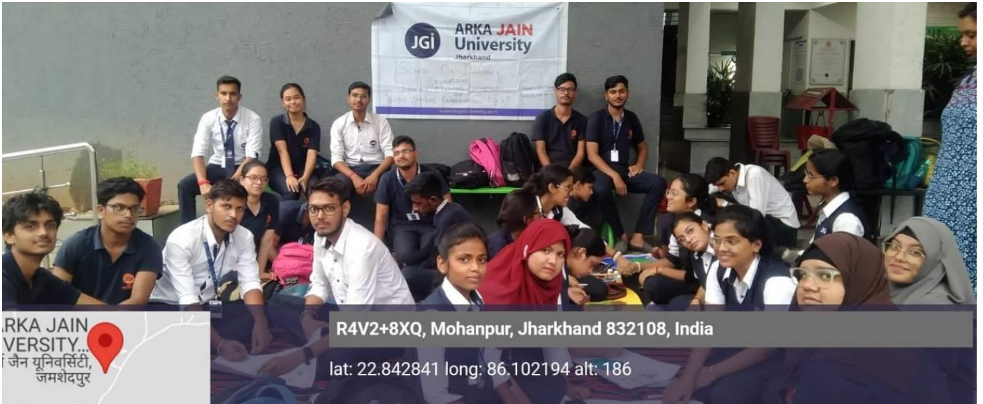
Students enthusiastically took part in the poster-making competition