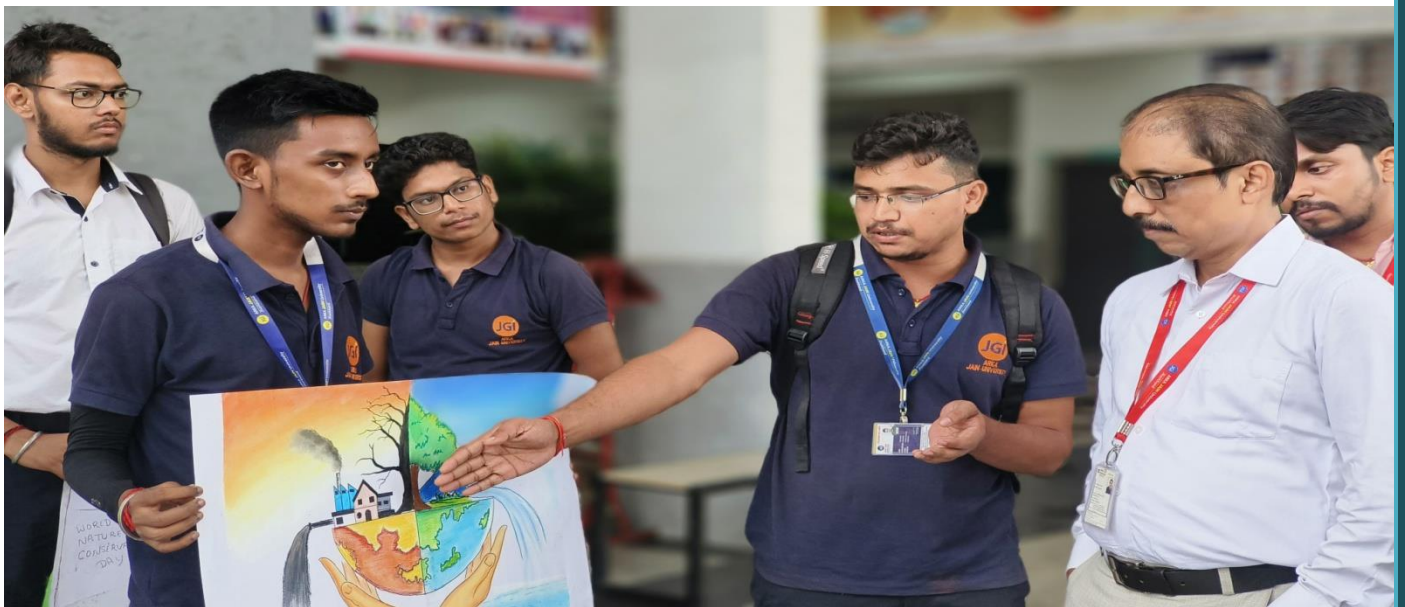
Students detailing their creative concepts to the judge.