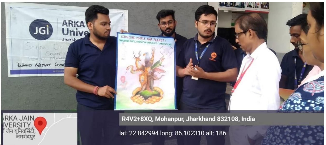
Students presenting their ideas to the judge.