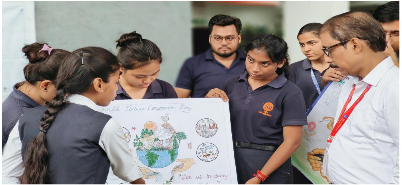
Students displaying and explaining their poster