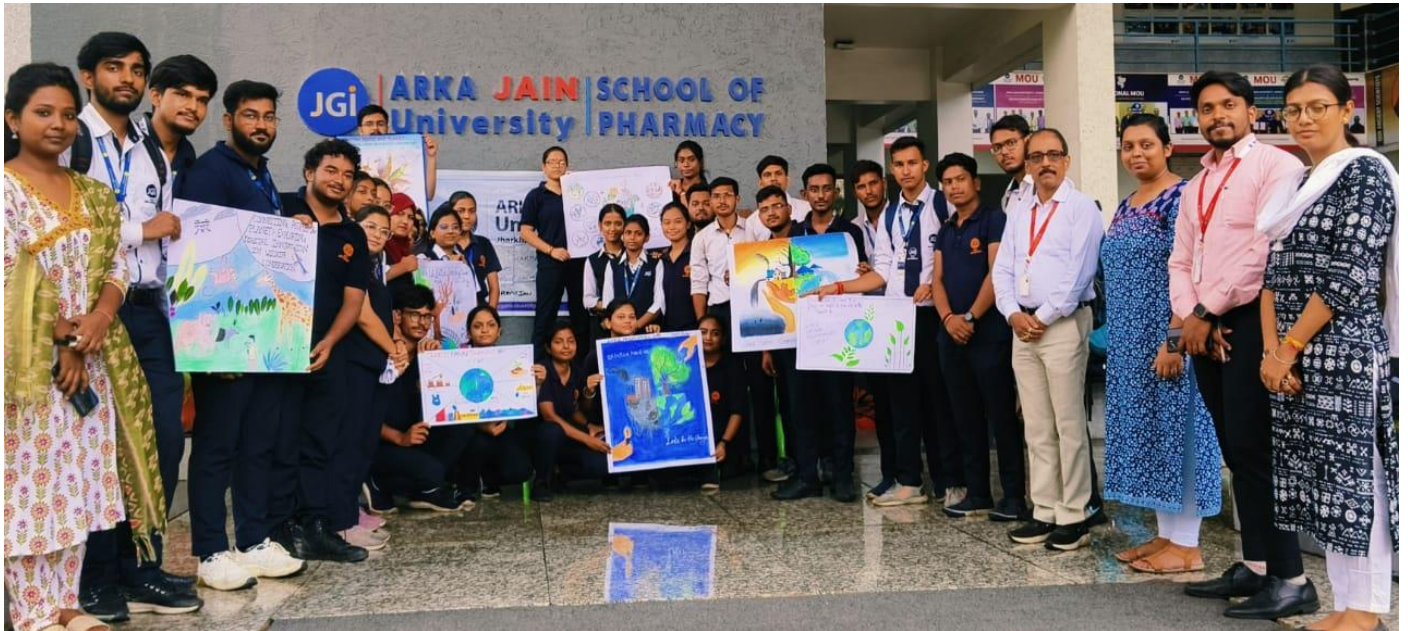
Students and faculty coordinators after the completion of the event