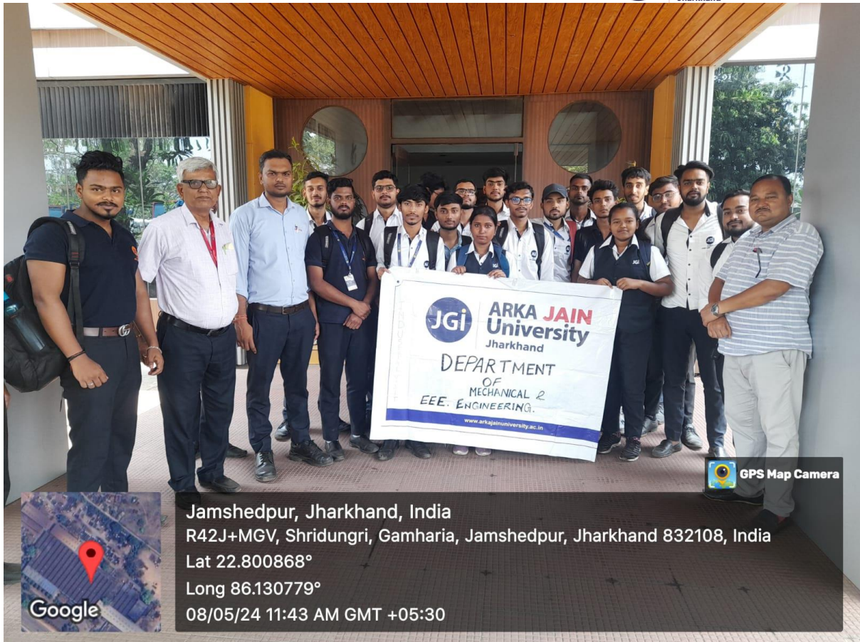
Figure 3: Group Photo