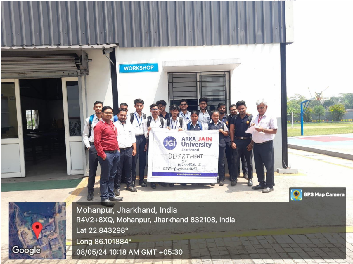
Figure 4: Students ready to go from University