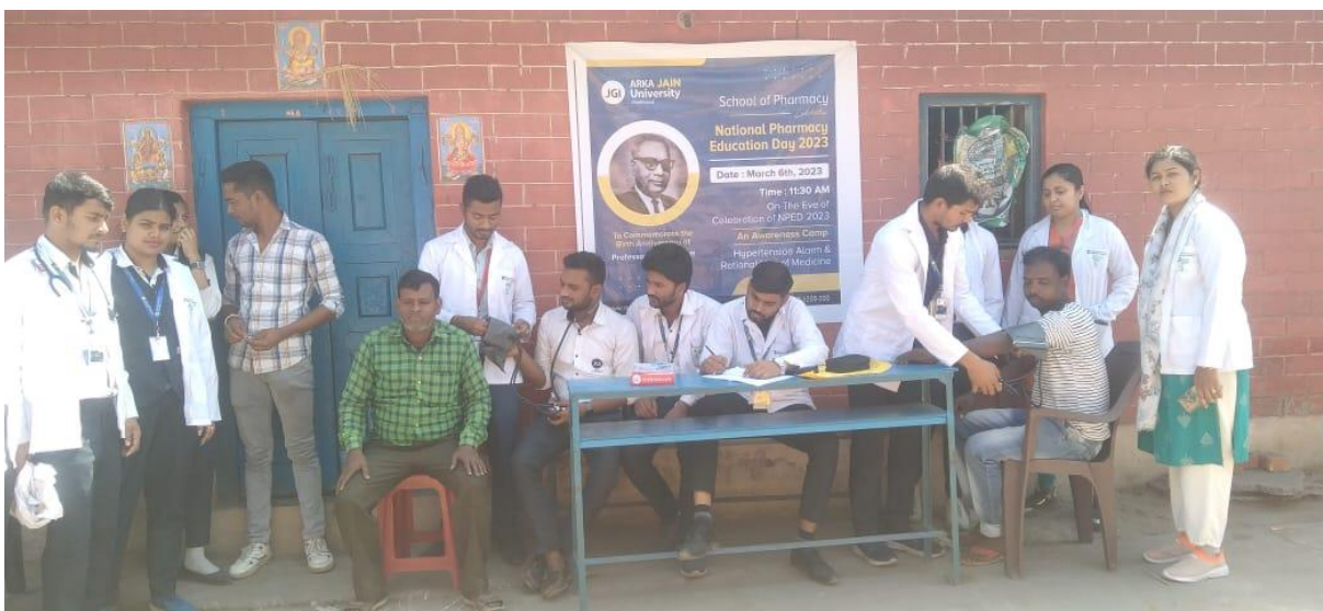
Villagers Participated in the Measurement of Blood Pressure