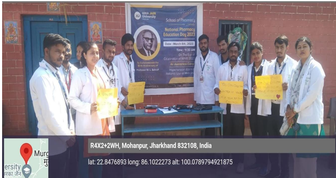
Hypertension Alarm on the Eve of National Pharmacy Education Day 2023