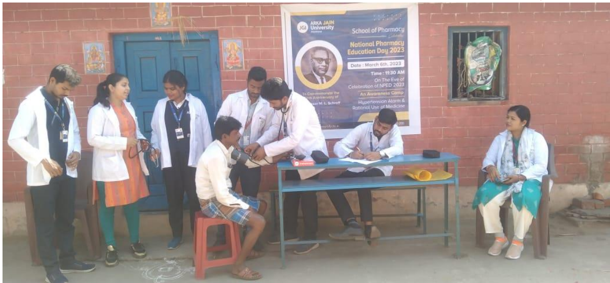
Teacher Supervised the Activity