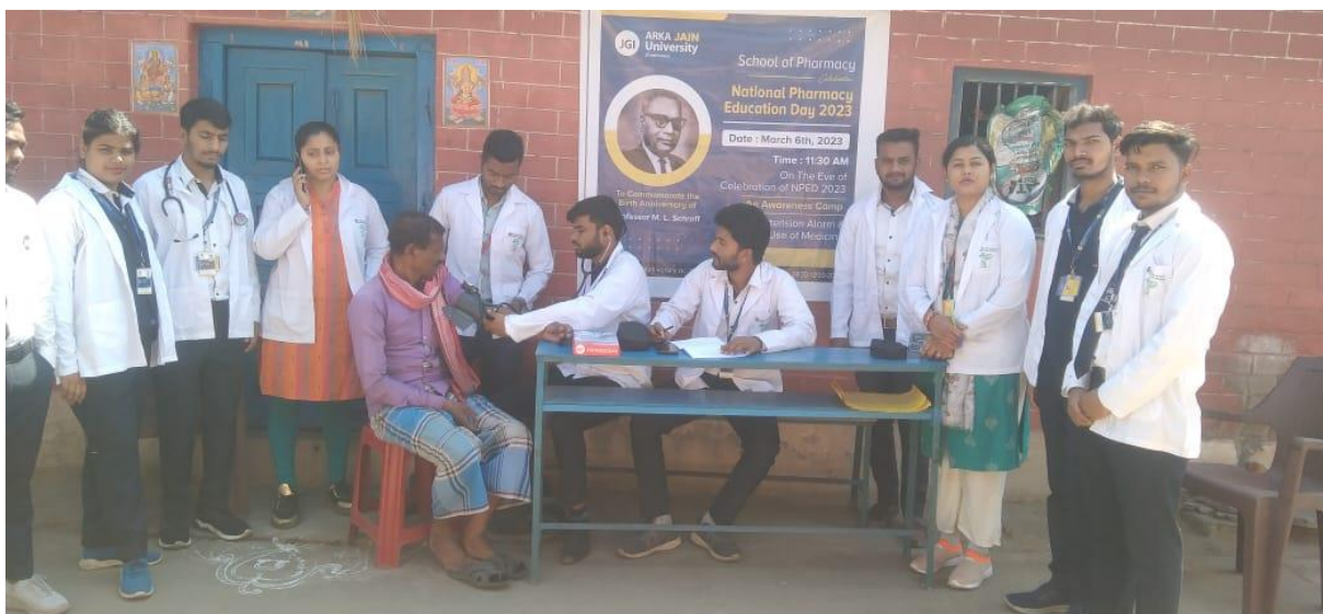
Students Eagerly involved with Measurement of Blood Pressure of the Villagers