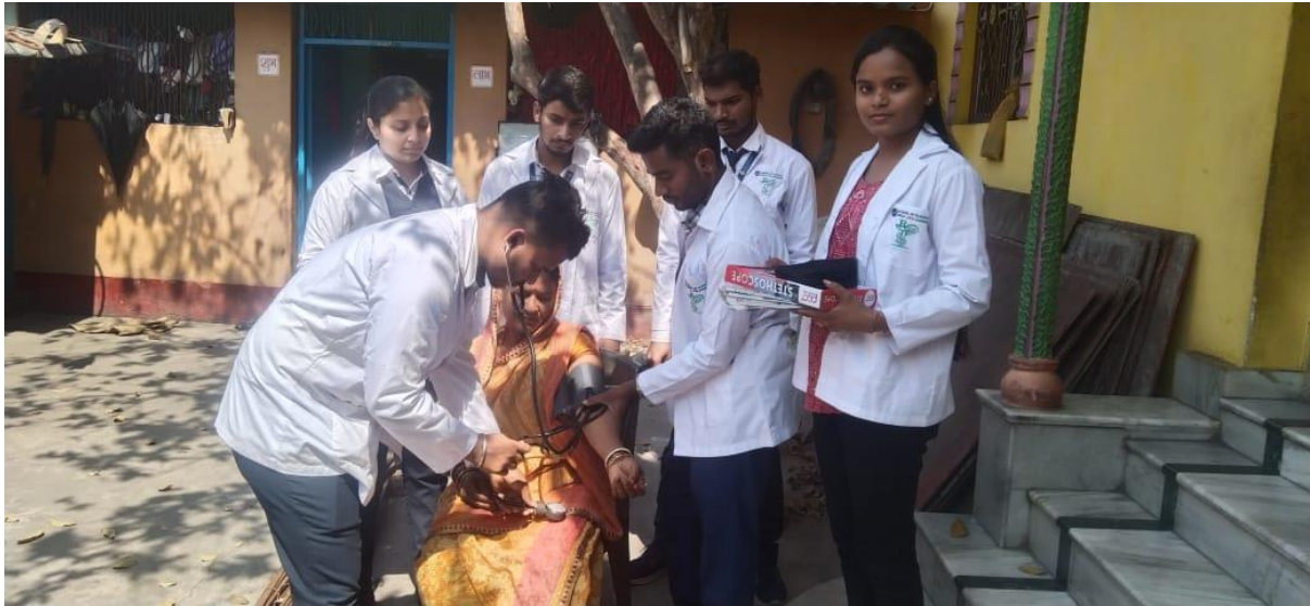
Students Measuring Blood Pressure of a Villager to make her aware about Hypertension