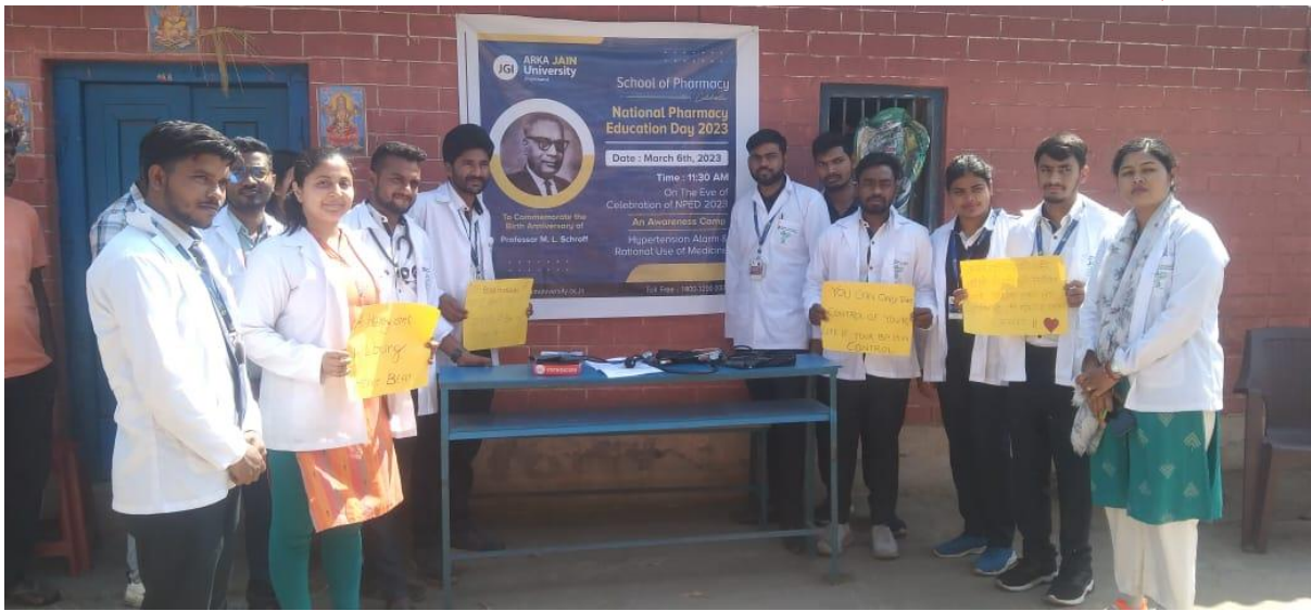
With awareness placards for Hypertension Alarm