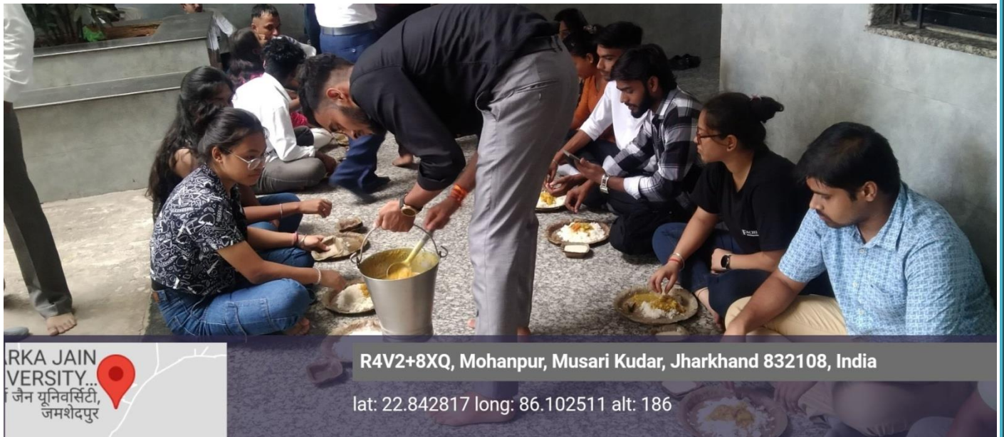
Students enjoying the taste of Mahaprasad