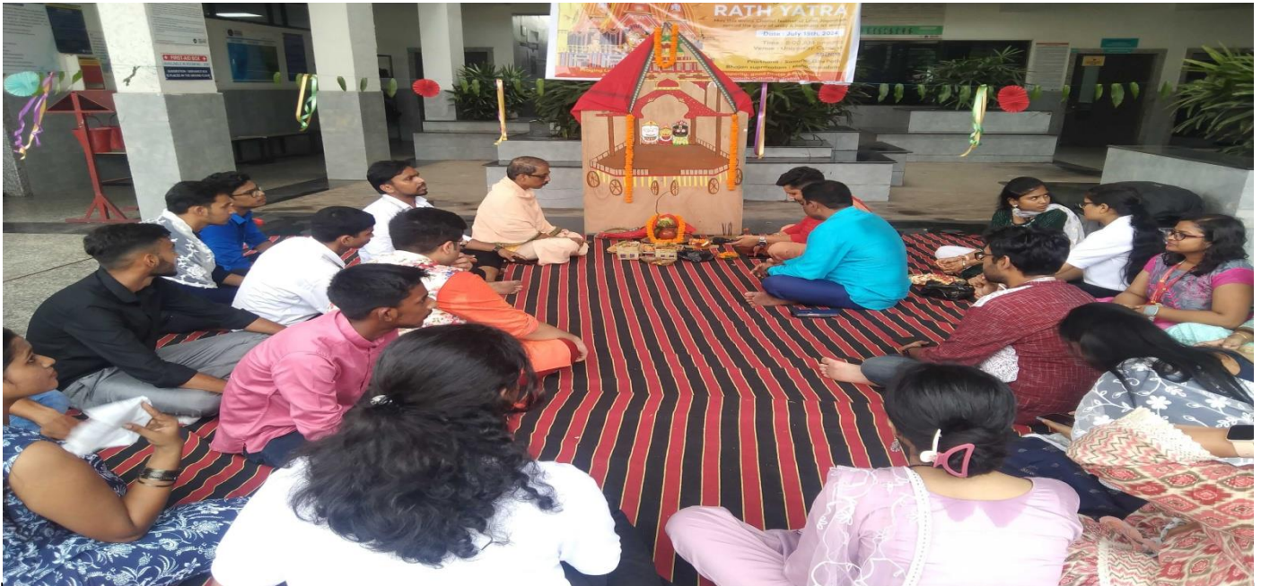
Dignitaries, faculty members, and students came together to pay homage to Lord Jagannath Maha Prabhu, embracing the divine spirit