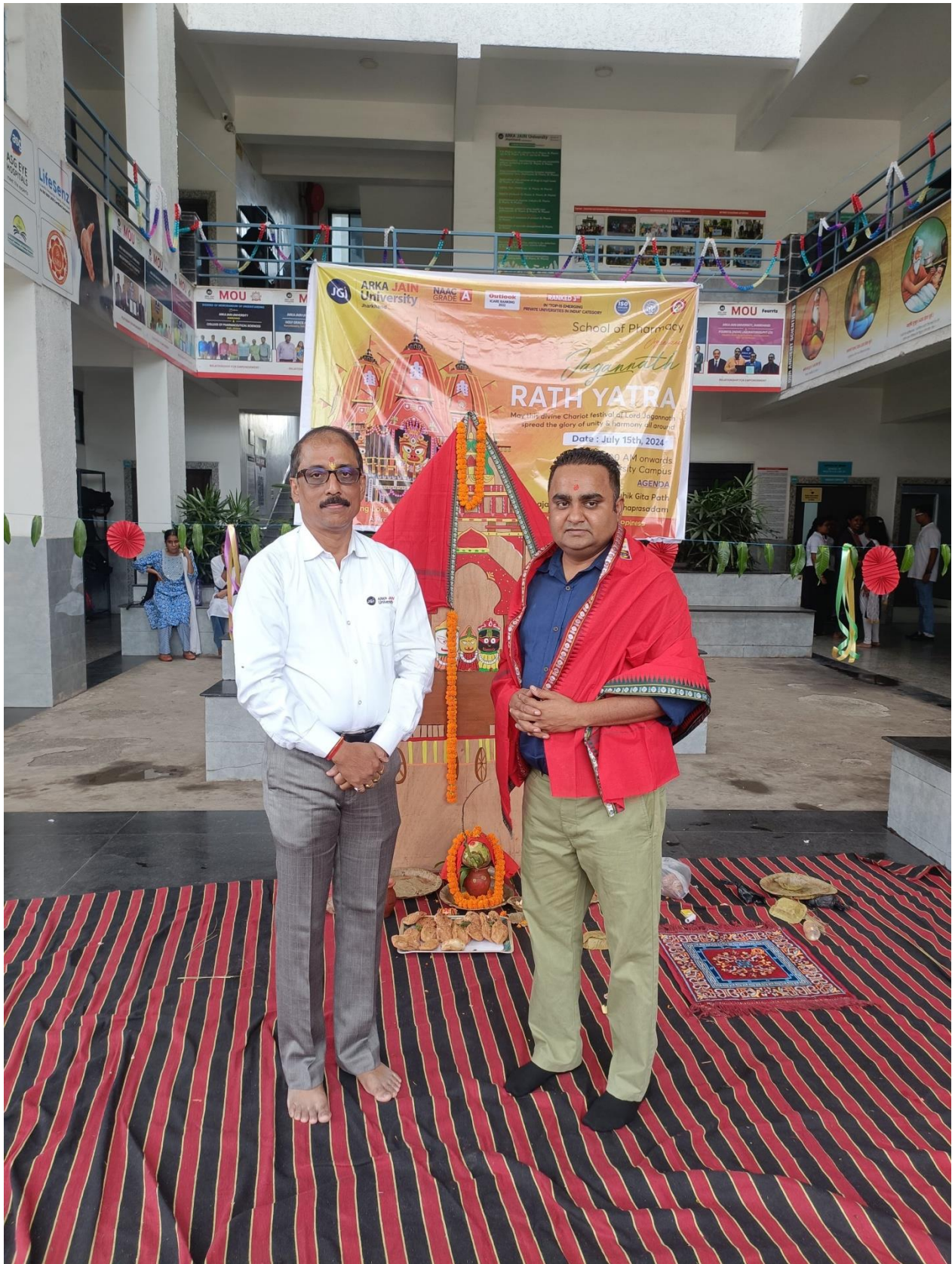
Registrar Sir witnessing the auspicious occasion