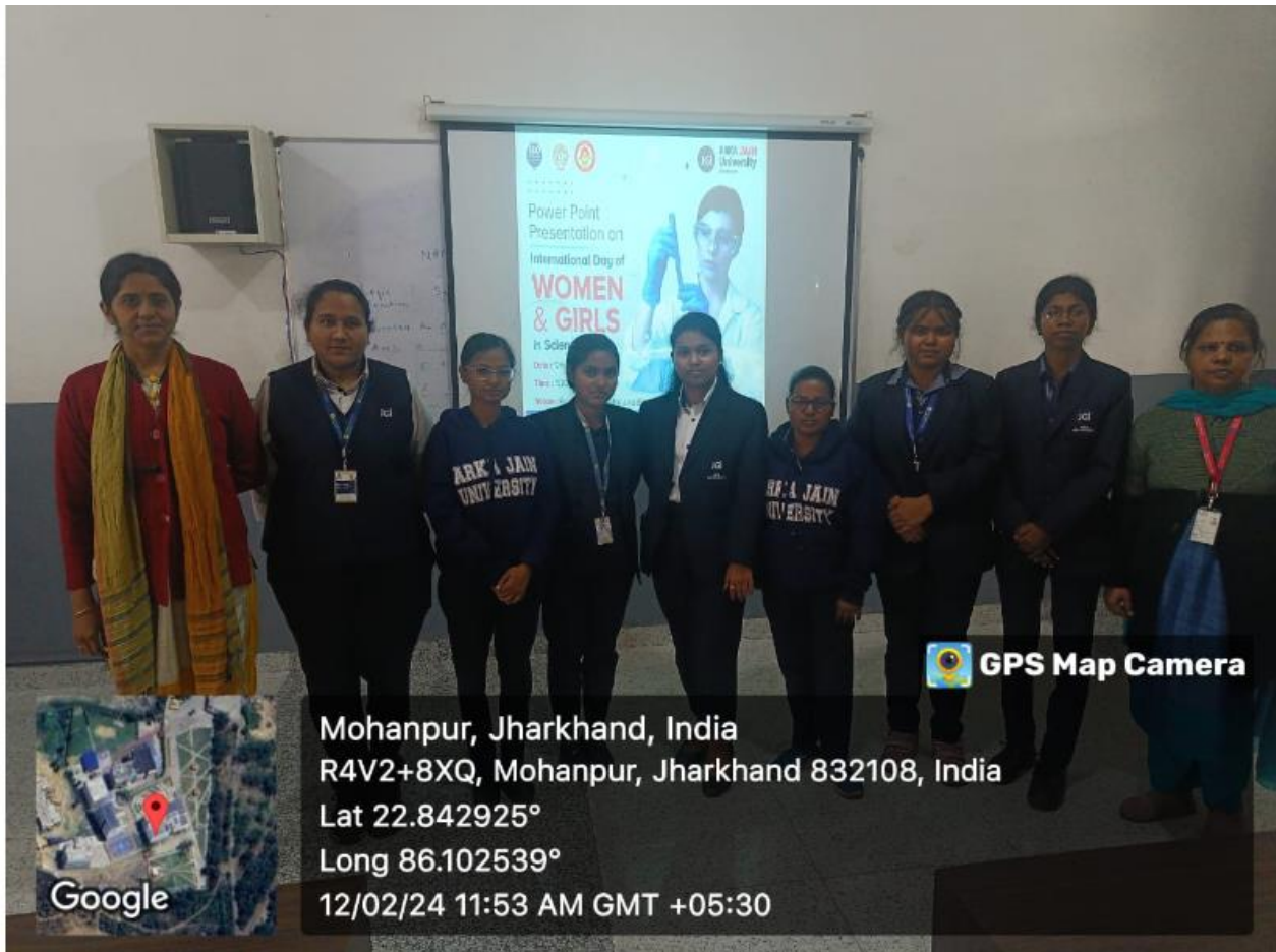
Photo of the Event: International Day of Women and Girls in Science