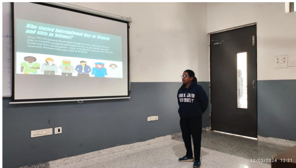
Photo of the Event: International Day of Women and Girls in Science