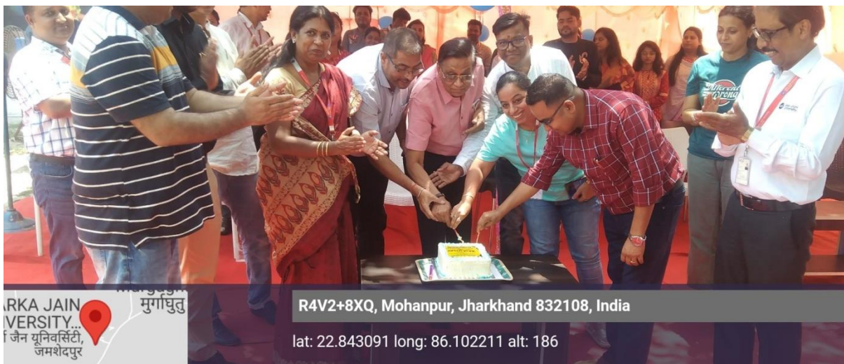
Dignitaries, Faculty members and students during the cake (RAJA PITHA) cutting ceremony