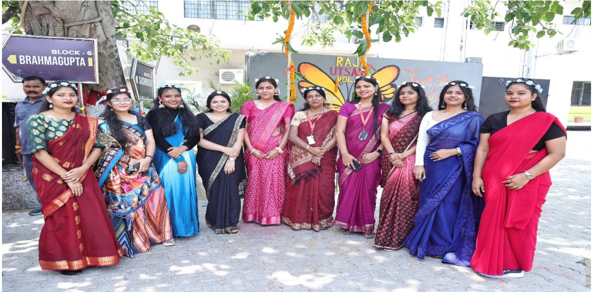
All the RAJA Queens in one frame real picture of to women empowerment