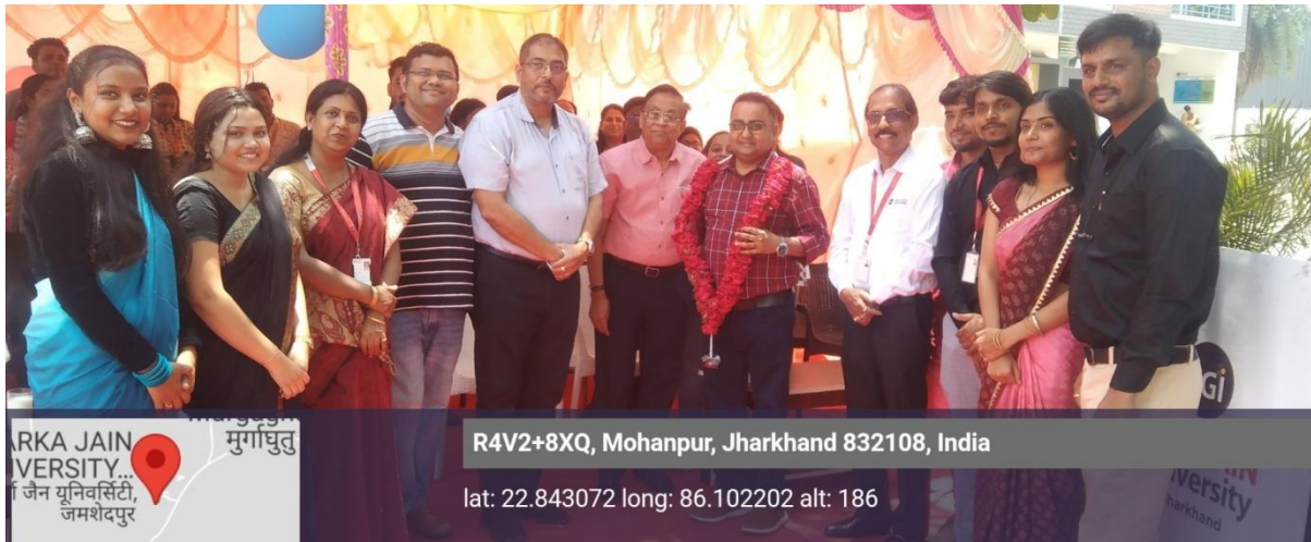
Dignitaries along with students during the opening ceremony of RAJA UTSAV 2024