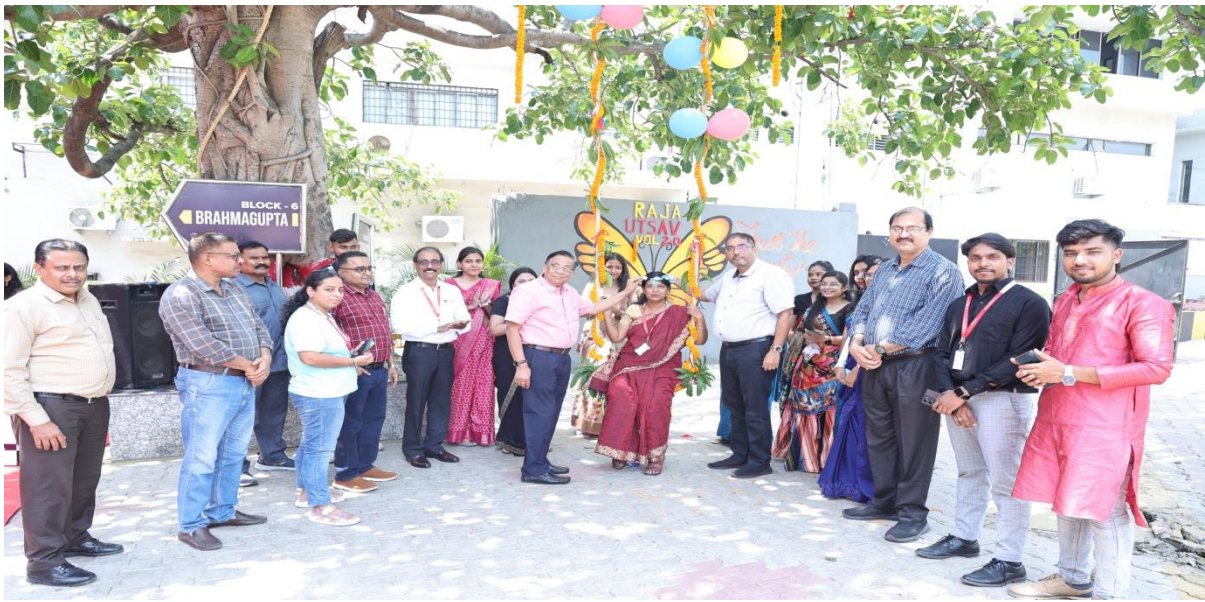
Student crowned as Raja Queen