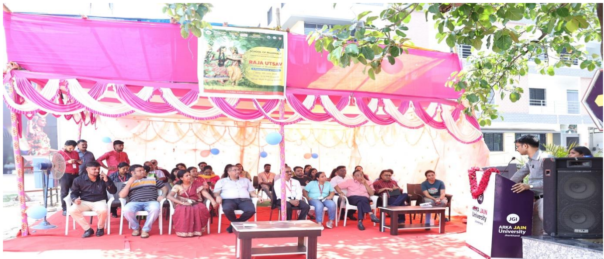
Celebrating Womanhood and Cultural Heritage: Raja Utsav 2024 at ARKA JAIN University