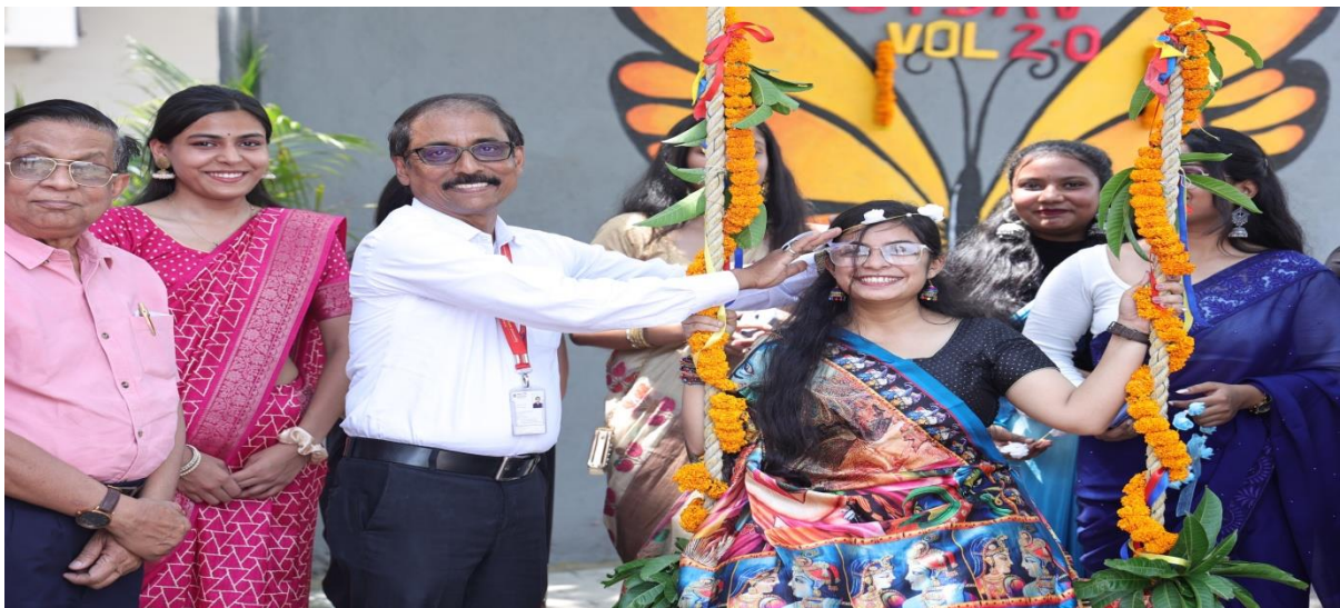
Female faculties enjoying the Pata Dholi