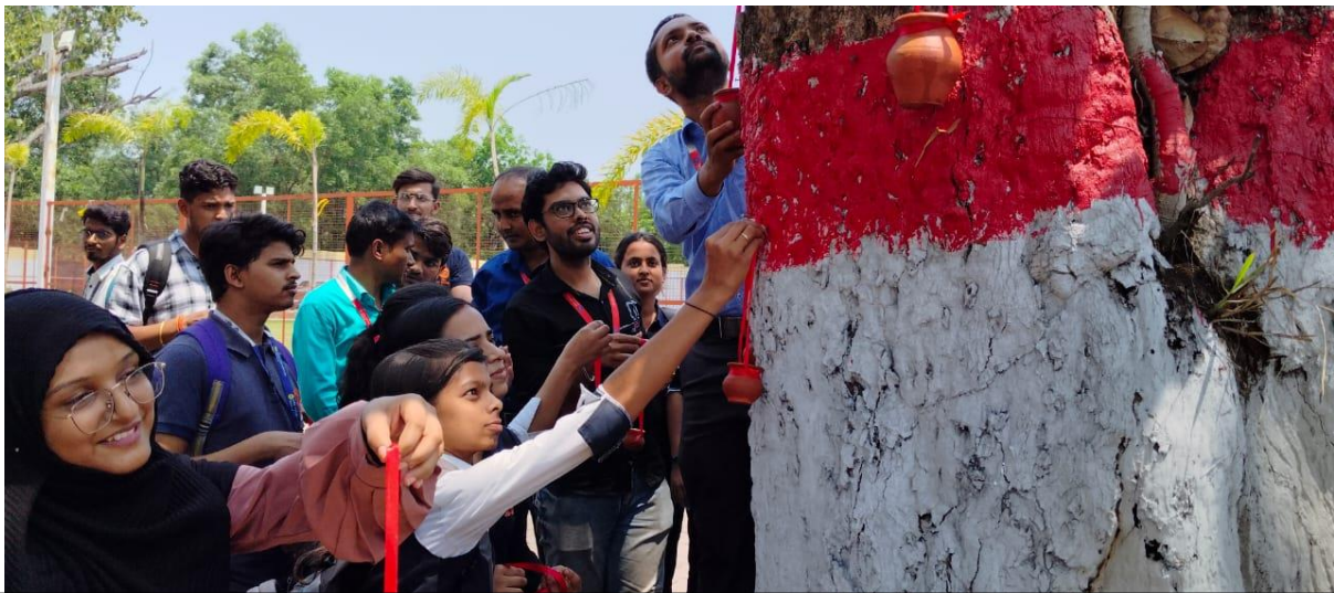
Students hanging earthen pots to provide a sanctuary for birds on the eve of World Bird Day