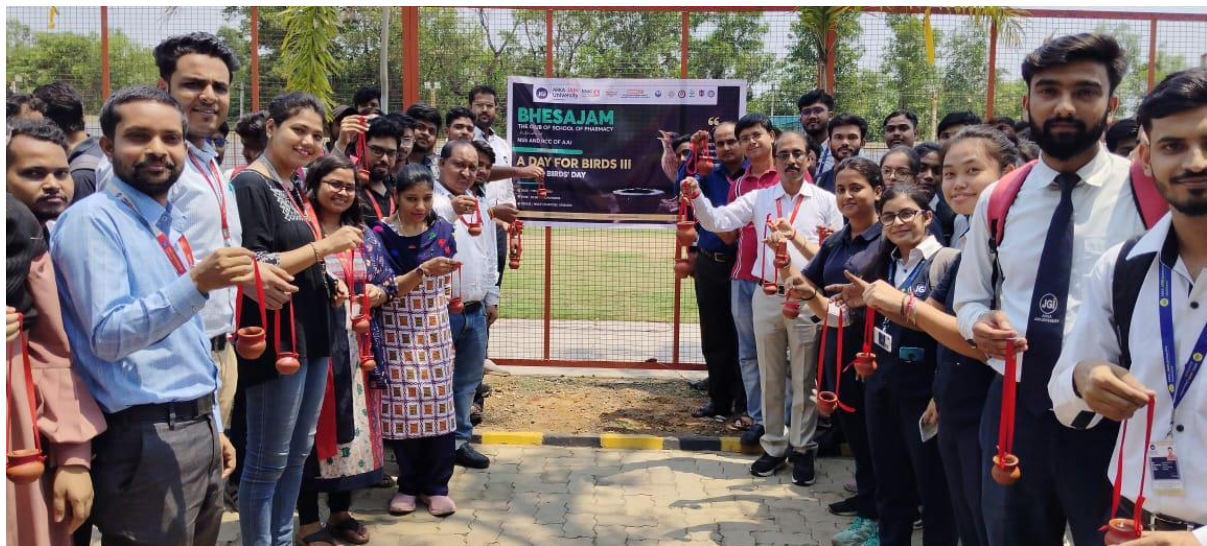
Armed with earthen pots, pharmacy faculty and students gear up to adorn the campus on the eve of World Bird Day. a day dedicated to our feathered friends