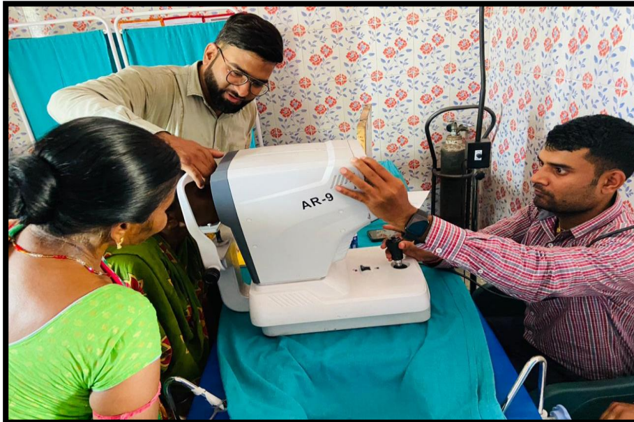
Figure 4: Students informing about treatment options available for Cataracts.