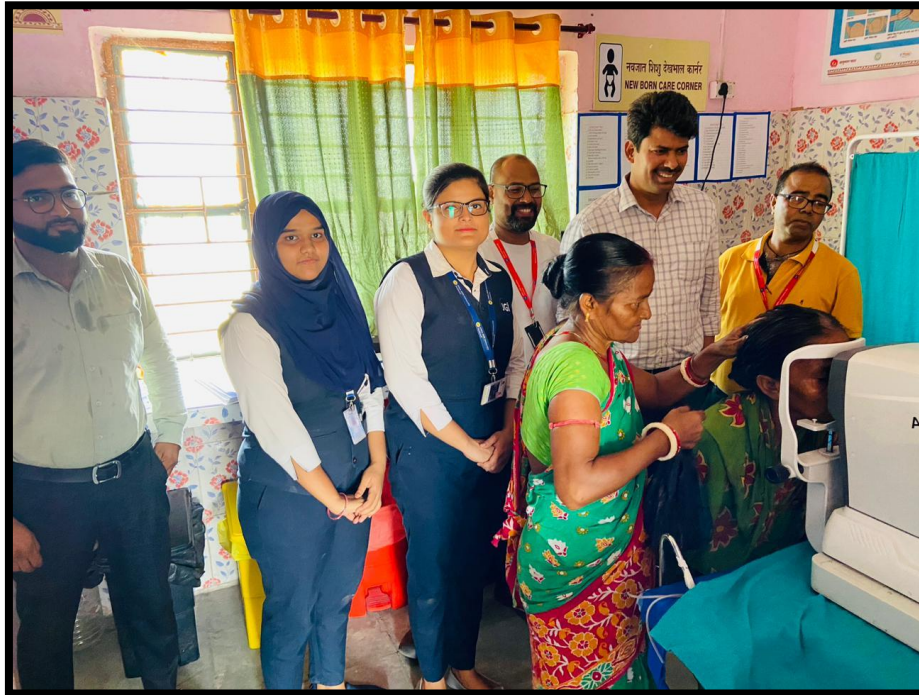
Figure 3: Initial Screening to Help & Identify Individuals with Vision Problems