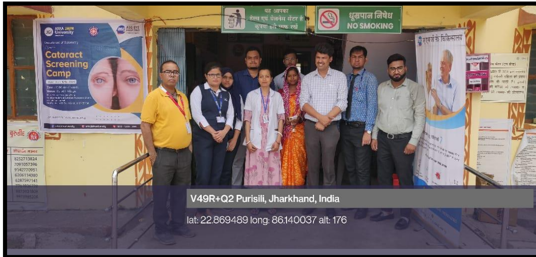
Figure 2: Geo Tag Photo of the Event