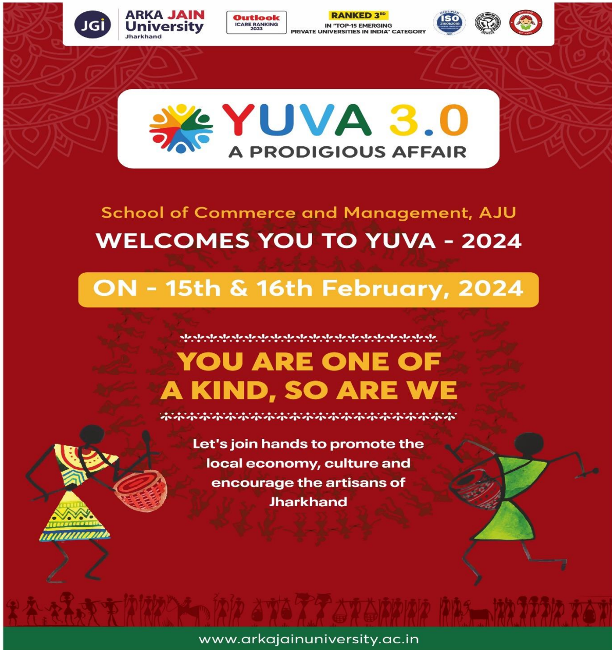
Figure 1: Poster of YUVA 3.0