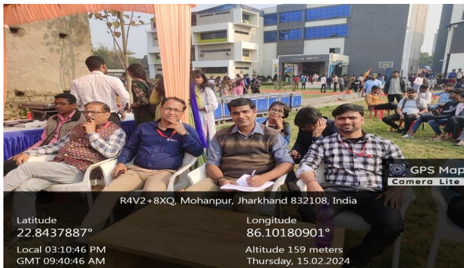
Figure 3: Students participating in the Event