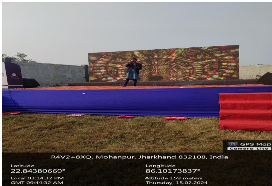
Figure 2: Group Photo During the Event