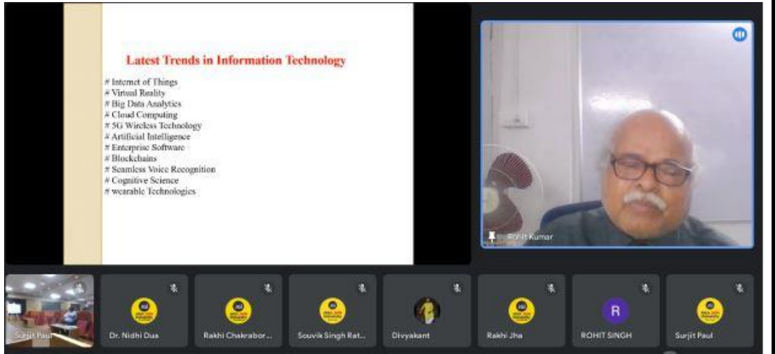
Esteemed Guest throwing light on the latest trends in IT