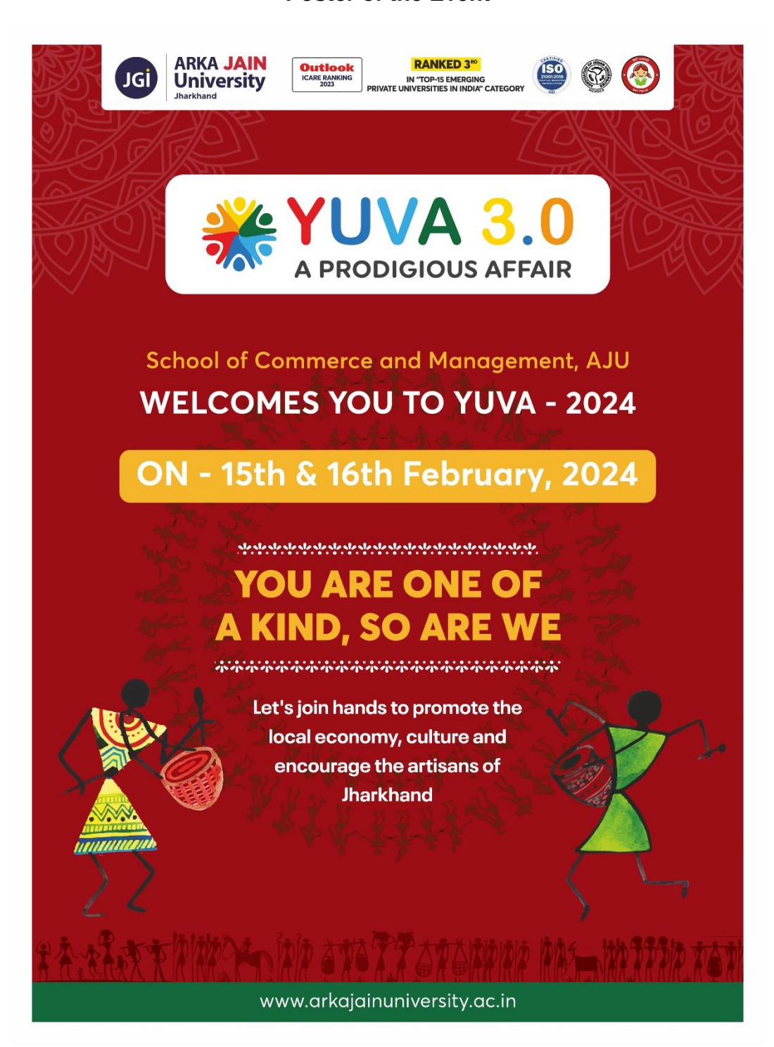
Figure 1: Poster of YUVA 3.0