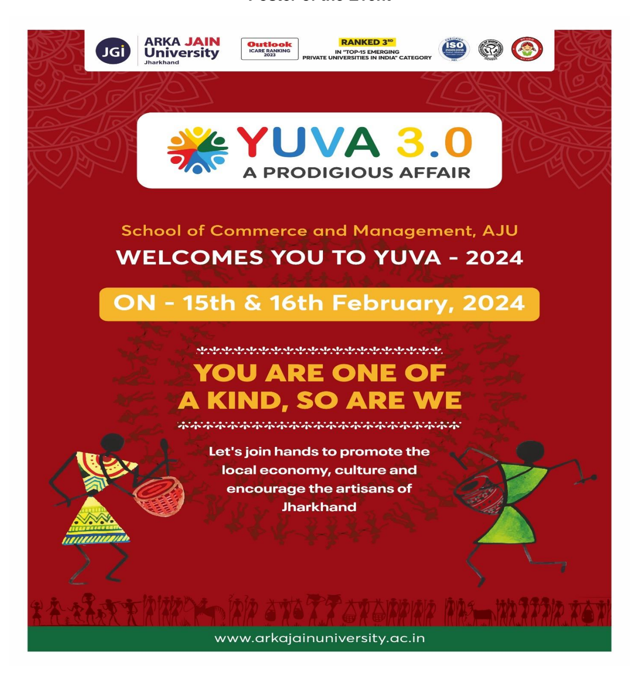
Figure 1: Poster of YUVA 3.0