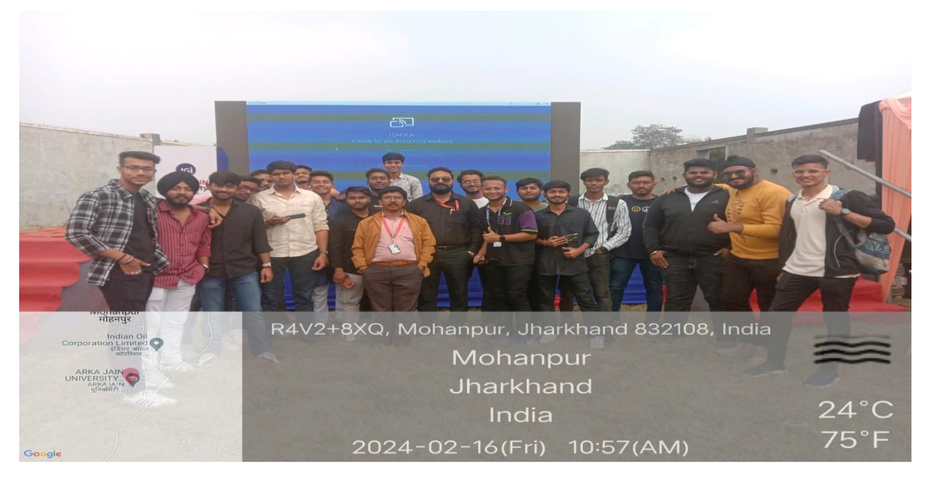
Figure 2: Group Photo During the Event