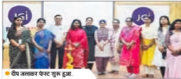
● दीप जलाकर फेस्ट शुरू हुआ।