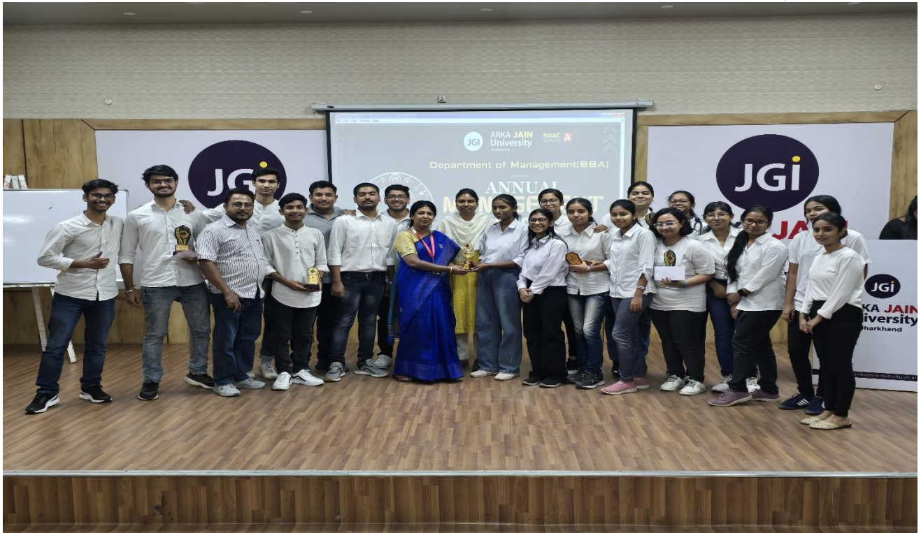
Figure 10: Group Photo of Overall Winners- Vidya Bharti Chinmaya Vidyalaya in MAN-E-FEST 2K24