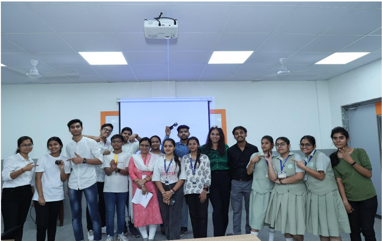
Figure 5: Photo of various schools showcasing their talent in AD MAD