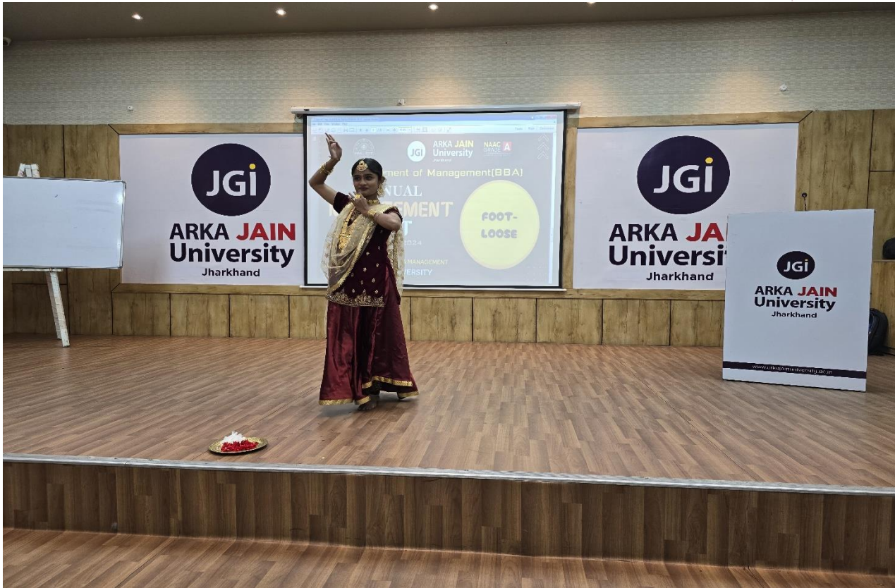
Figure 8: Photo of Foot Loose- Dance Competition