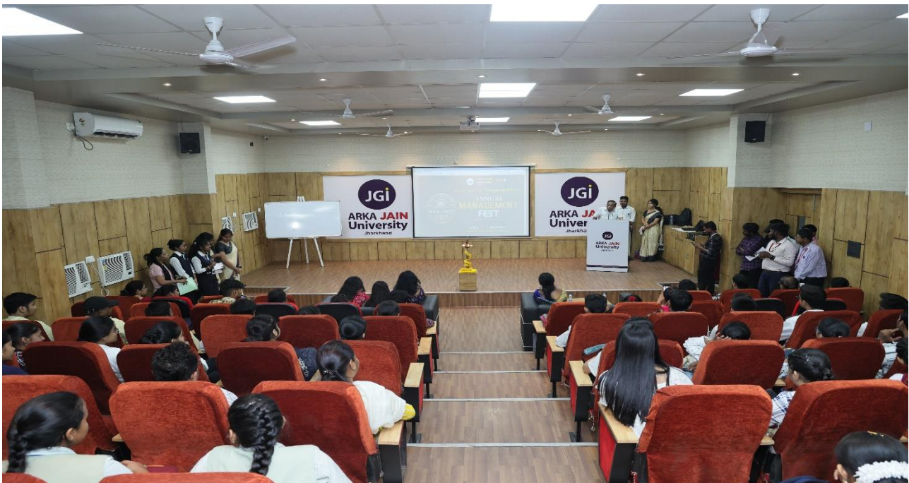
Figure 3: Addressal By Chairman, Board Of Management