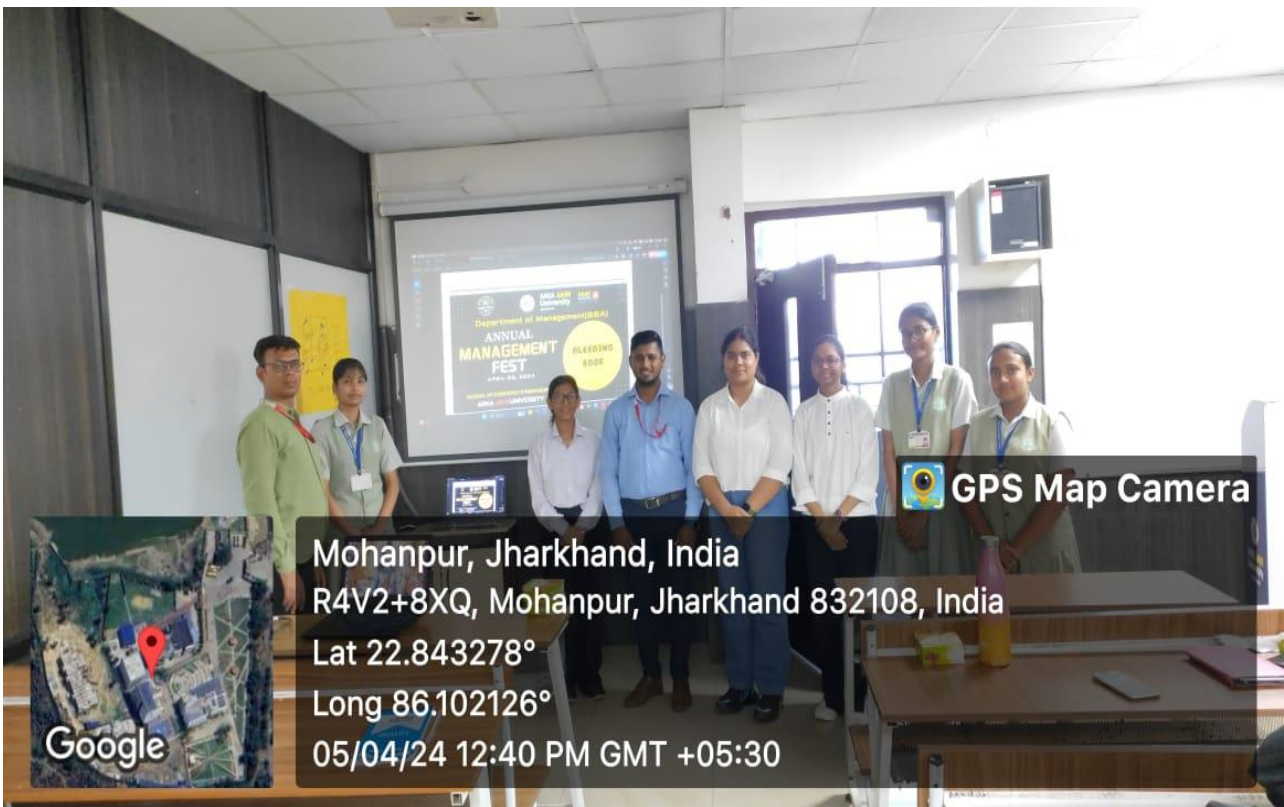
Figure : Photo of students participated in Bleeding Edge