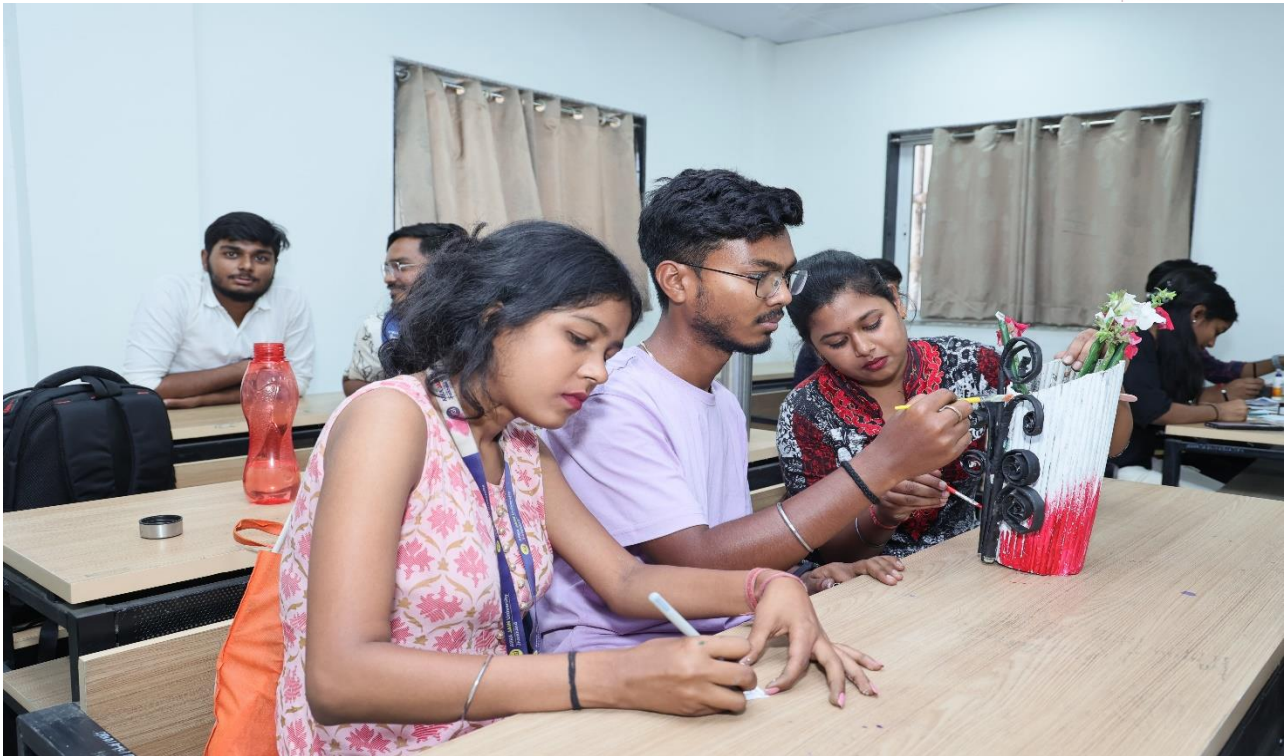
Figure 6: Photo of students showcasing their talent in Recycle Mania