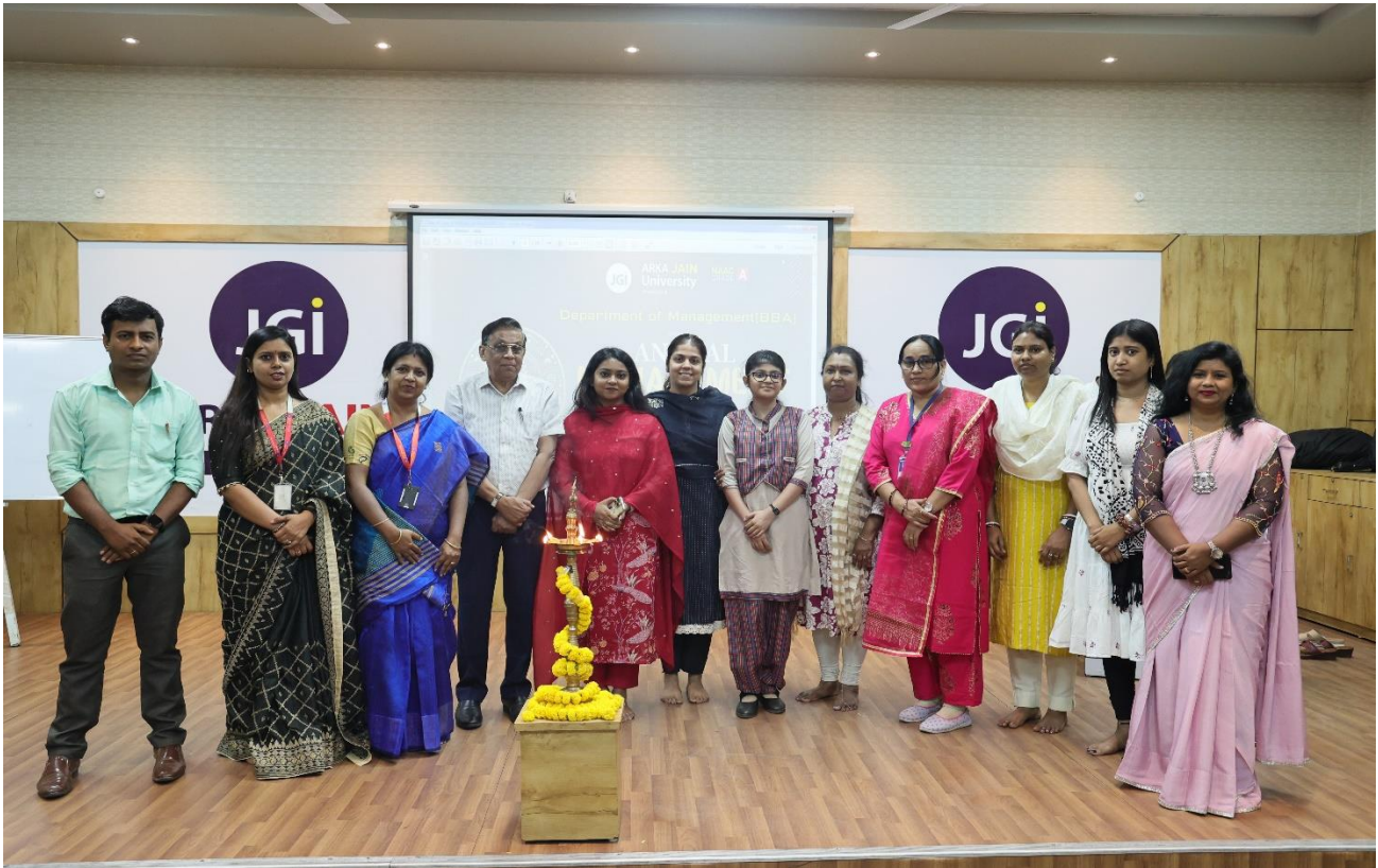
Figure 2: Group Photo of MAN-E-FEST 2K24 with School Co-ordinators - Lamp Lighting