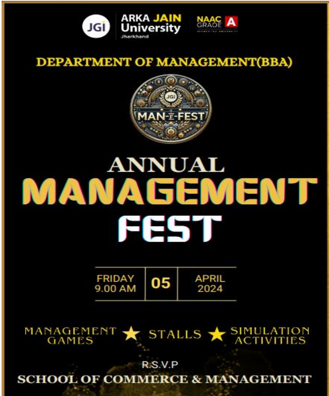
Figure 1 (a): Poster of MAN-E-FEST 2K24