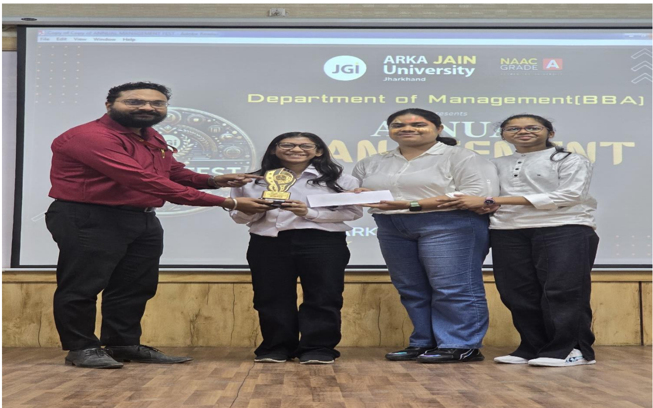
Figure 9: Photo of Students receiving Prizes