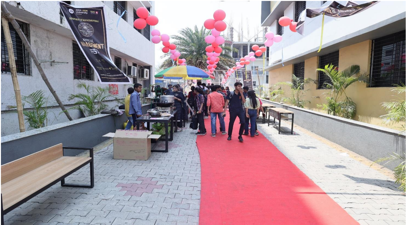
Figure 4: Photo of Various stalls put up in the MAN-E-FEST 2K24