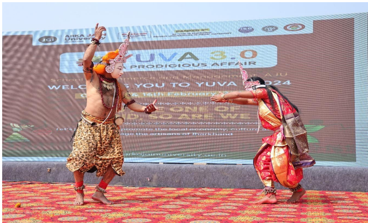
Figure 3: Chhau Dance Performance- Showing the Culture of Jharkhand