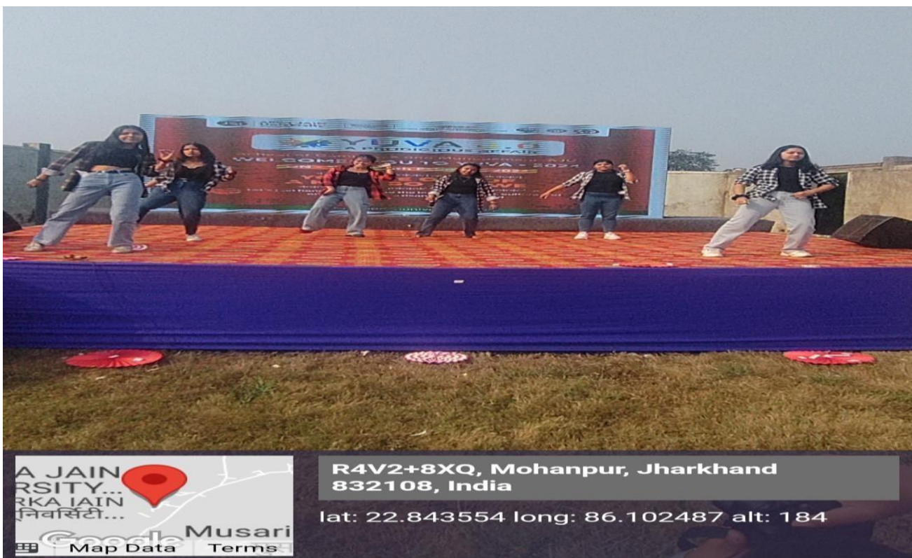
Figure 5 (b): Geo-Tagged Photos of Dance Competition