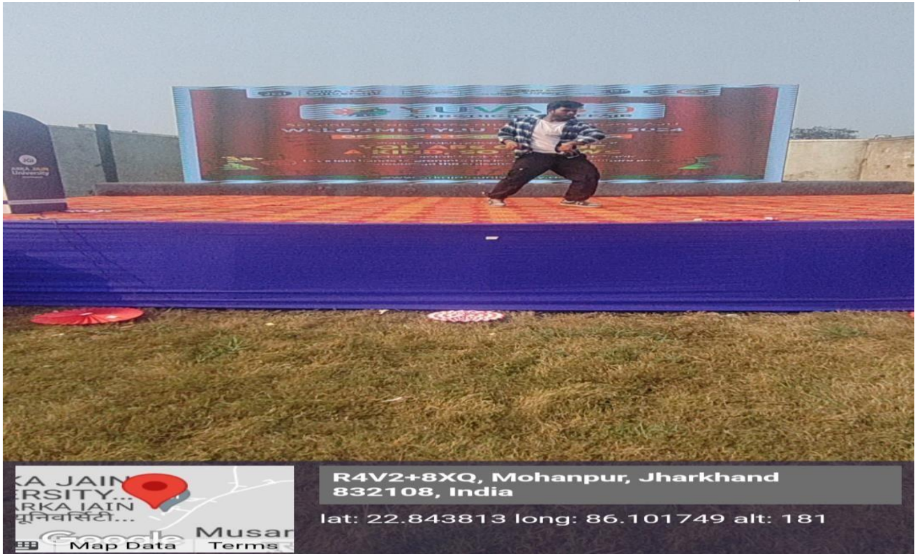
Figure 5 (a): Geo-Tagged Photos of Dance Competition