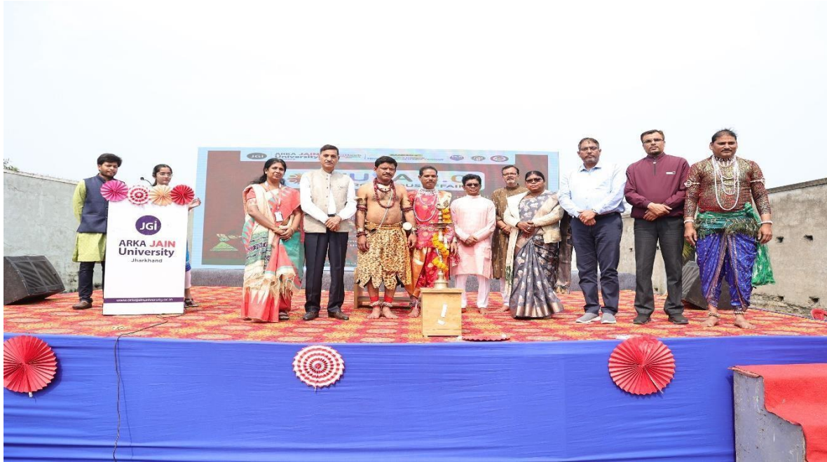
Figure 2: Group Photo of YUVA 3.0