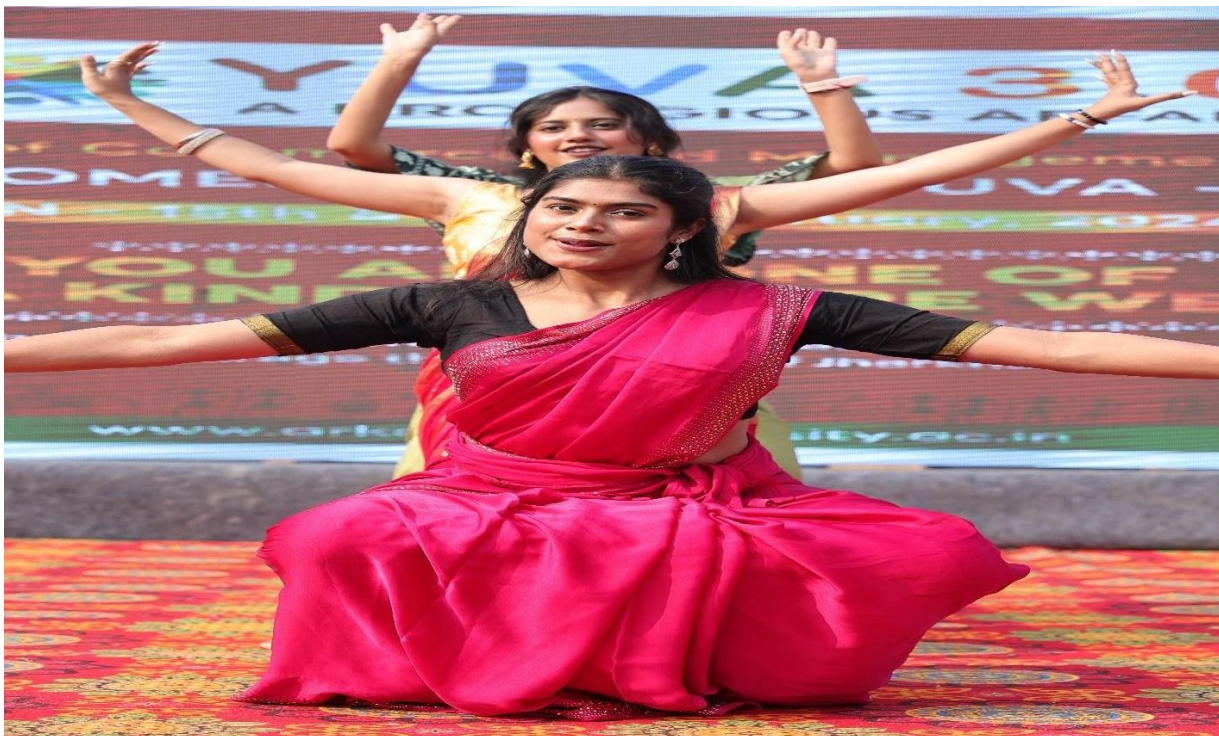
Figure 4 (b): Photo of Dance Competition