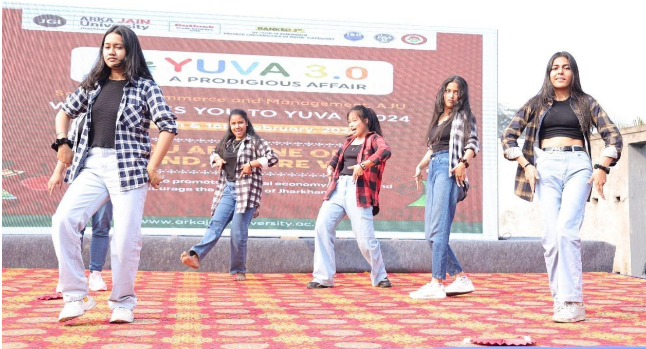
Figure 4 (a): Photo of Dance Competition