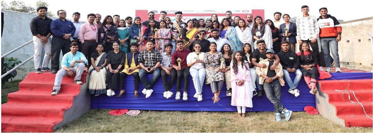
Figure 6: Group Photo of Winners and Team YUVA 3.0