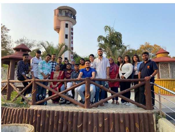
Students and faculty members assembled near Hirakud Dam- World's Longest Dam