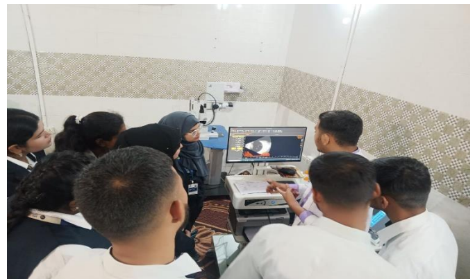
Students getting demonstration of handling a B Scan probe.