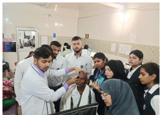
Students participating in demonstration of Diagnostic instruments (B Scan)