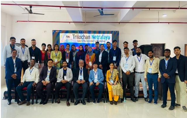
Team of the expert lecturers, pioneers and clinicians who gave conferences competition