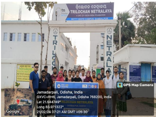
Students and faculty members assembled outside the premises of Trilochan Netralaya