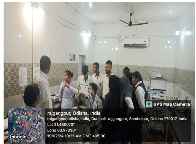
Students getting demonstration Specular microscopy