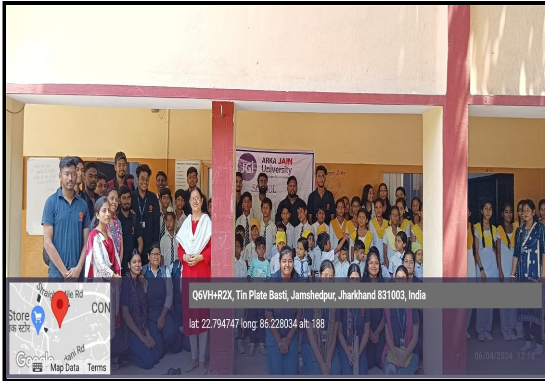
Figure 3: Group Photo of the entire Team