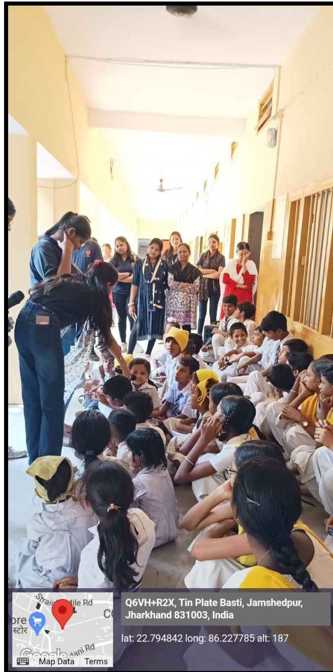
Figure 2: Photo of students taking a session on Health and Nutrition