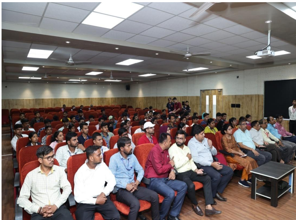
Students and faculty members of various departments assembled for awareness campaign