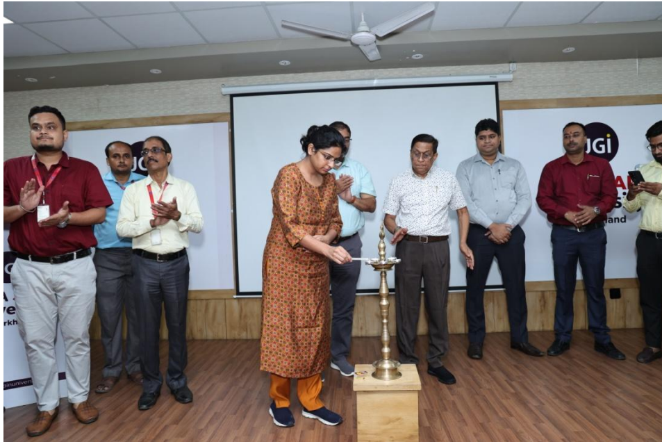
Guests and dignitaries lighting the lamp