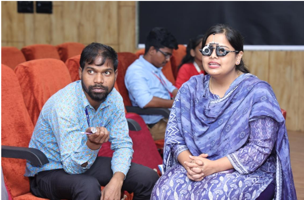
Staff and students availing the free eye check up service organized by ASG and Dept of Optometry, jointly