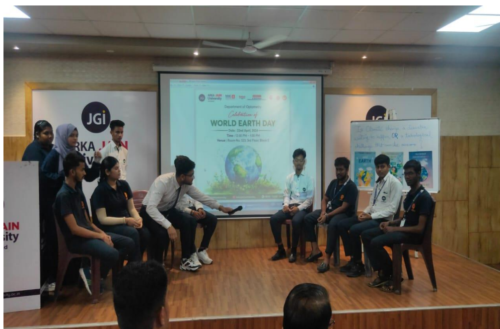
Students participating in World Earth Day Debate Competition.