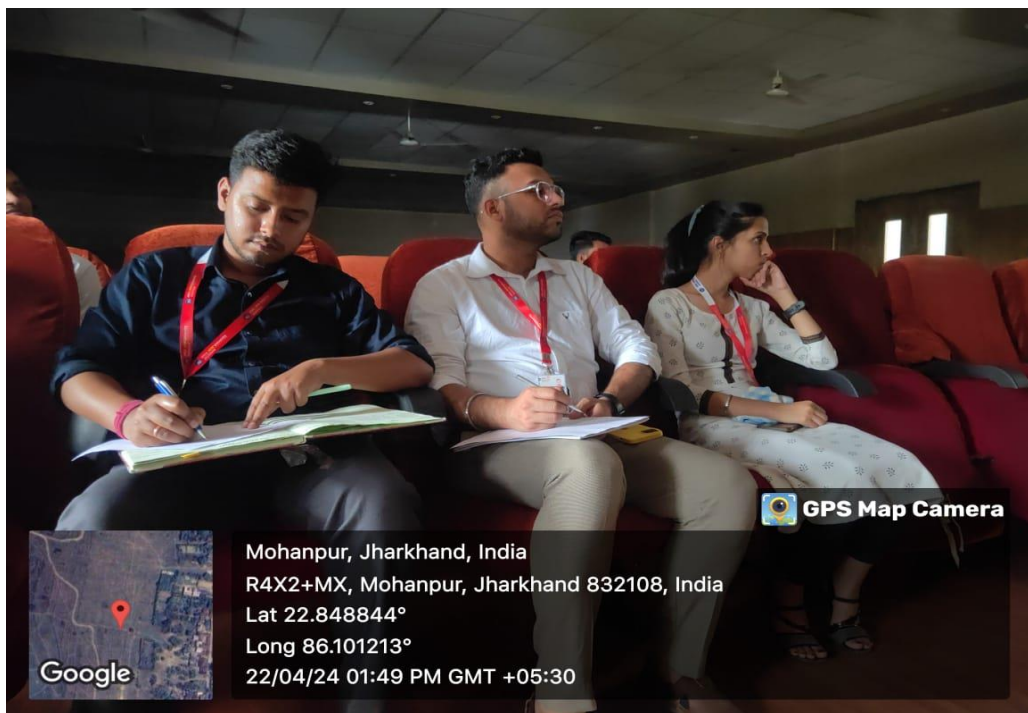
Judges marking the students' performance in the debate competition.