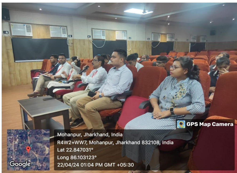
Faculties present in the World Earth Day Debate Competition.