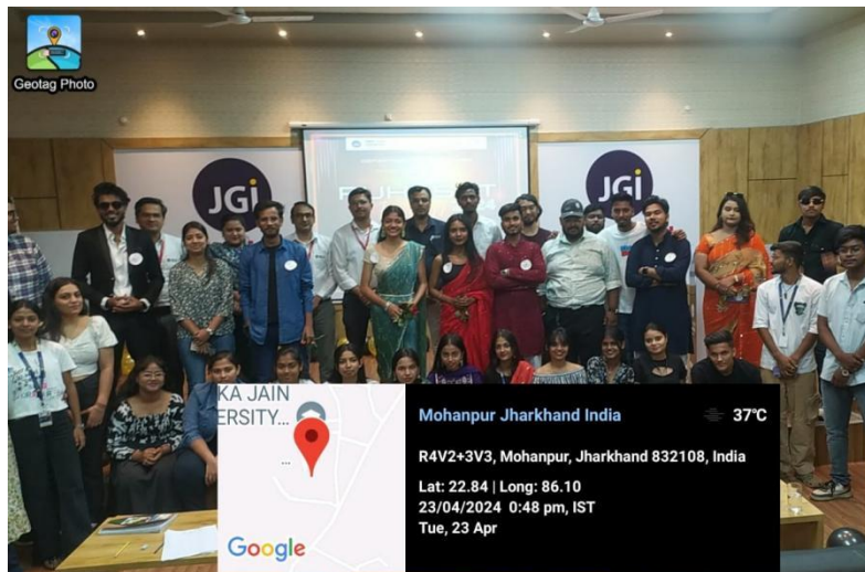
Figure 3: Passing out and current batch students during Rukhsat 2024, Farewell event