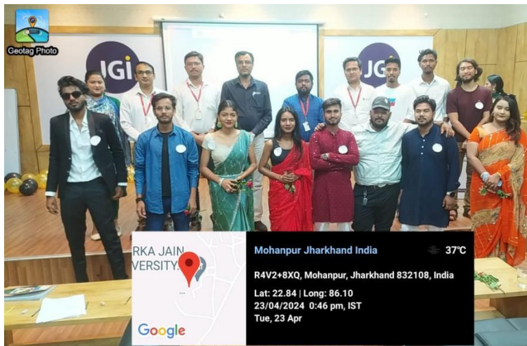
Figure 2: Passing out students (Batch 2021) with faculty member of Department of JMC