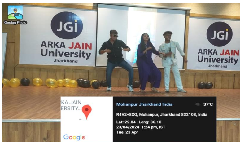
Figure 4: Dance performance of students during Rukhsat 2024, farewell event