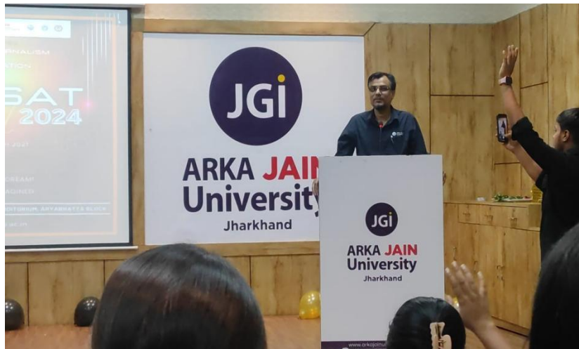
Figure 6: Head of the Department while interacting with the passing out students