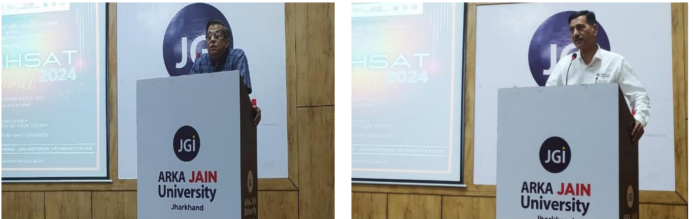
Figure 5: Honorable dignitaries of Arka Jain University while giving best wishes to the passing out students during Rukhsat 2024, farewell event.