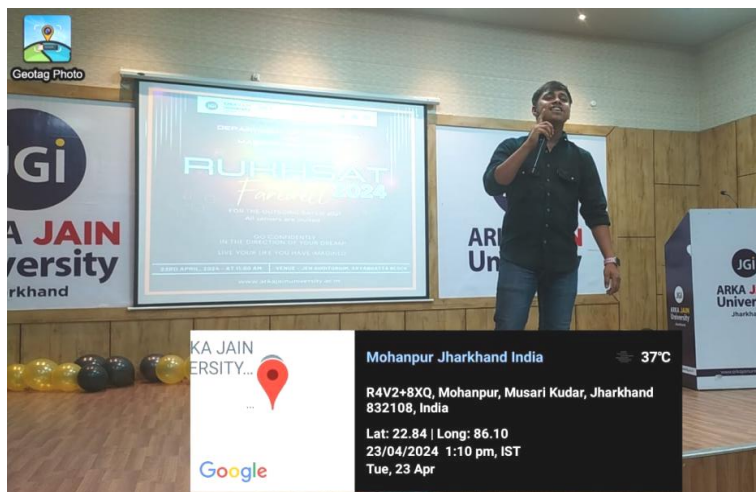
Figure 7: Singing performance by a student during Rukhsat 2024, farewell event.