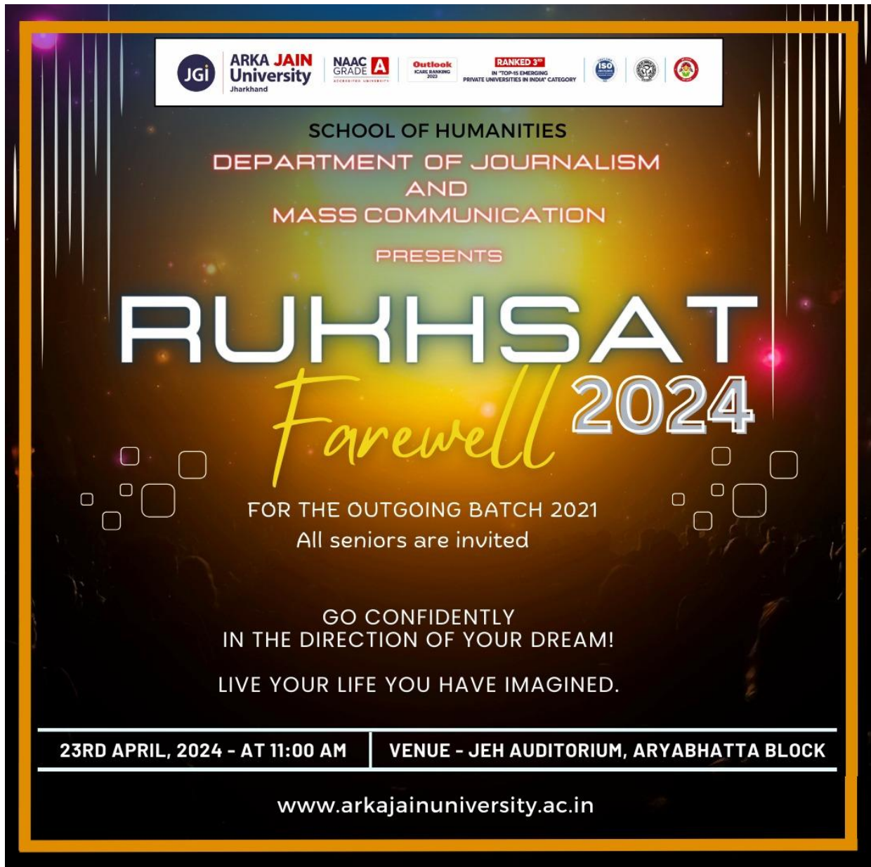
Figure 1: Poster of Rukhsat 2024