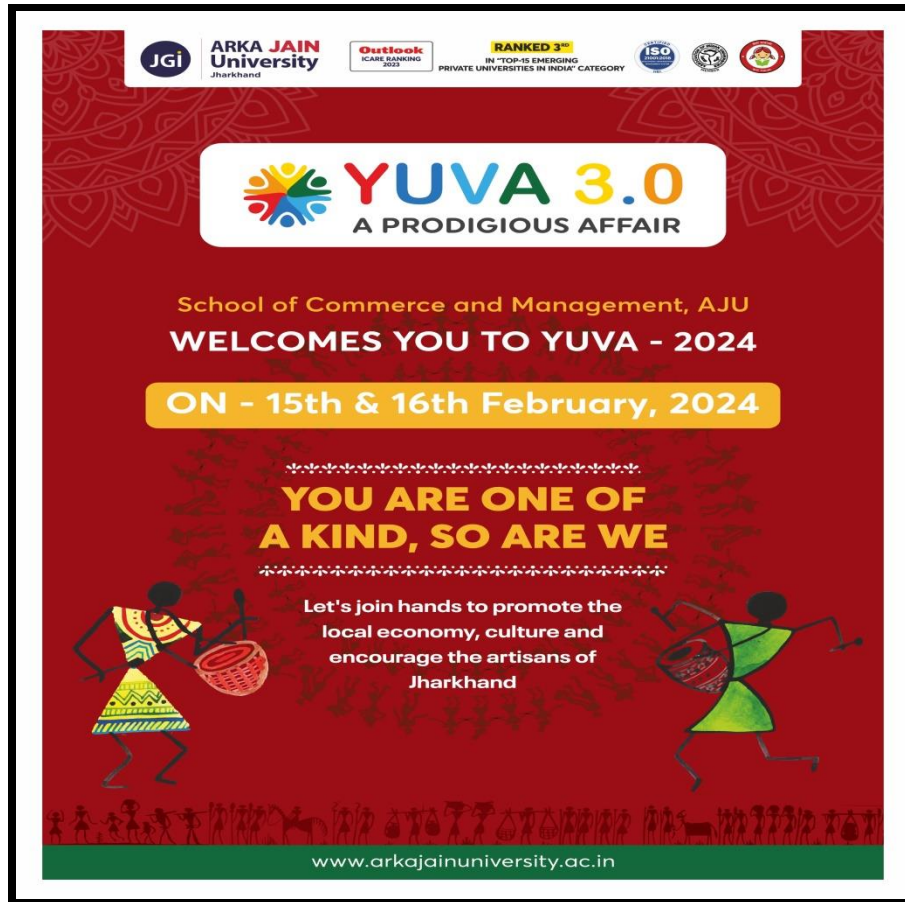
Figure 1: Poster of YUVA 2024