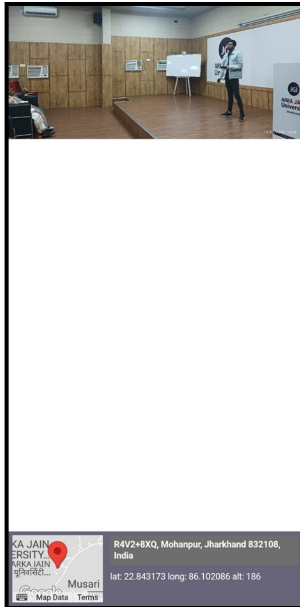
Figure 2: Student participating in the Event - Alfaaz