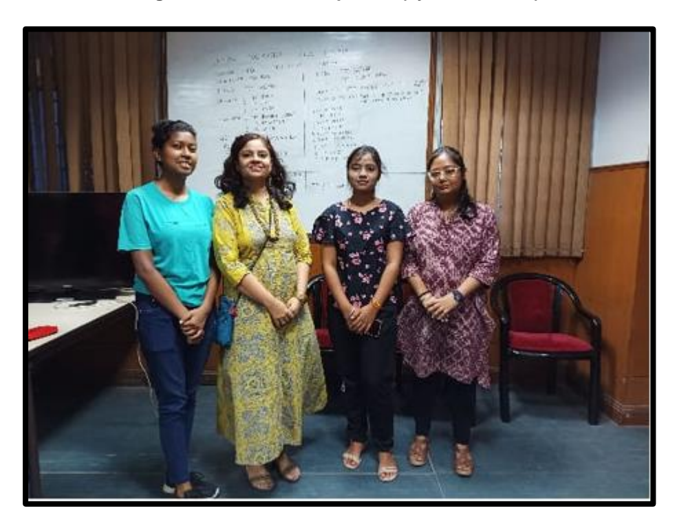
Figure 3: Our faculty and students as participants