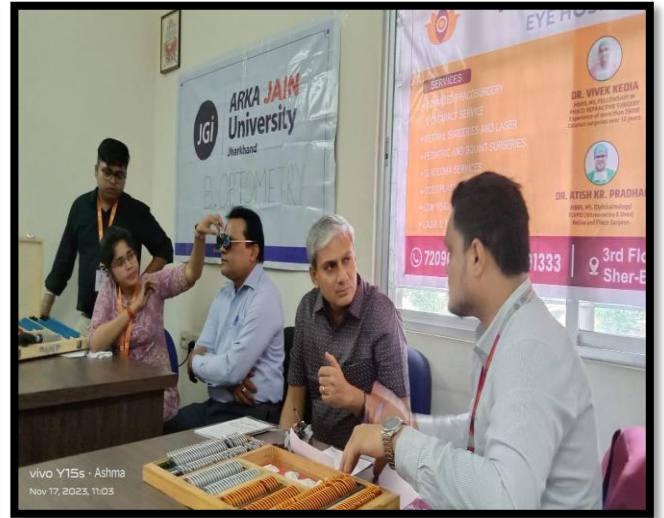
Figure 3: Patient Evaluation