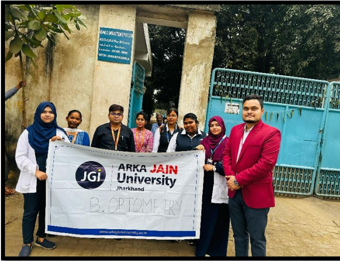
Figure 2: Screening team visited the location IEMCO Industries, Adityapur