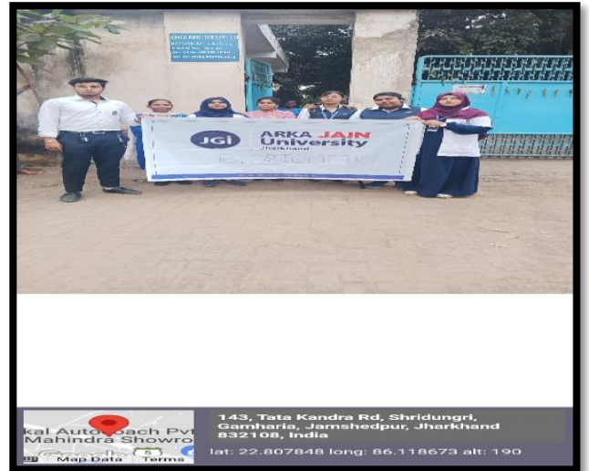
Figure 5: Camp Completion Group Photo