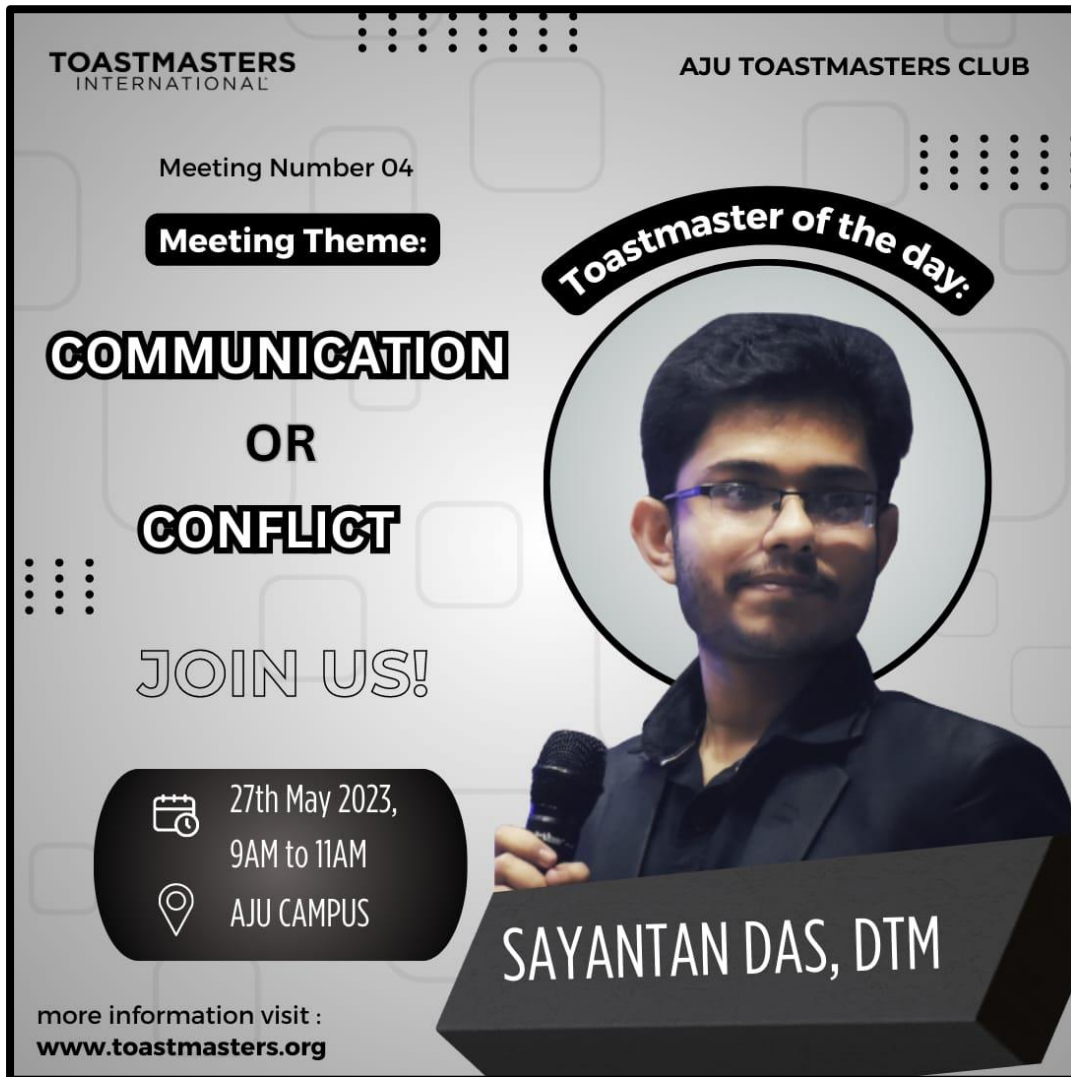
Figure 1: Poster of Communication or Conflict