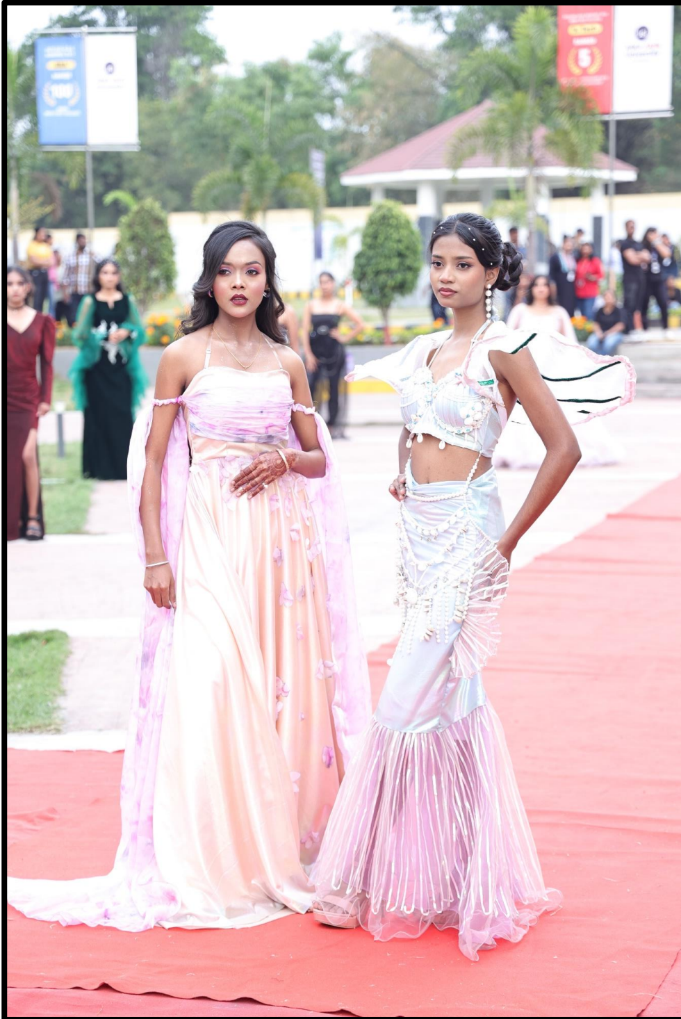
Figure 4: Student during Rampwalk