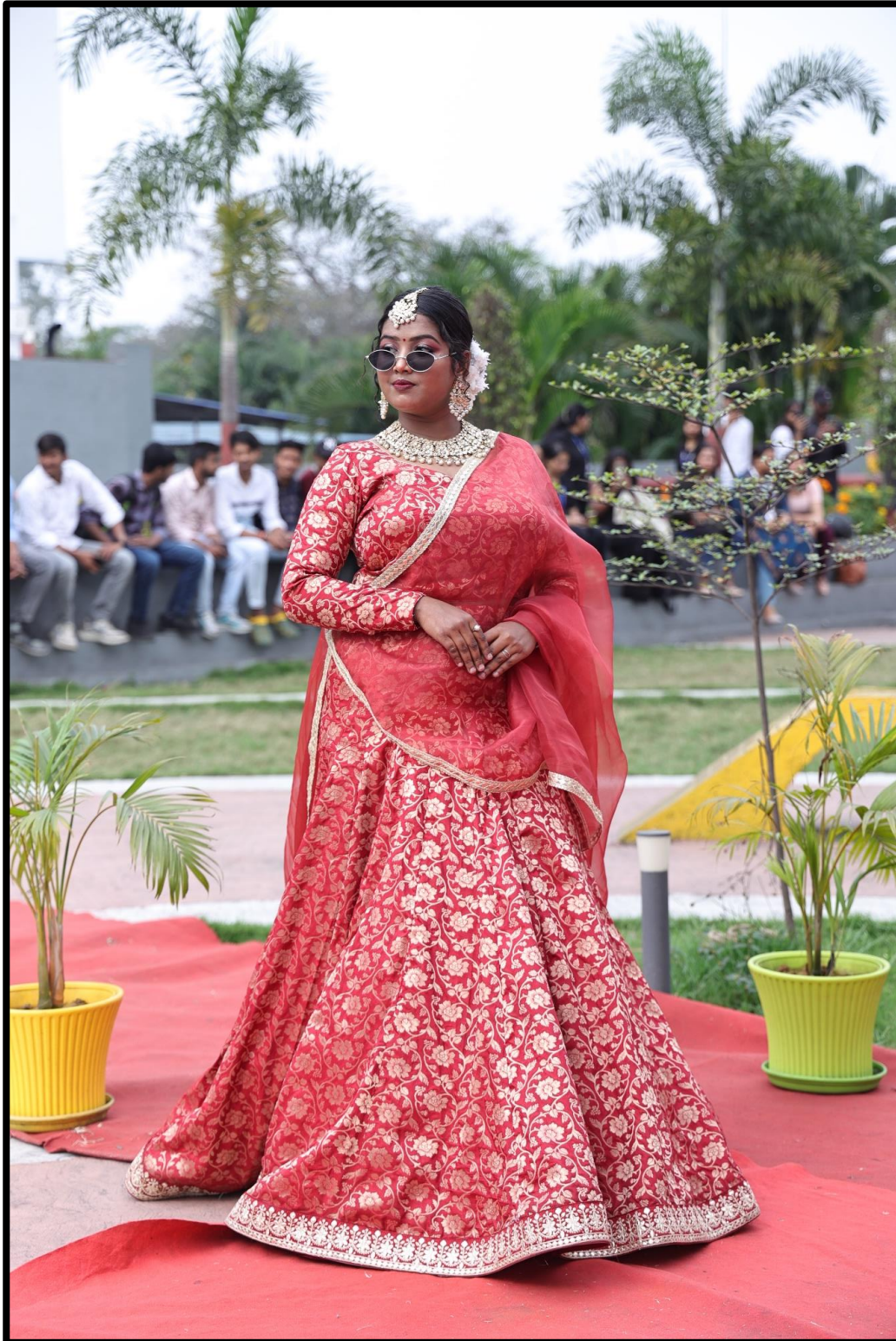
Figure 3: Student wearing Red Lehenga during fashion show