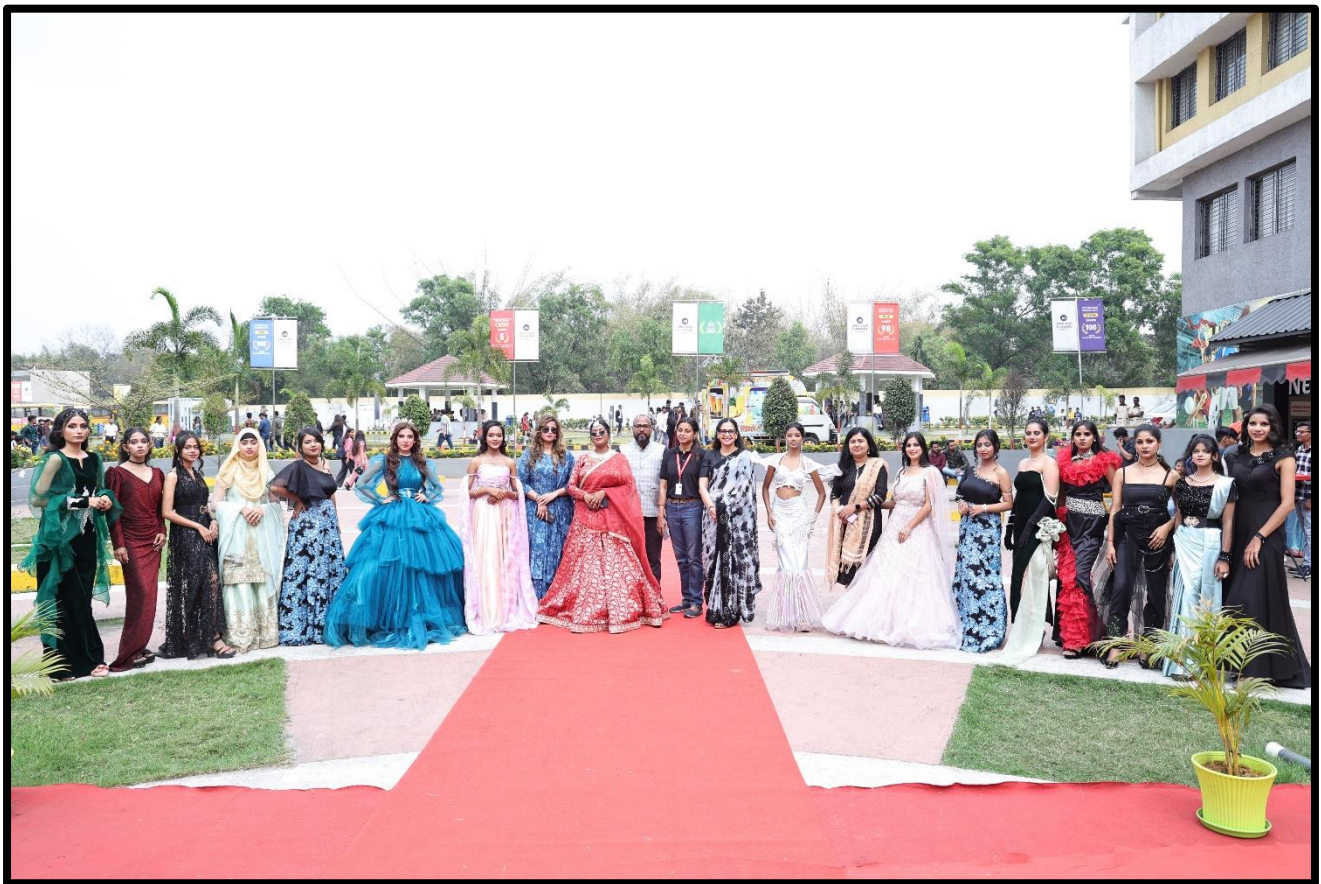
Figure 9: The final group picture with the student designers, student models, faculties and Guest of Honour