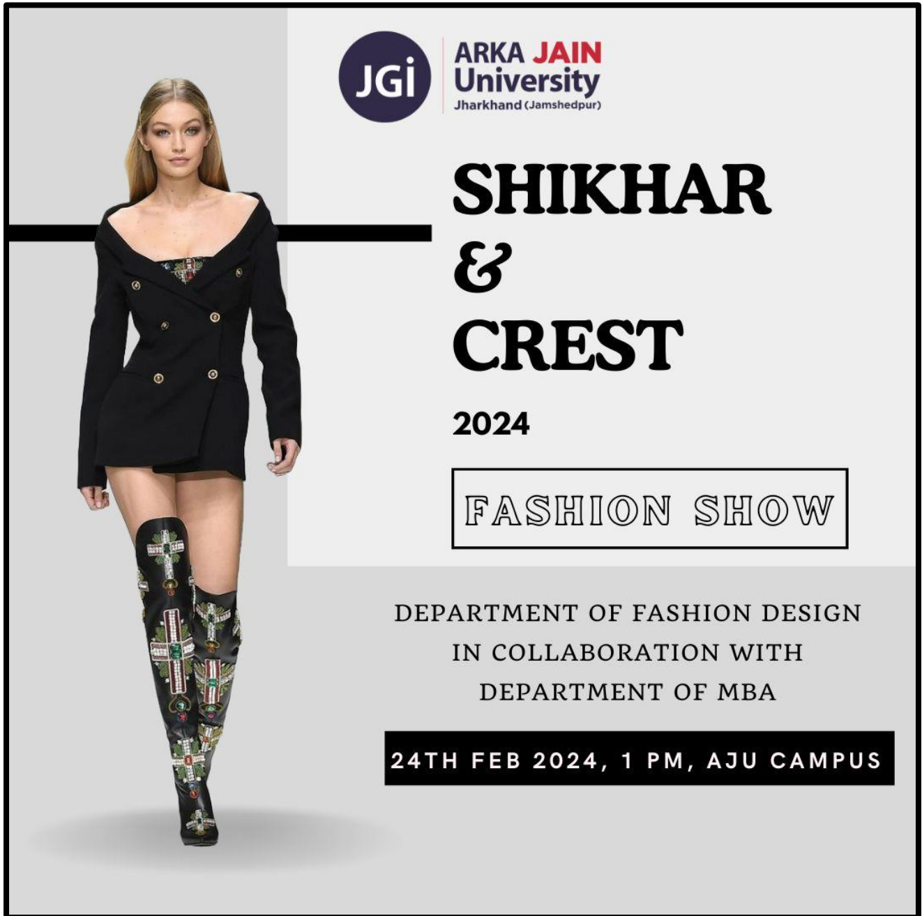
Figure 1: Poster of Shikhar & Crest 2024 Fashion Show