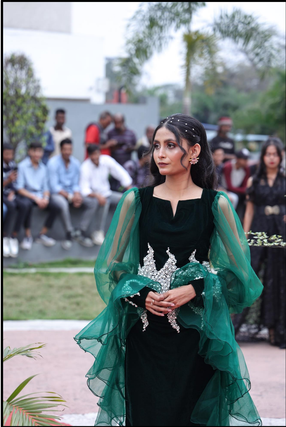
Figure 6: Student during Rampwalk