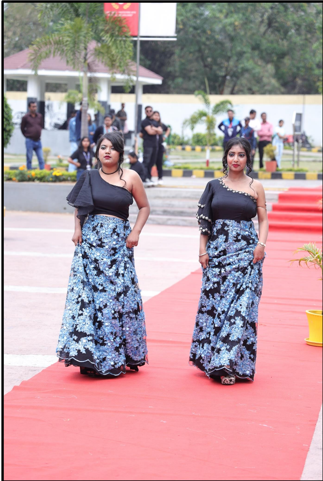
Figure 7: Student during Ramp walk