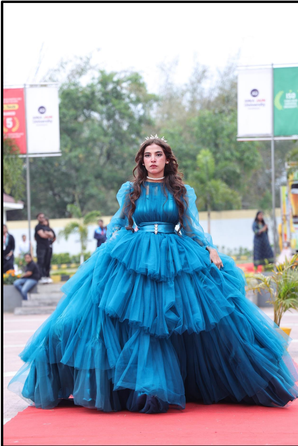
Figure 2: Student during Rampwalk