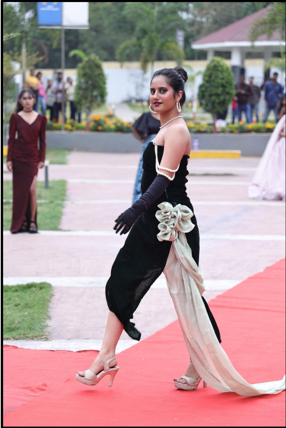
Figure 5: Student showcasing her talent during Rampwalk