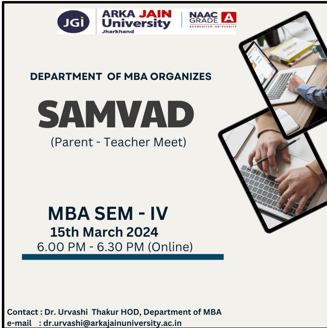
Figure 1: Poster of Samvad- Parents Teacher Meeting for MBA Semester-IV (2022-2024)