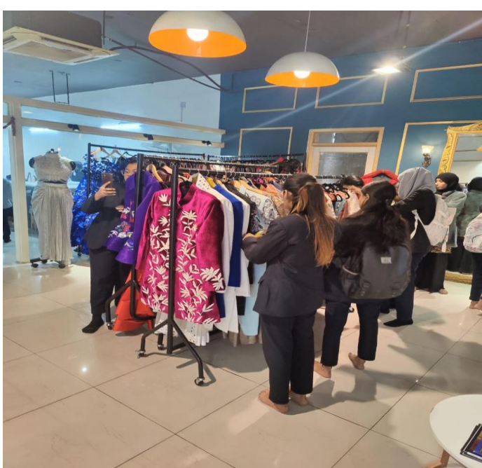
Figure 7 The design students immersed in exploration of fabrics, designs, styles and surface ornamentation of the apparels