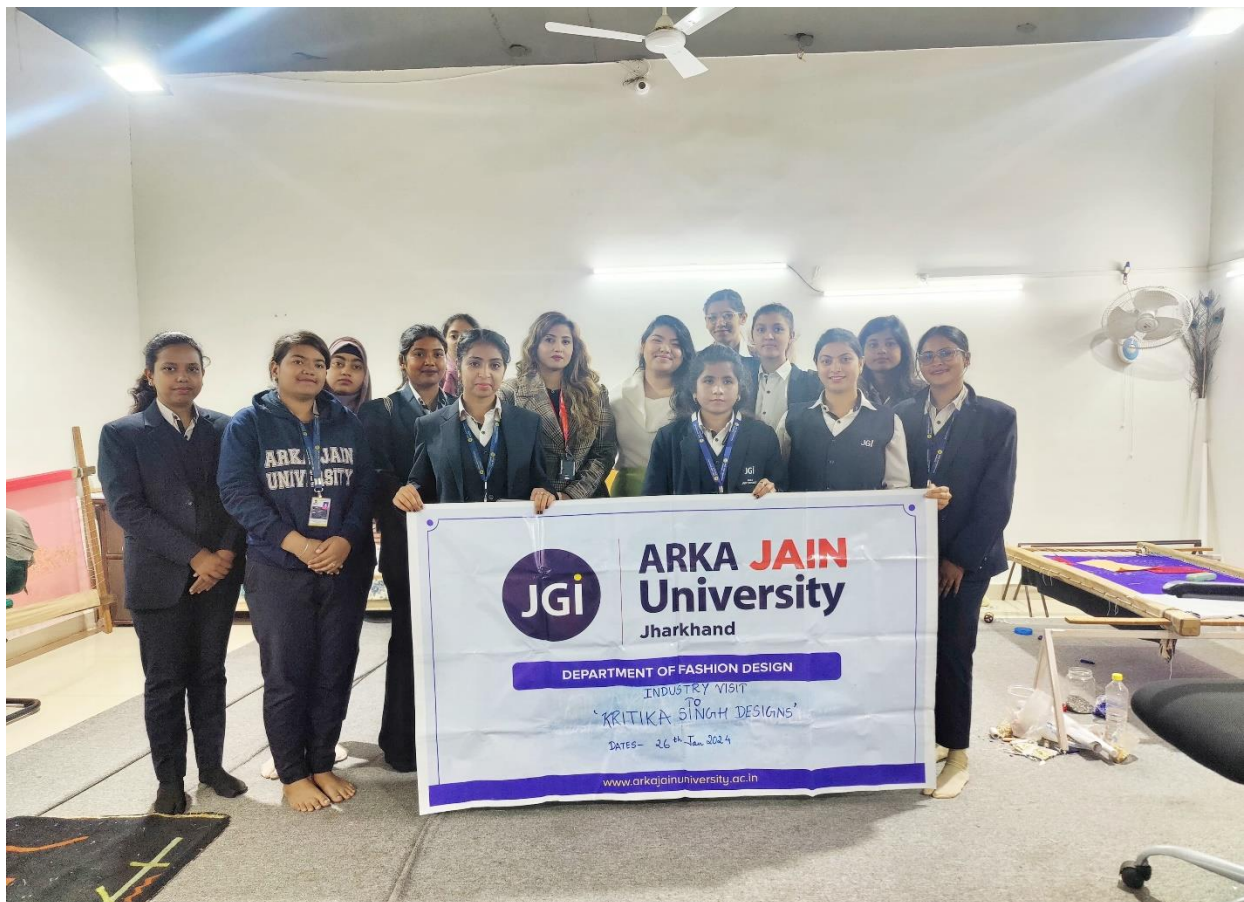
Figure 3: Group Photo