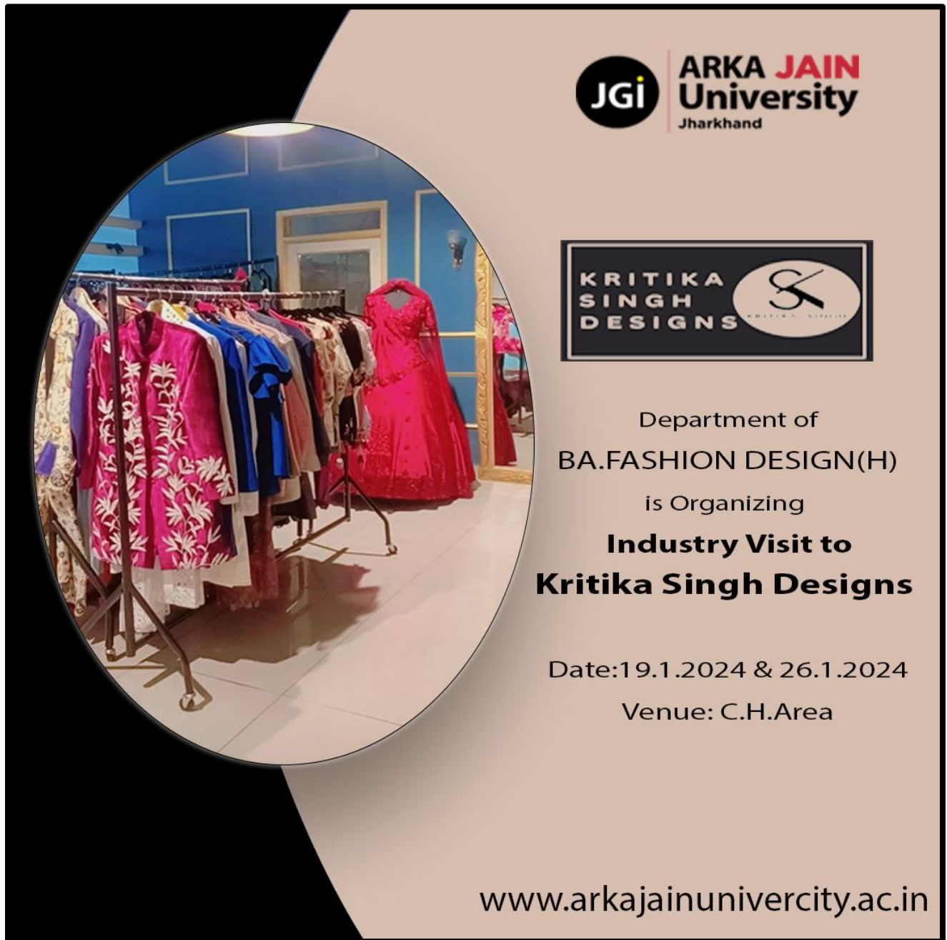
Figure 1: Poster of Industry Visit to Kritika Singh designs