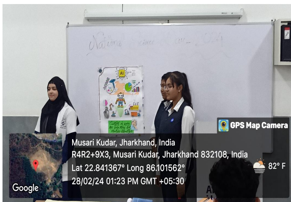
Students participating in the Poster Presentation Competition.