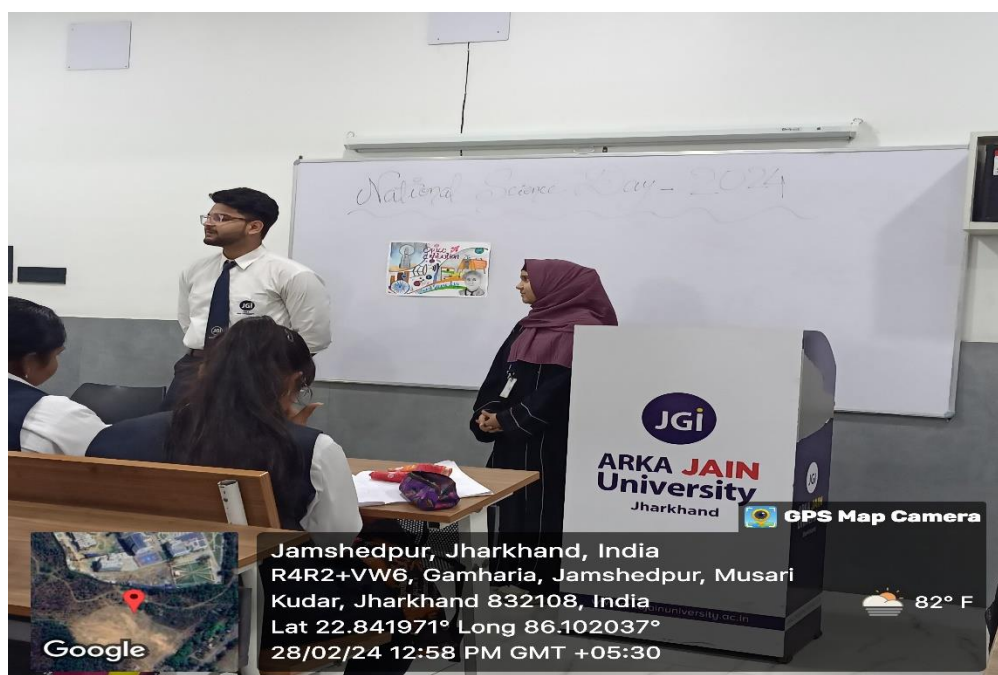
Students participating in the Poster Presentation Competition.