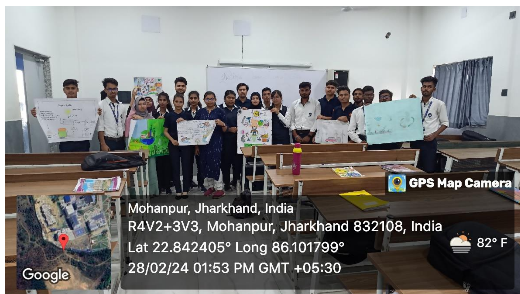
Students participating in the Poster Presentation Competition.