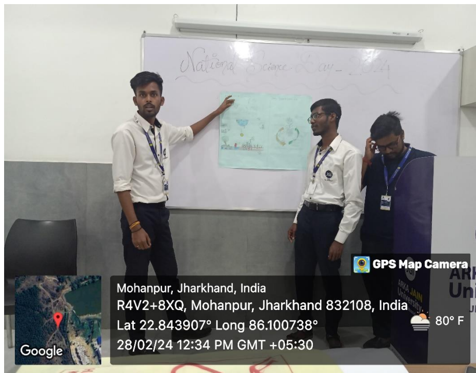
Students participating in the Poster Presentation Competition.