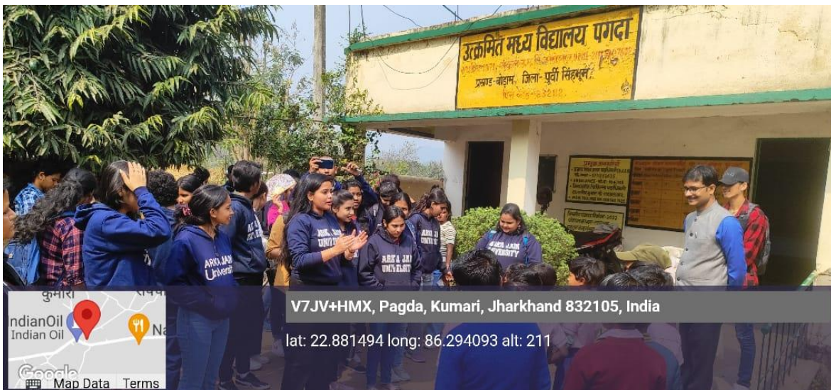
Figure 6: Departmental students interacting with Pagda Middle School Students