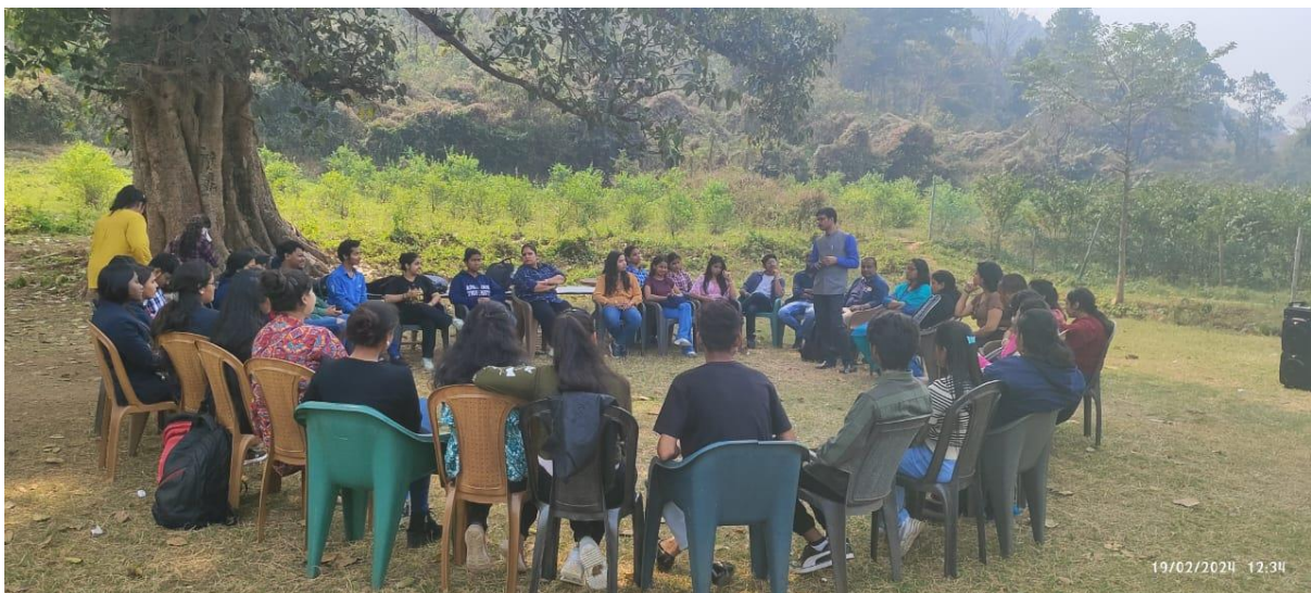
Figure 3: Discussion Session on Cultural Backdrops of Dalma Region during the Edu Trip