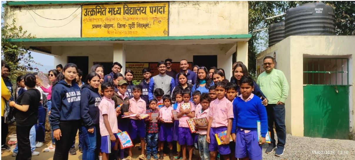
Figure 4: Students and Faculty Members with the Pagda Middle School Students