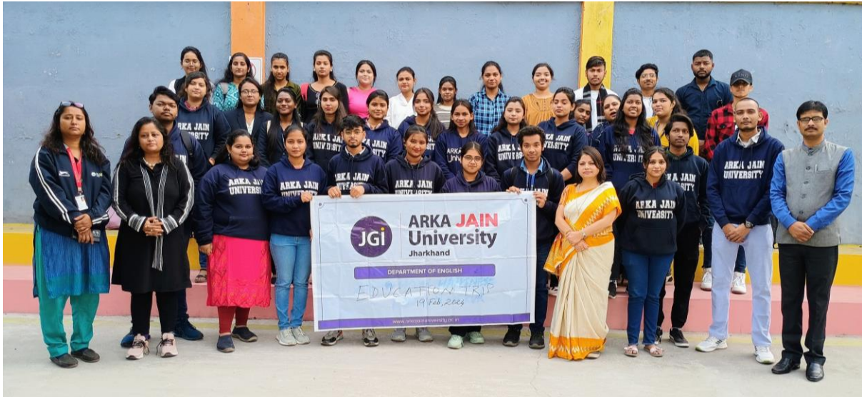
Figure 2: Students and Faculty Members ready for the Educational Trip