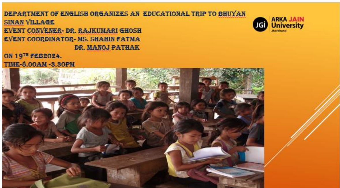
Figure 1: Poster of Educational Trip for Cultural Studies