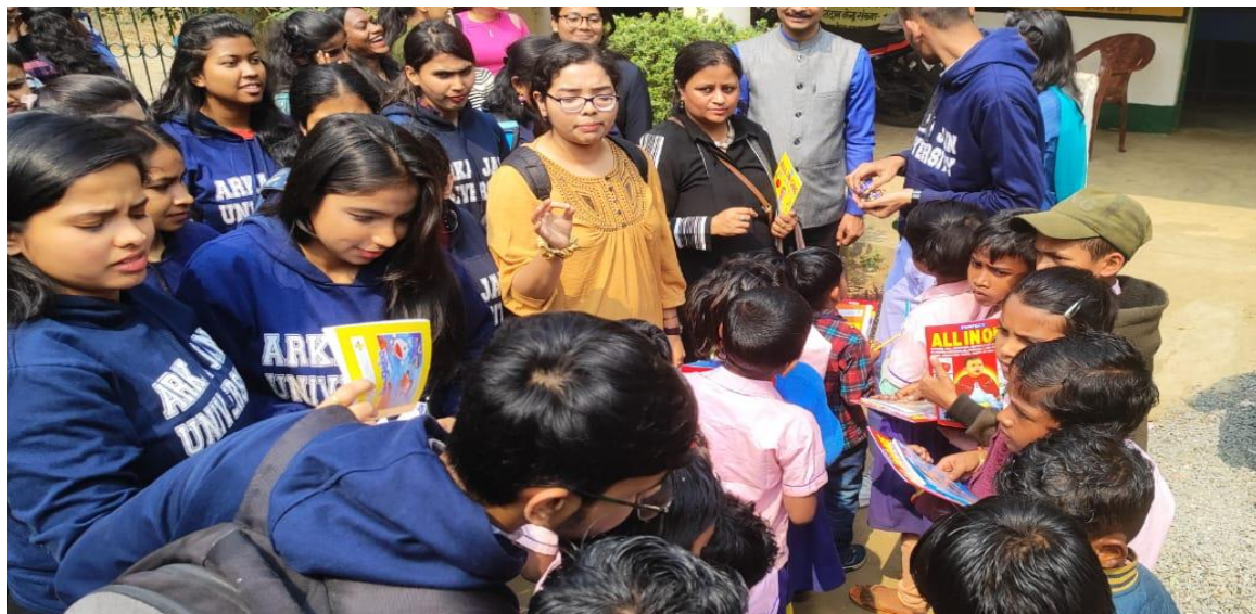
Figure 5: Distribution of All in One books among Pagda Middle School Students