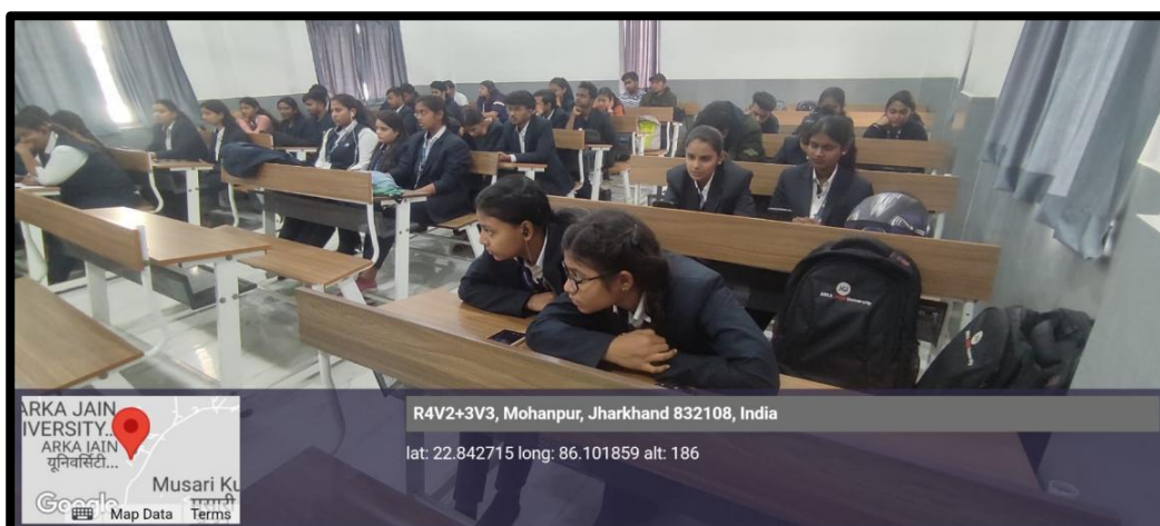
Figure 7: Students while attentively attending the online session by the Guest Speaker