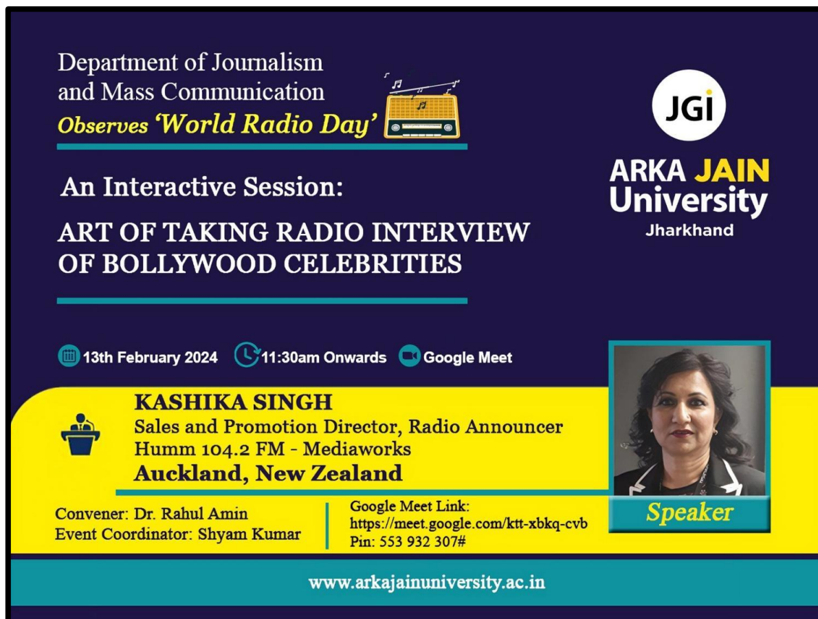
Figure 1 Poster of Art of Taking Radio Interview of Bollywood Celebrities