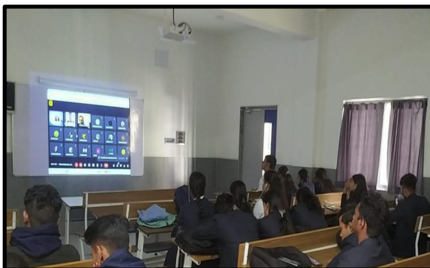
Figure 4: Students attending the online session of Guest speaker