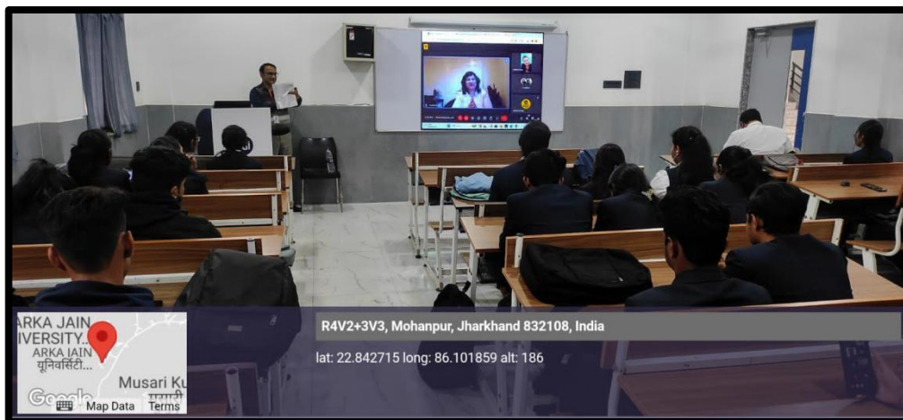
Figure 6: Students while getting awareness on radio production on World Radio day