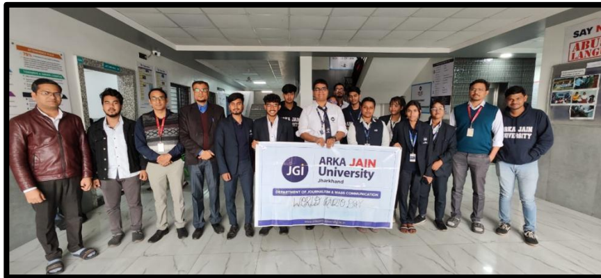
Figure 2: Students and faculty members while observing World Radio Day