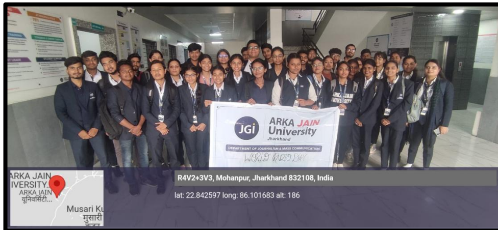
Figure 5: Students of Department of Journalism and Mass Communication while observing World Radio Day