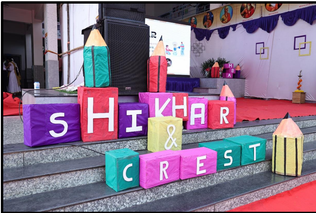
Figure 11: The Stage Decoration & Lighting at Shikhar 2024