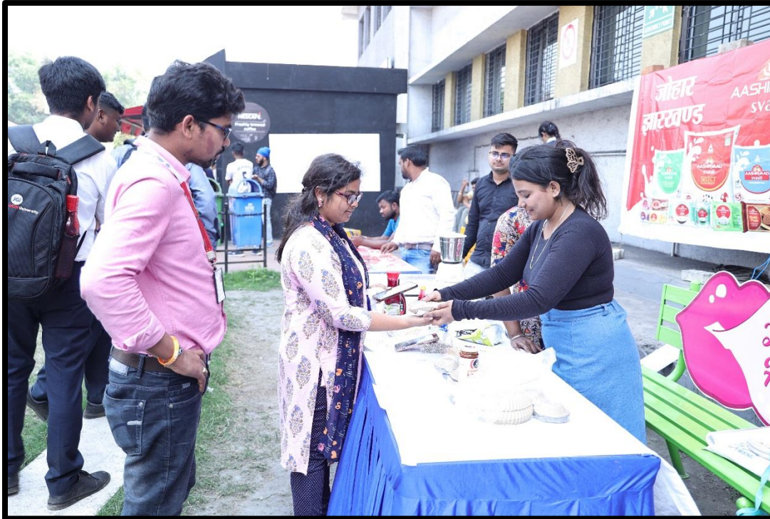
Figure 12: The Various Variety of Stalls Put Up at Shikhar 2024