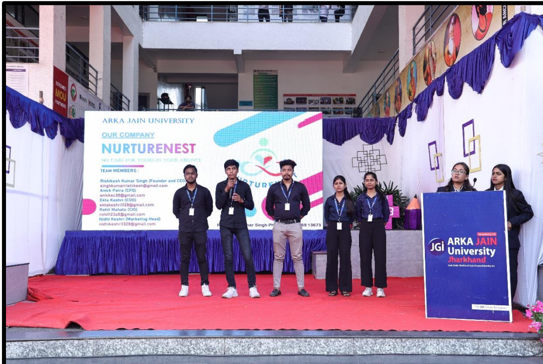
Figure 15: The Participants Enthusiastically pitching their ideas in front of the Guest Speakers at Shikhar 2024