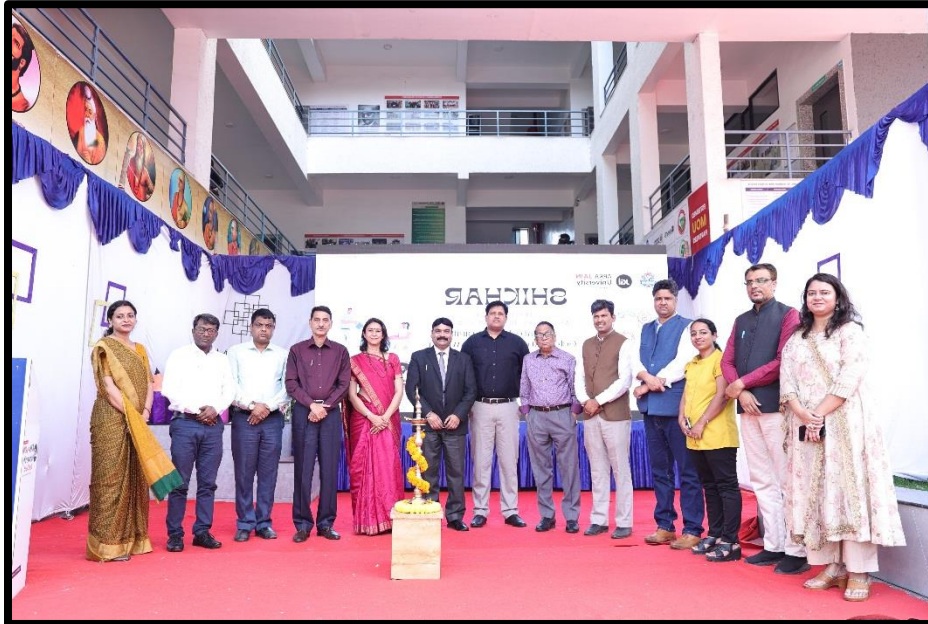
Figure 2: Group Photo at Shikhar 2024