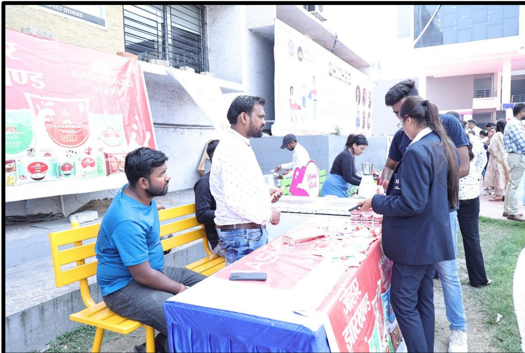
Figure 13: The Various Variety of Stalls Put Up at Shikhar 2024