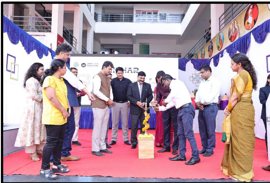
Figure 3: The lamp lighting ceremony by the respective speakers