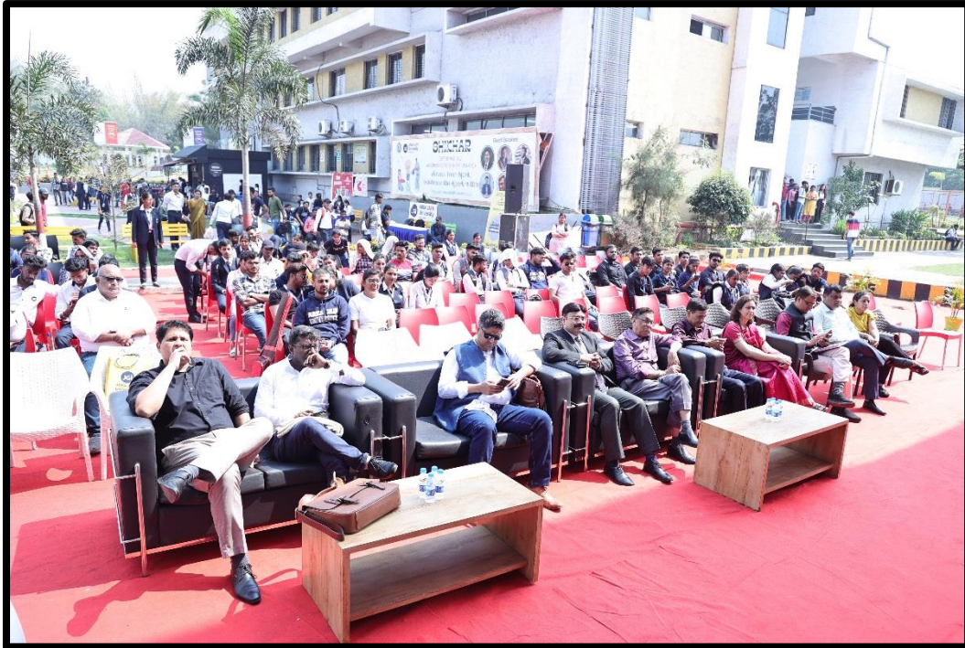
Figure 4: The Guest Speaker, faculty members & students at Shikhar 2024