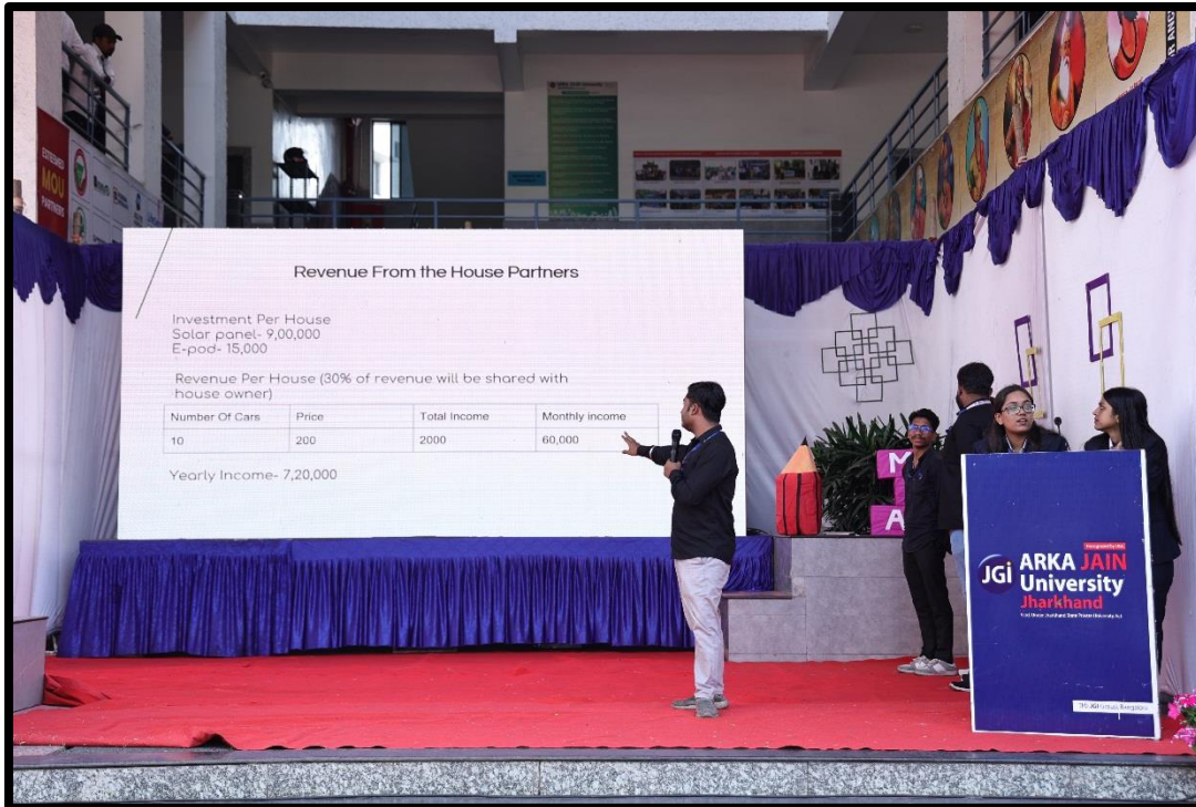
Figure 14: The Participants present their Idea at Shikhar 2024