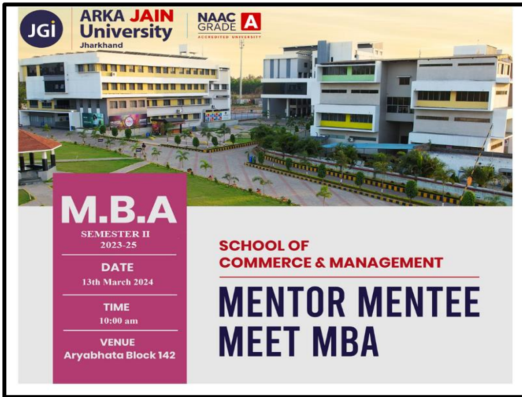
Figure 1: Poster of Mentor- Mentee for MBA Semester-II (2023-2025)