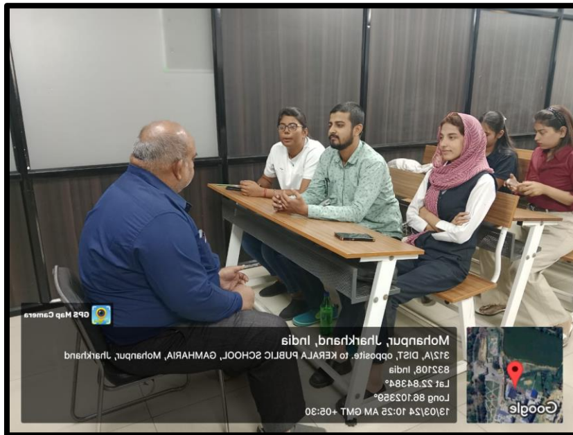
Figure 3: Students interacting with their mentors and clarifying doubts