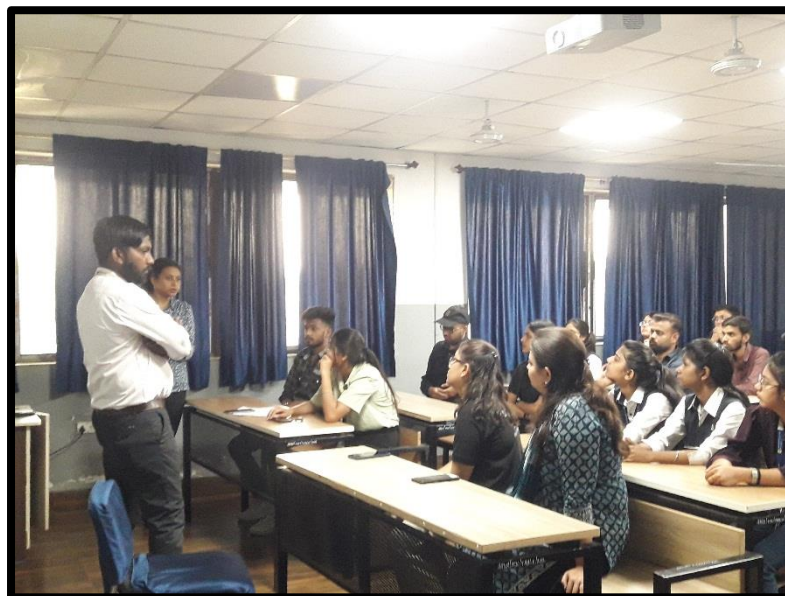
Figure 8: Students Meet with hei respective faculty mentors and discussed various issues