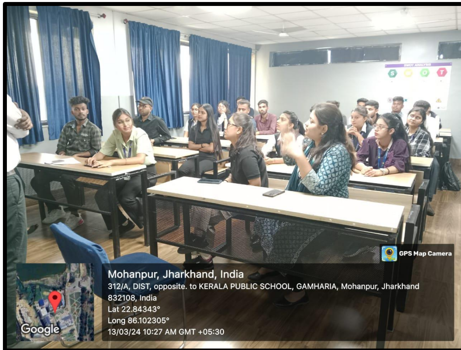
Figure 5: Students Meet with hei respective faculty mentors and discussed various issues