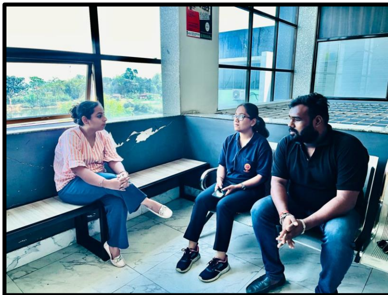
Figure 10: Students Meet with hei respective faculty mentors and discussed various issues