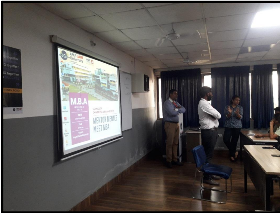
Figure 7: Poster for te Mentor-Mentee Meetings