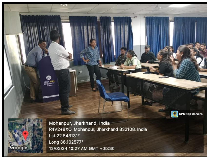
Figure 4: Students Meet with hei respective faculty mentors and discussed various issues