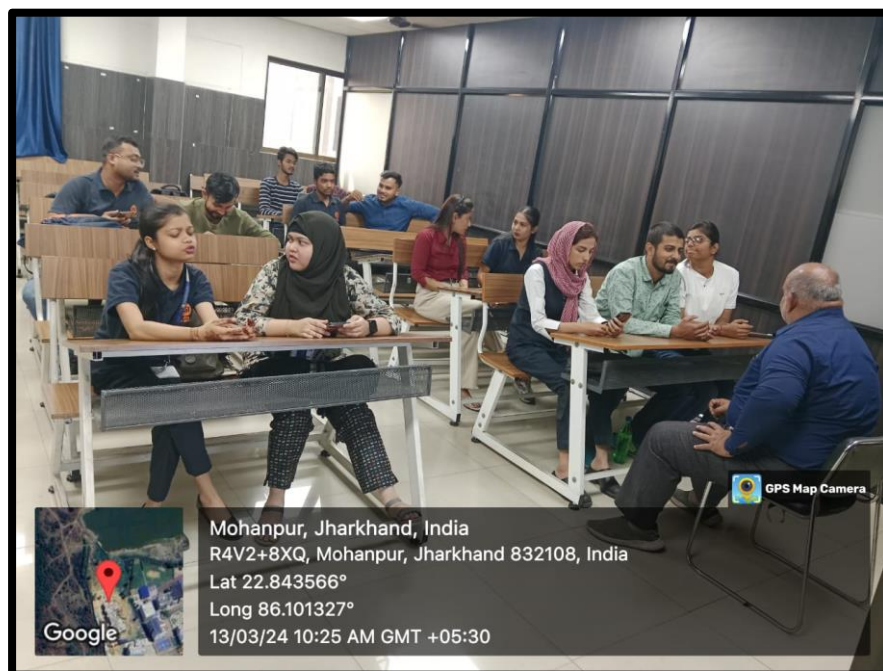
Figure 6: Students Meet with hei respective faculty mentors and discussed various issues