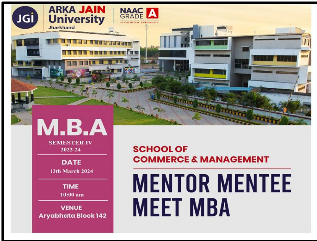
Figure 2: Poster of Mentor- Mentee for MBA Semester-IV (2022-2024)