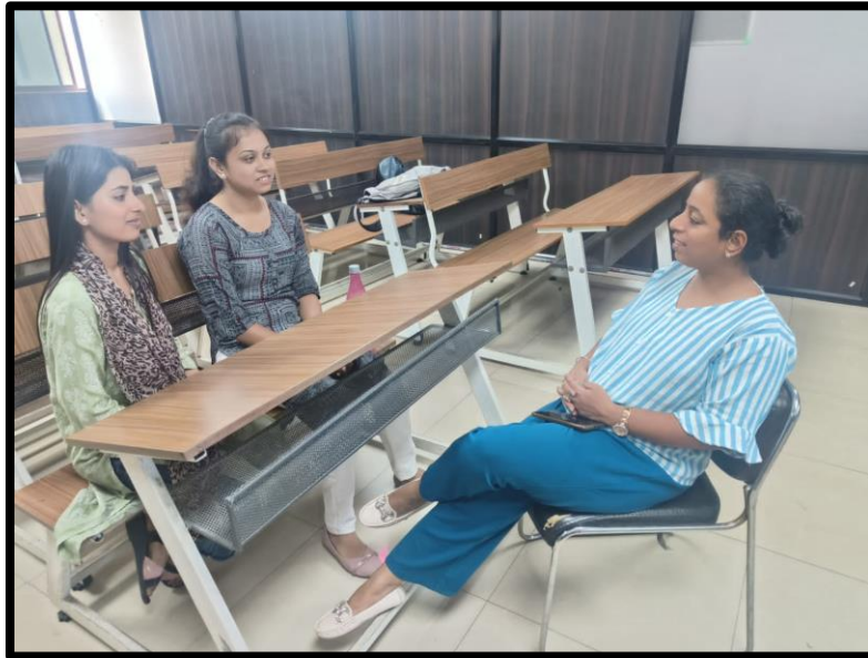
Figure 9: Students Meet with hei respective faculty mentors and discussed various issues