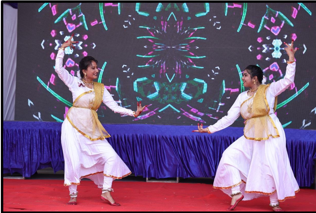
Figure 8: The Students of MBA performing Ganesh Vandana at Shikhar 2024