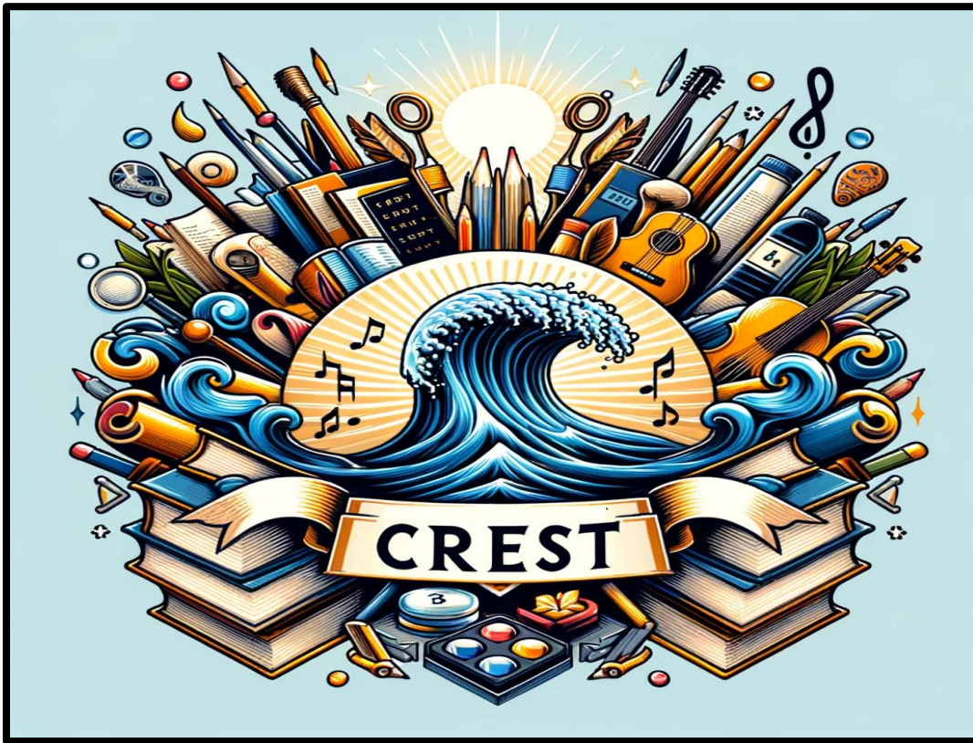
Figure 1: Poster of Crest- The Annual Management Fest 2024