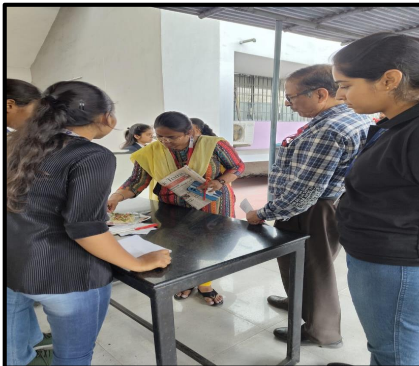
Figure 7: The Judges during the contest of various events