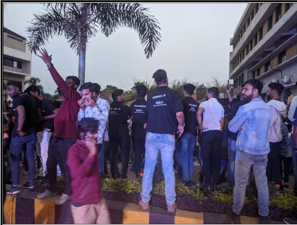
Figure 2: The student and audience atr the Crest Live Concert