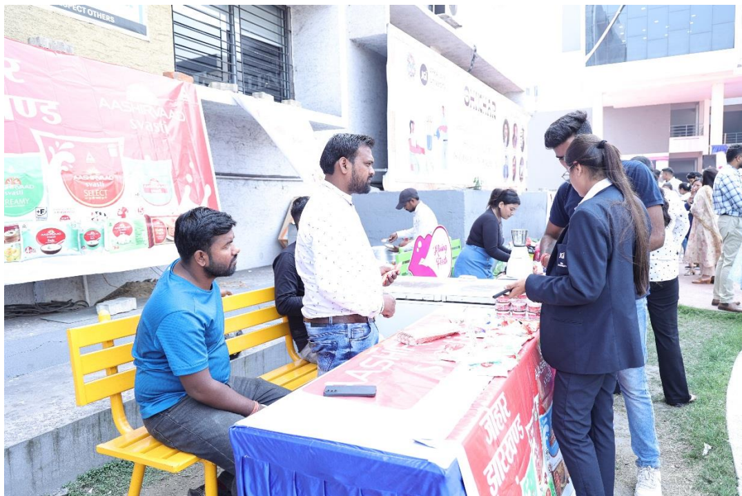
Figure 11: The Various Variety of Stalls Put Up at Crest 2024