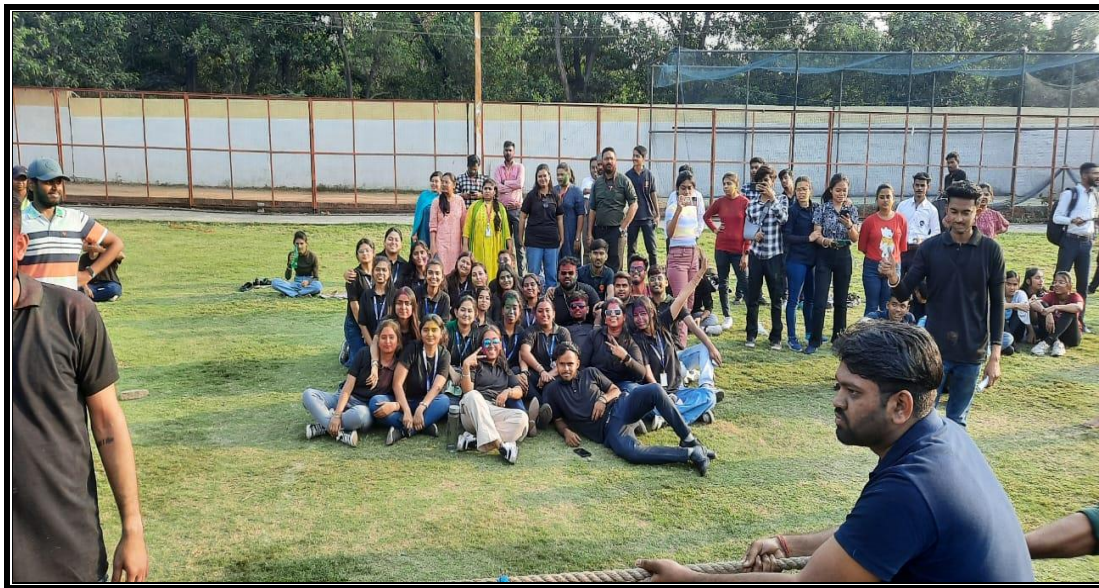
Figure 5: The Students of MBA & Participants at Tug of War Contest