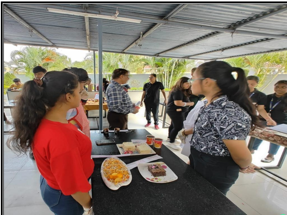
Figure 3: The participants of Cook without Fire during Crest 2024