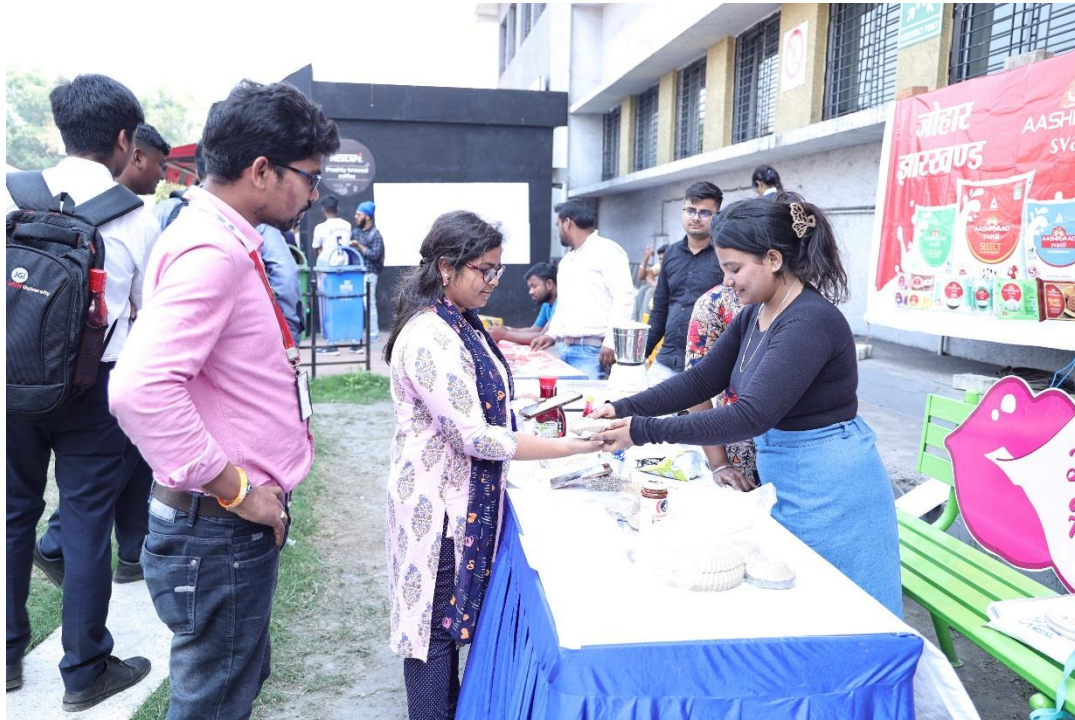
Figure 10: The Various Variety of Stalls Put Up at Crest 2024