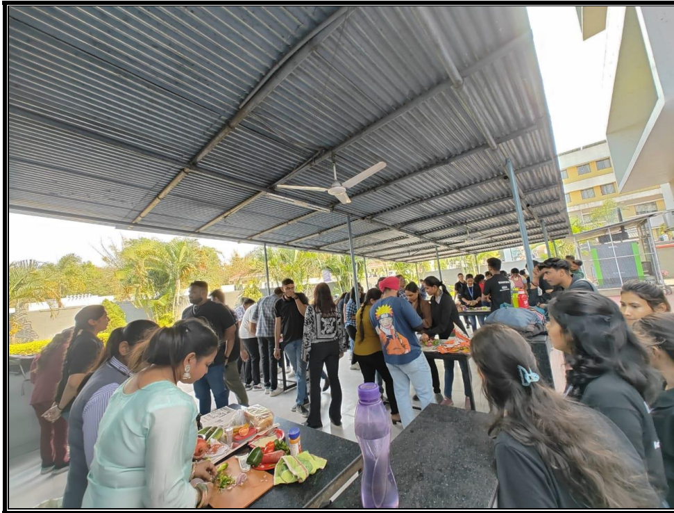
Figure 4: The participants of Cook without Fire during Crest 2024