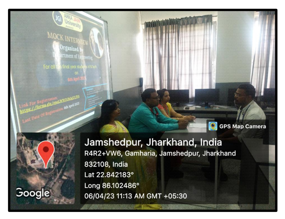
Figure 2: Geo Tag Photo of the Event