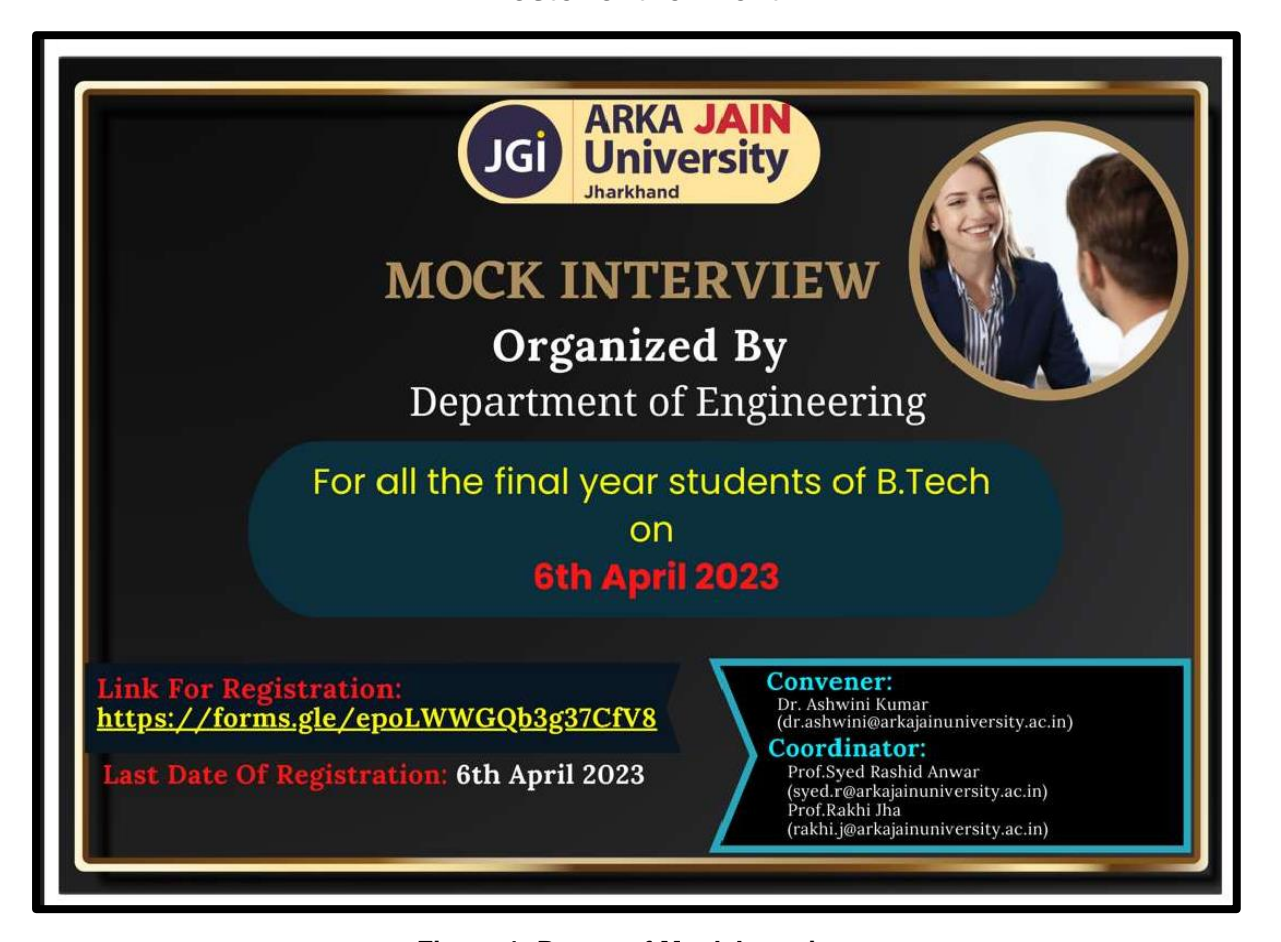
Figure 1: Poster of Mock Interview