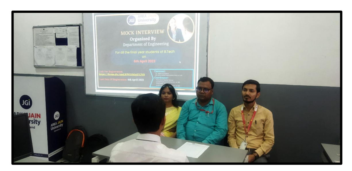
Figure 4: Photo during Mock Interview