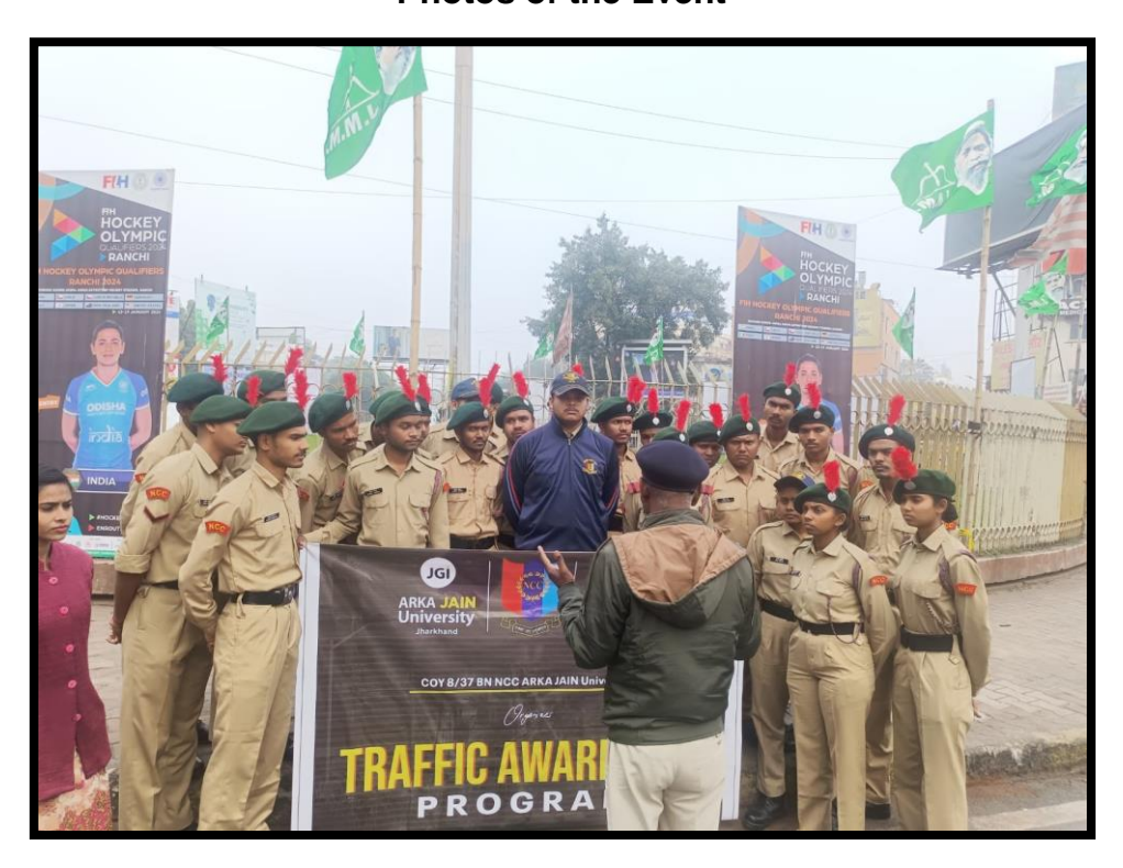
Figure 2: Briefing about the Traffic Awareness program