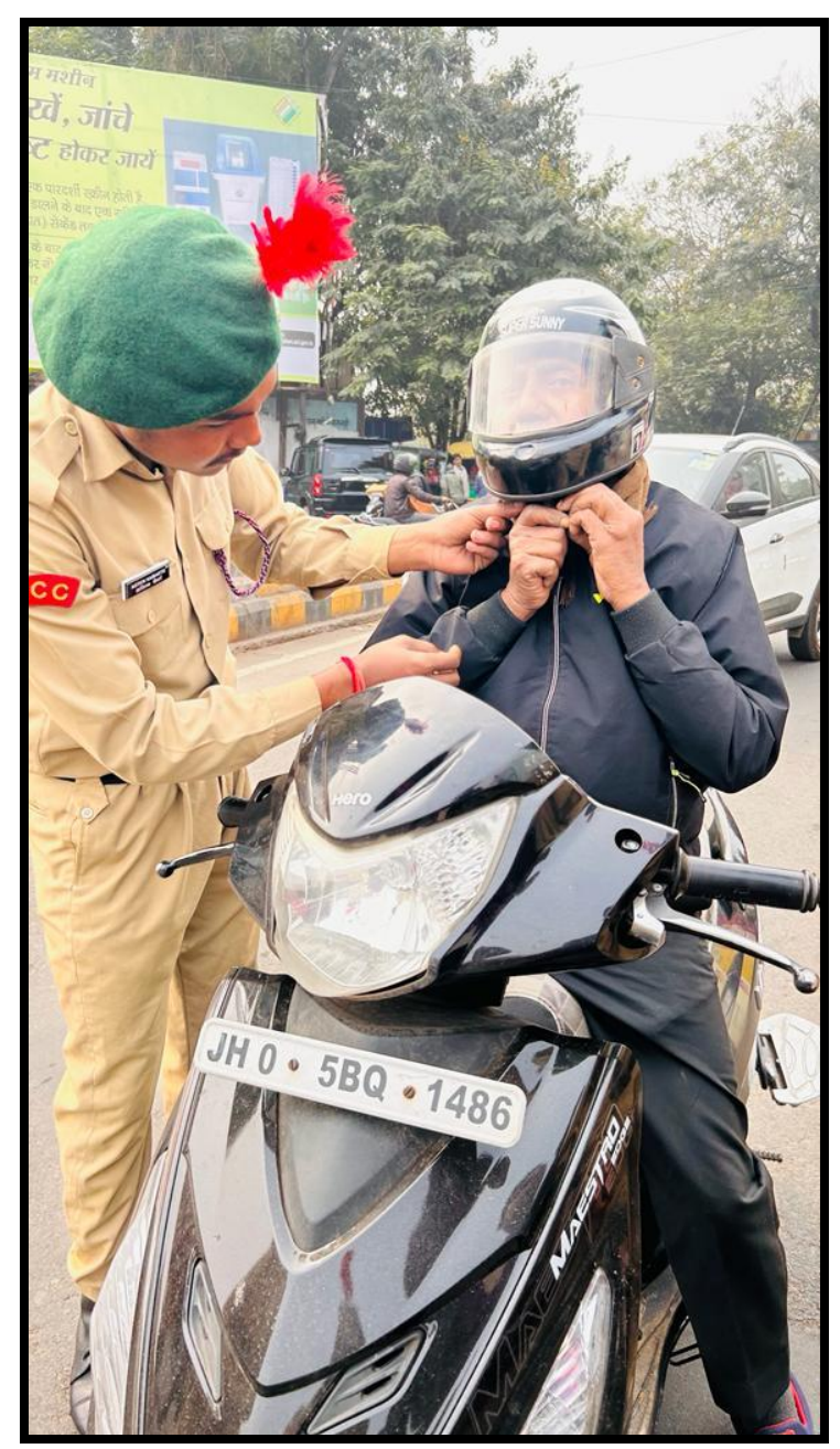
Figure 4: Traffic Awareness program going on