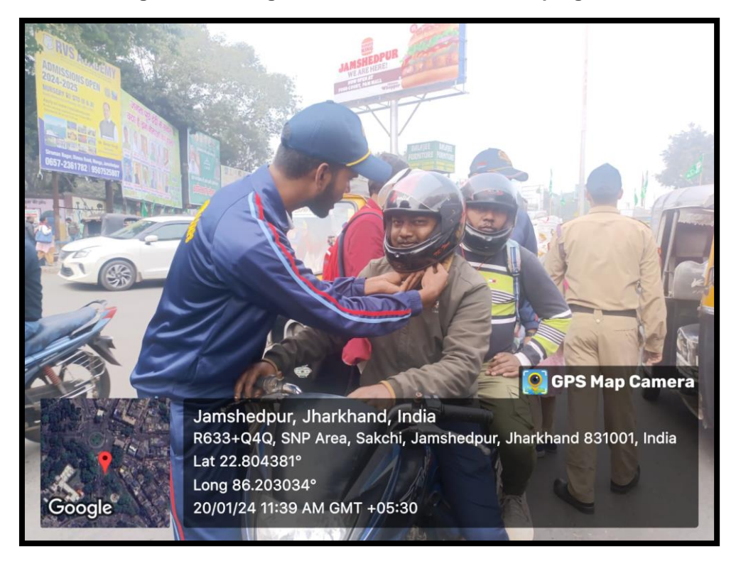
Figure 3: Geo Tag Photo