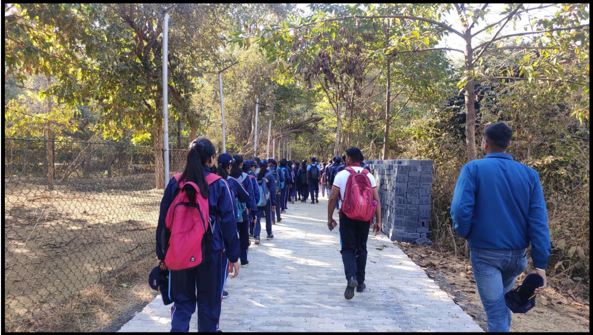
Figure 4: Cadets are going at dalam top hill