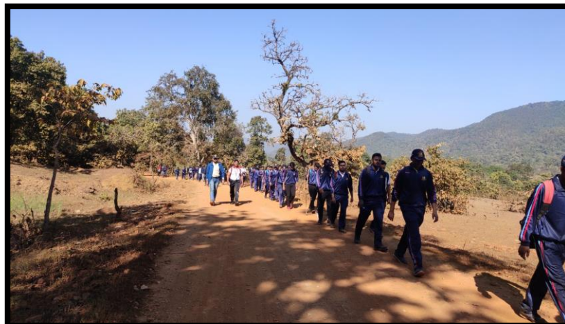
Figure 3: Cadets are going Dalma