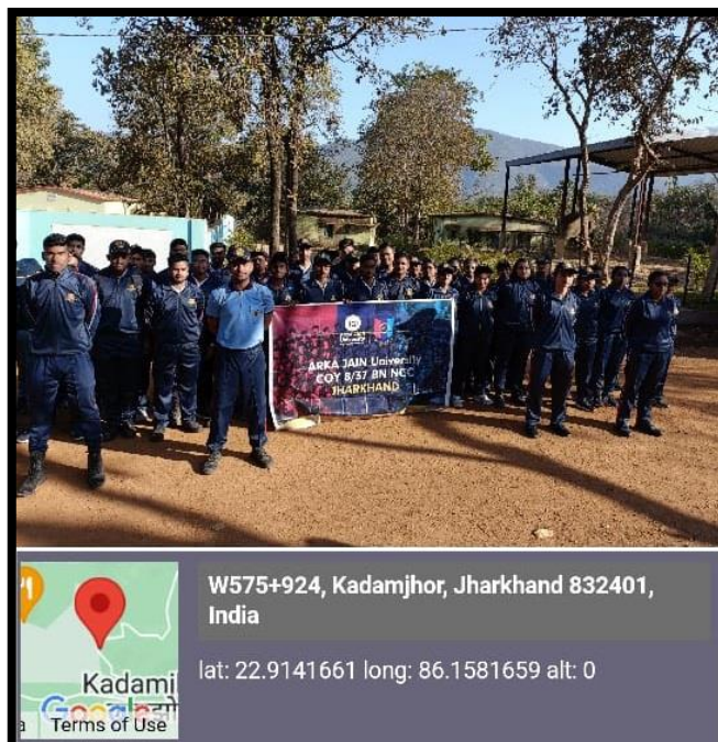
Figure 2: Briefing about the trekking way