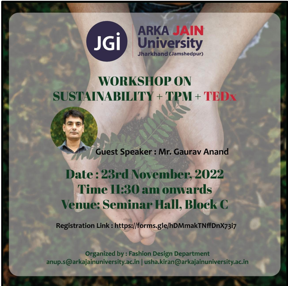
Figure 1: Poster of the Sustainability, TPM & TEDx