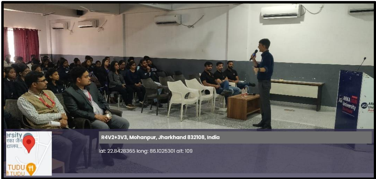
Figure 2: Audience assembled for the session