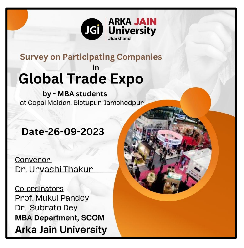
Figure 1: Poster of Survey on Participating Companies in Global Trade Expo