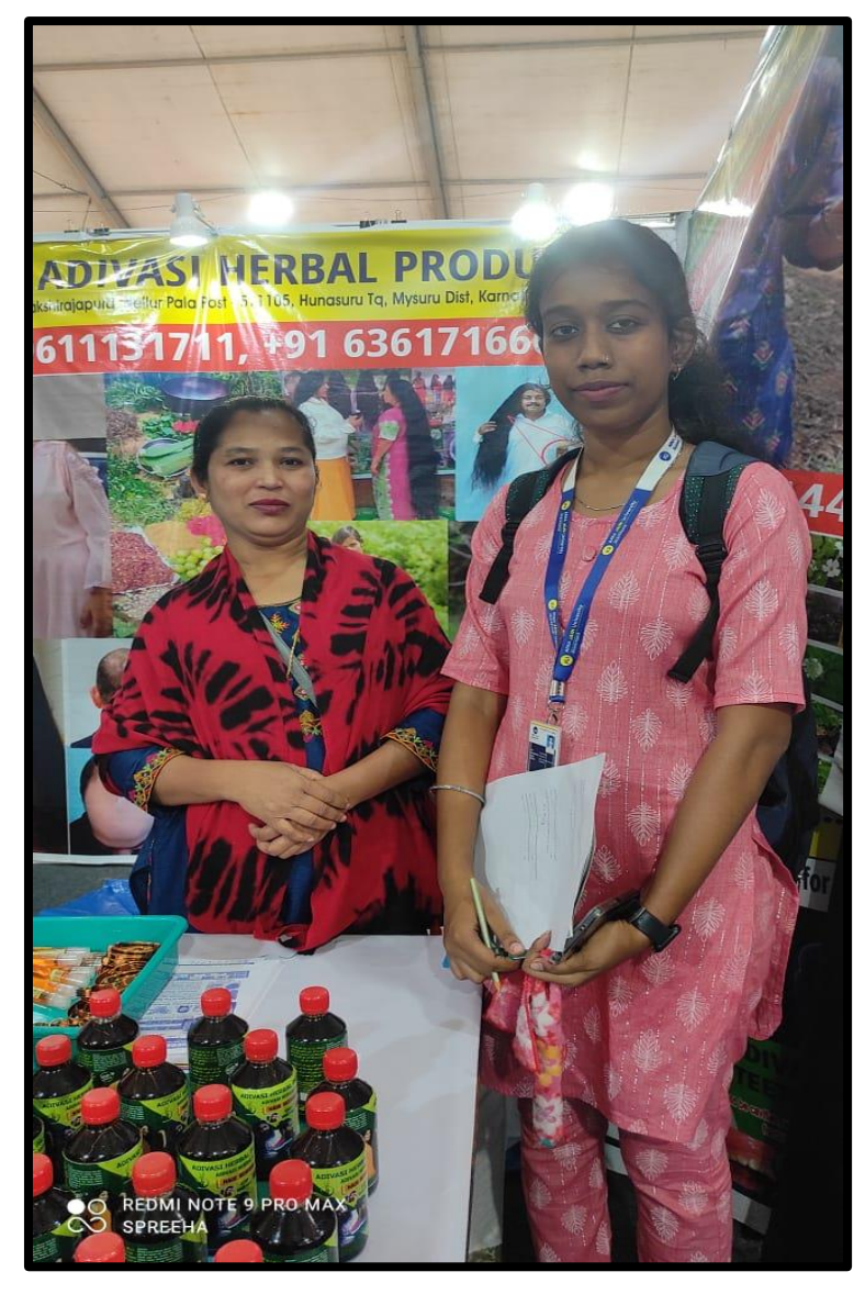
Figure 6: Student visiting the stall of Herbal Product