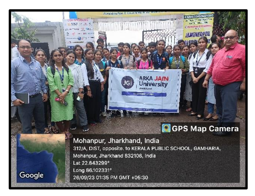
Figure 2: Geo Tag Photo of the Event