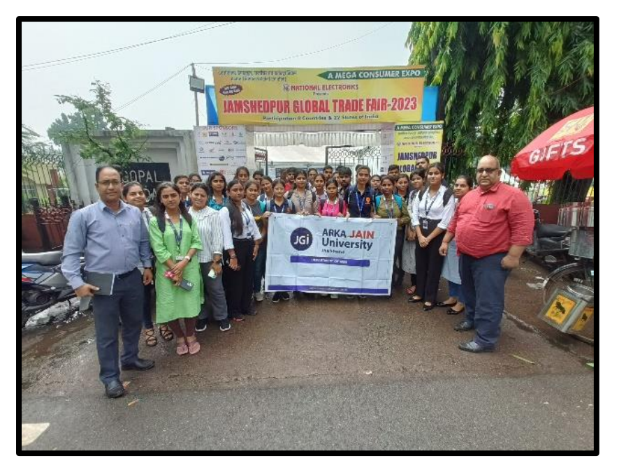
Figure 3: Group Photo