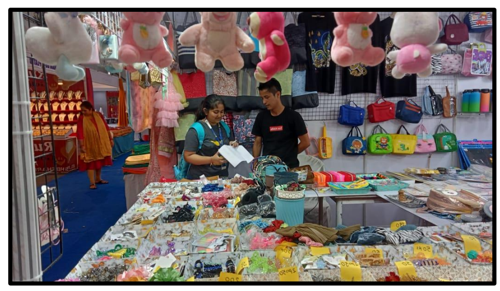
Figure 4: Student Visiting the Stall