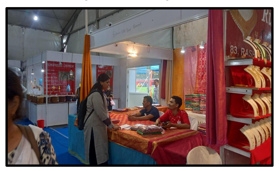
Figure 5: Student Visit the Stall of Jewellery items