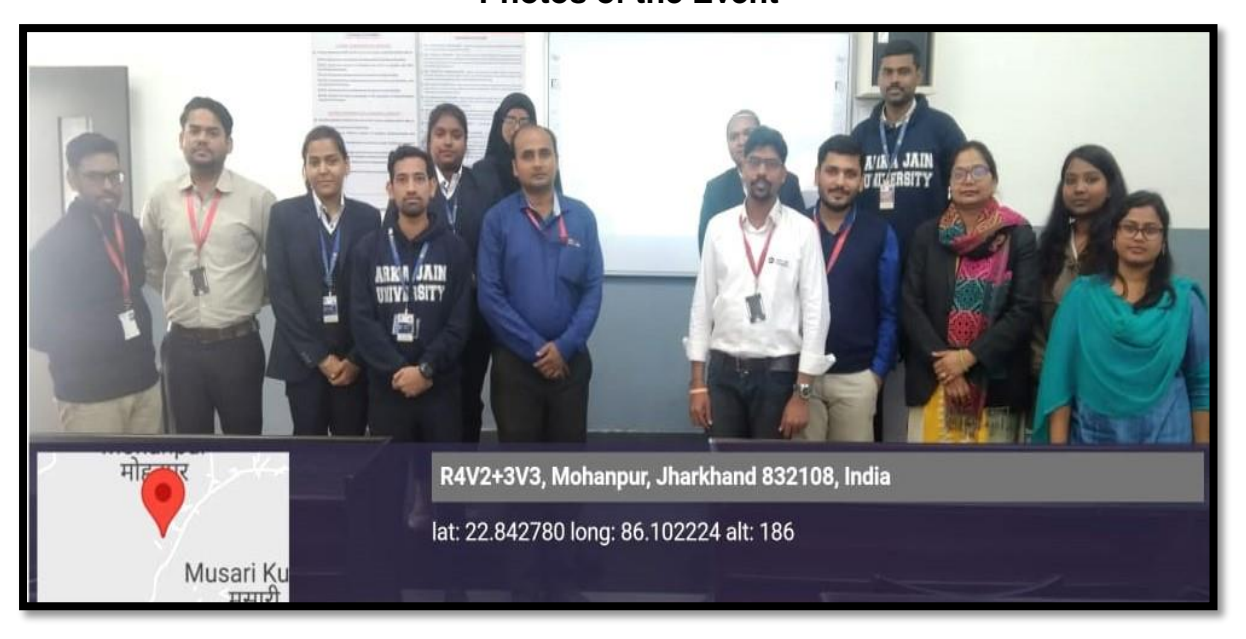
Figure 2: Enthusiastic Participants along with faculty members ready for the speech