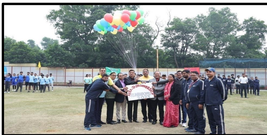
Figure 14: Declaring the Annual Sports Meet- RUNBHOOMI 2023 – Open with the release of the balloons