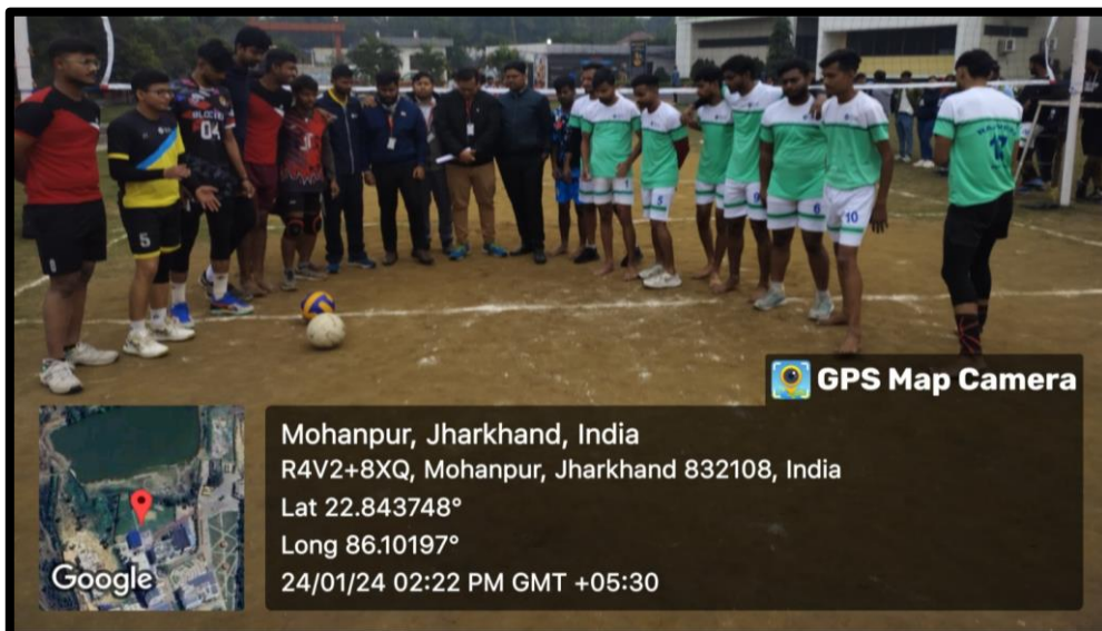
Figure 27: Volleyball Team with their Coordinators