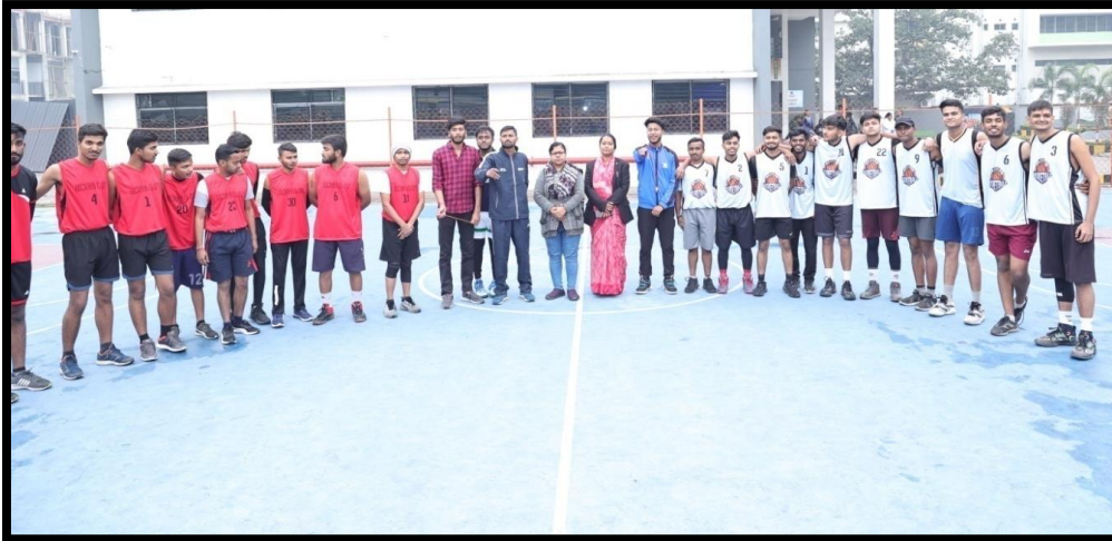
Figure 16: Basketball teams with coordinators