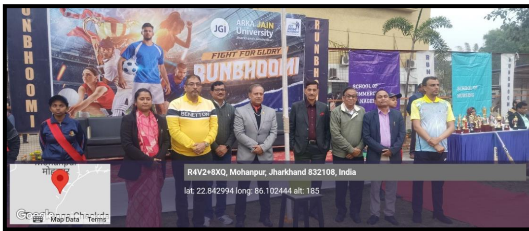
Figure 5: The Honorable Guests, University Management Heads and Sports Chairperson