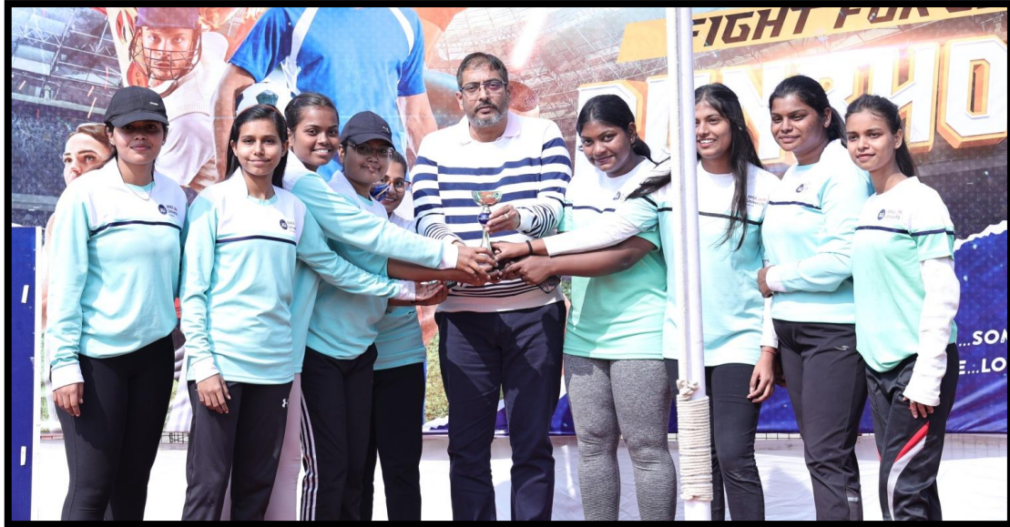
Figure 33: Prize Distribution in progress