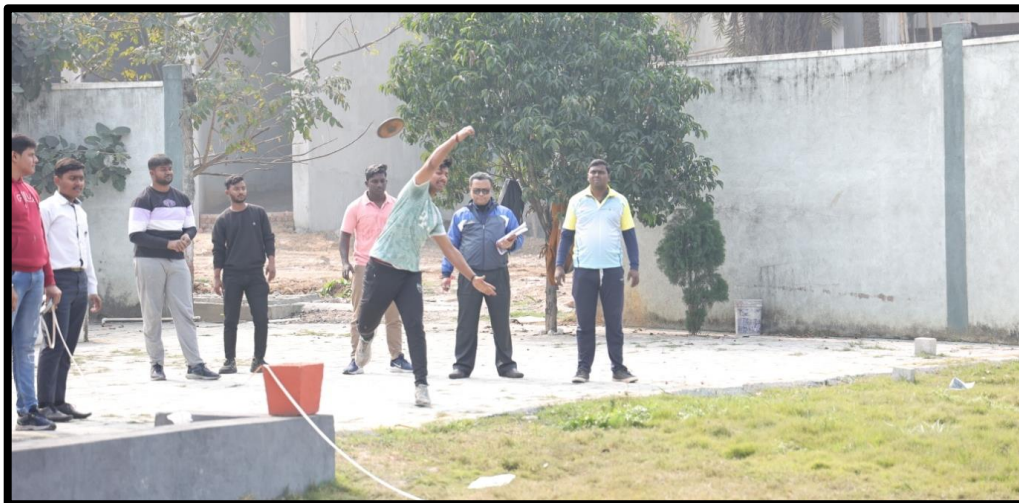
Figure 26: Discus throw in progress