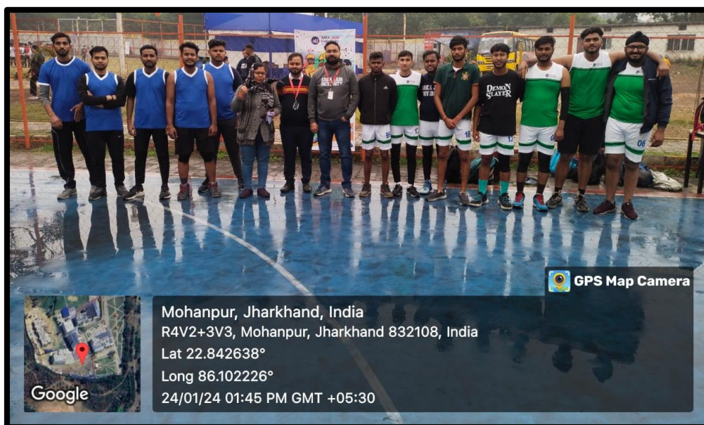
Figure 21: Geo tag Photo