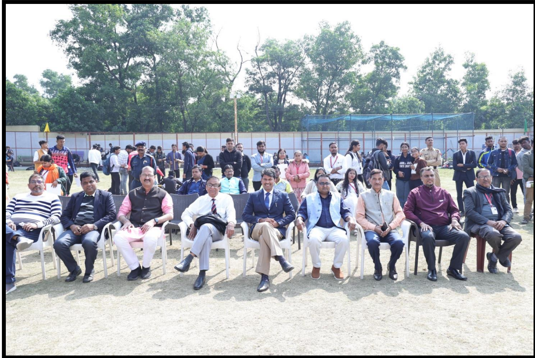
Figure 36: All Dignitaries in ground