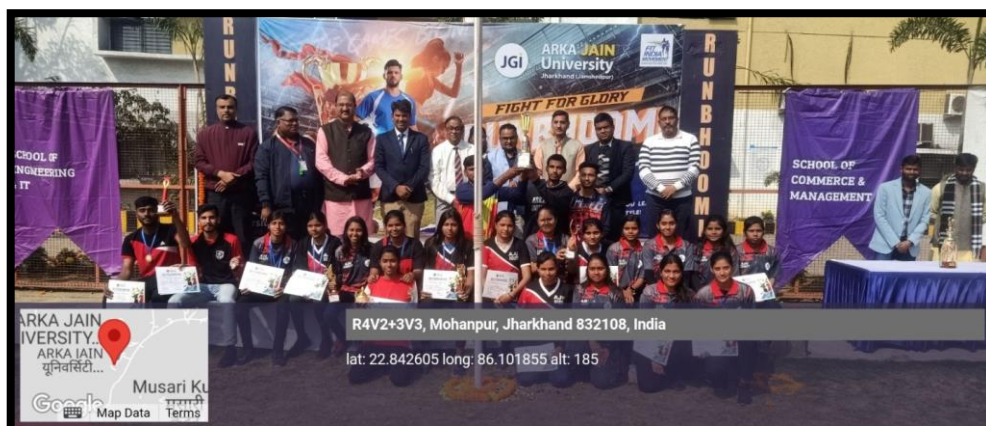
Figure 30: The overall Championship- School of Engineering and IT