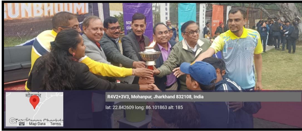
Figure 4: The Lighting of the Torch