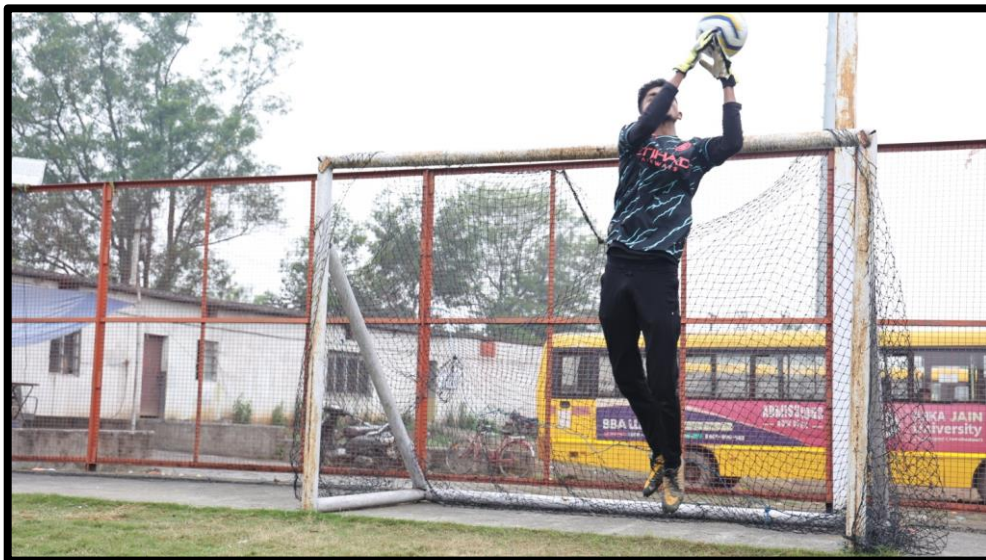
Figure 17: Handball Match in Progress