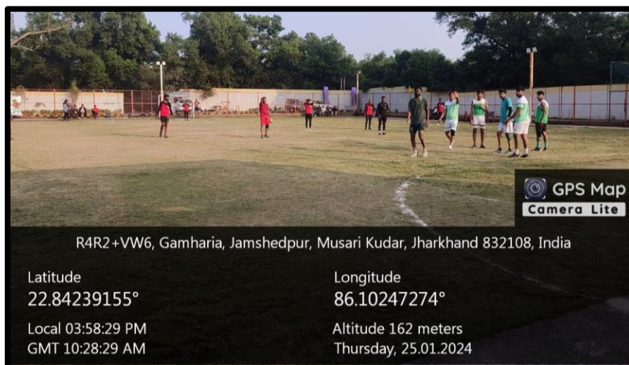
Figure 24: Players in the field during Handball match