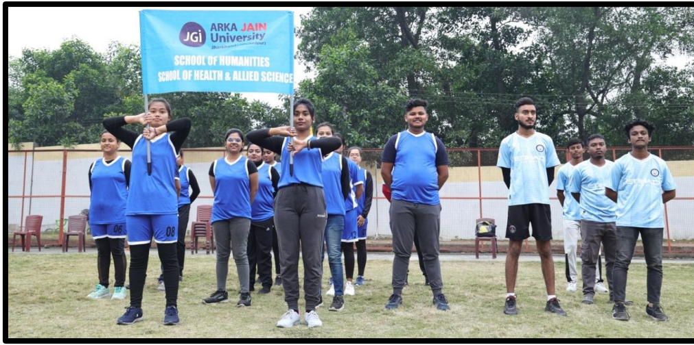
Figure 10: School of Humanities team at sports meet