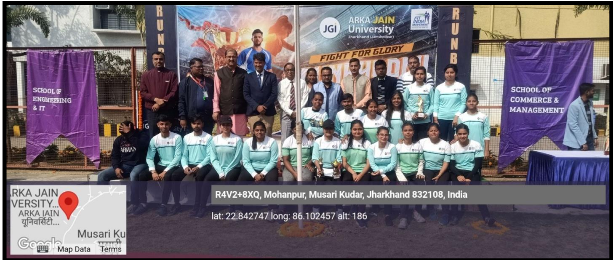
Figure 31: The overall Runners Championship- School of Commerce and Management