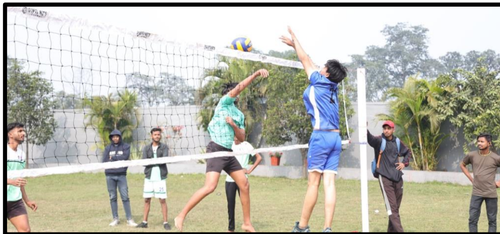
Figure 28: Volleyball match in progress