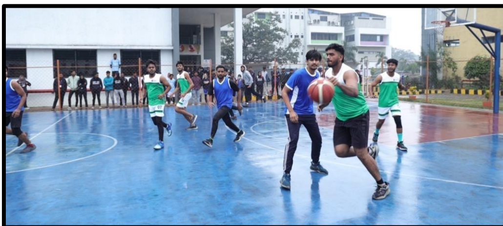
Figure 20: Basketball Players during the game