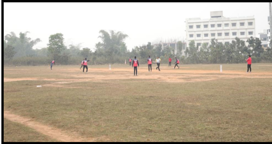
Figure 22: Cricket Match in Progress