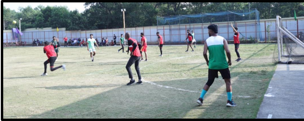
Figure 25: Players in the field during Handball match