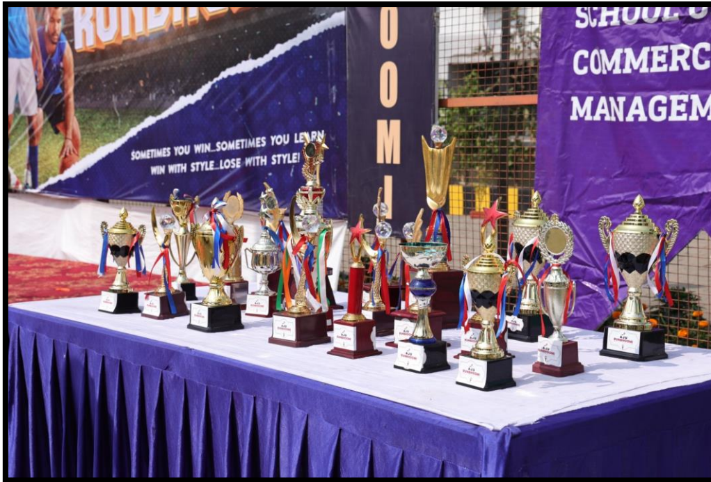
Figure 35: Prize Distribution in progress