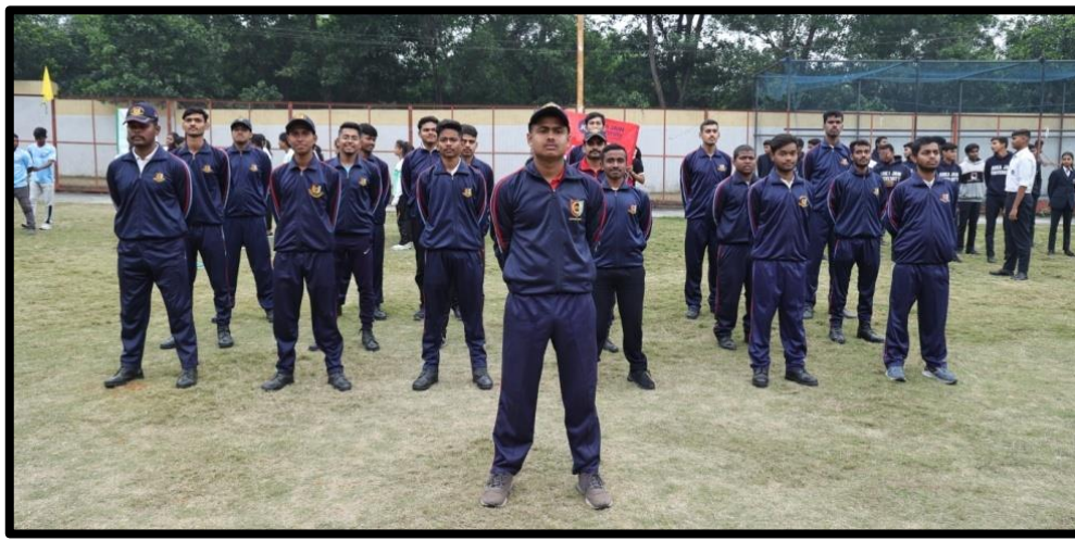
Figure 11: The NCC Cadets at sports meet