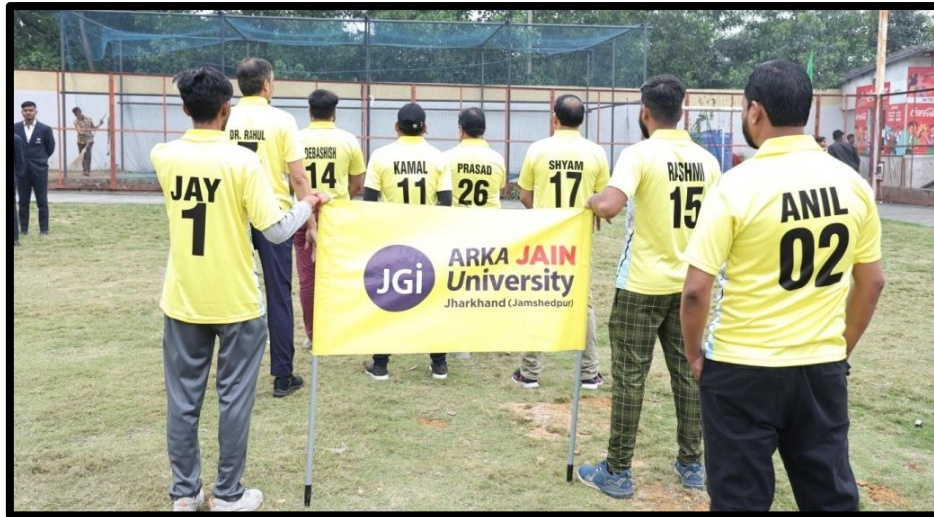
Figure 7: The Faculty Teams at sports meet