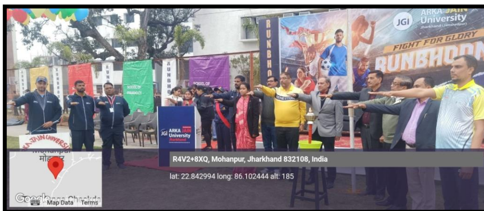
Figure 12: The Sportsman's Oath