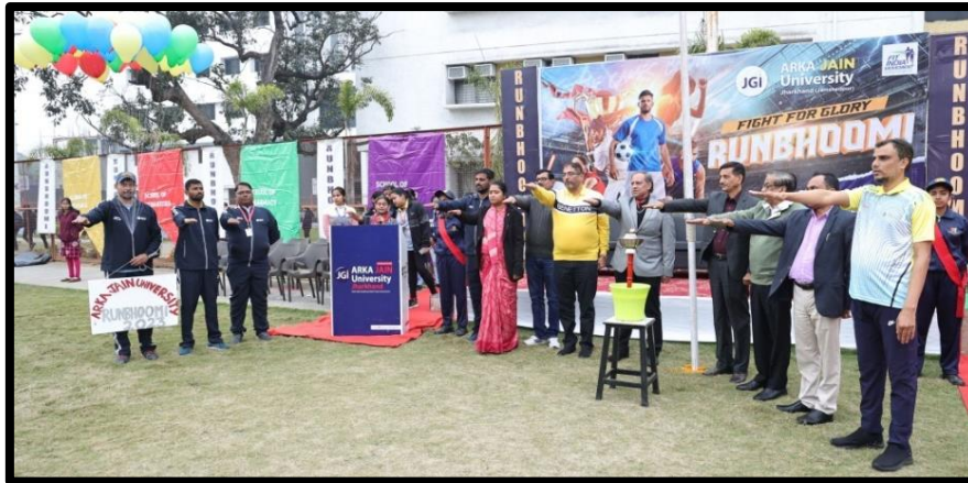
Figure 13: The Sportsman's Oath