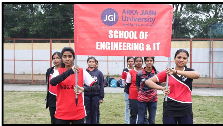
Figure 8: The School of Engineering & IT team at sports meet