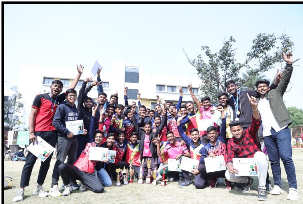
Figure 36: Overall champion's team