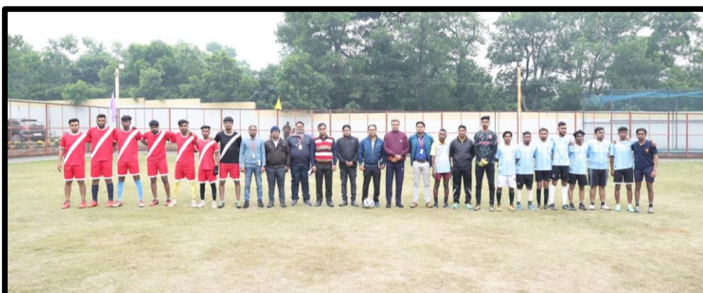
Figure 18: Football teams with coordinators