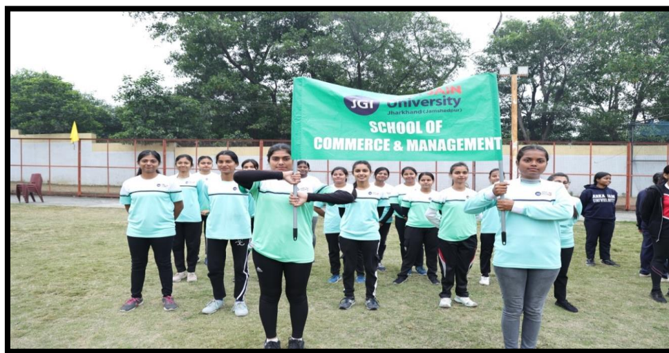
Figure 9: The School of Commerce & Management team at sports meet