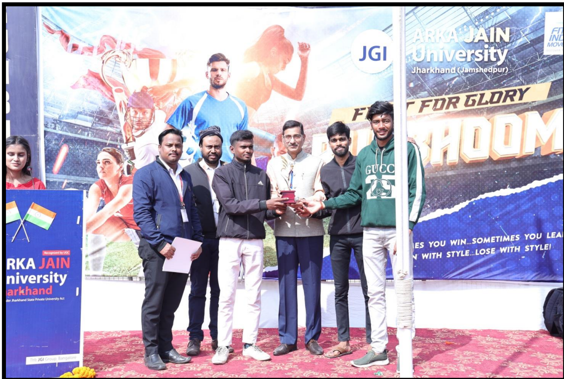
Figure 34: Prize Distribution in progress