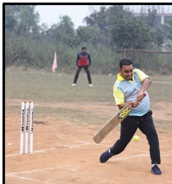
Figure 15: Cricket Match in progress