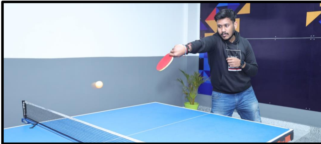
Figure 19: Table Tennis Match in progress