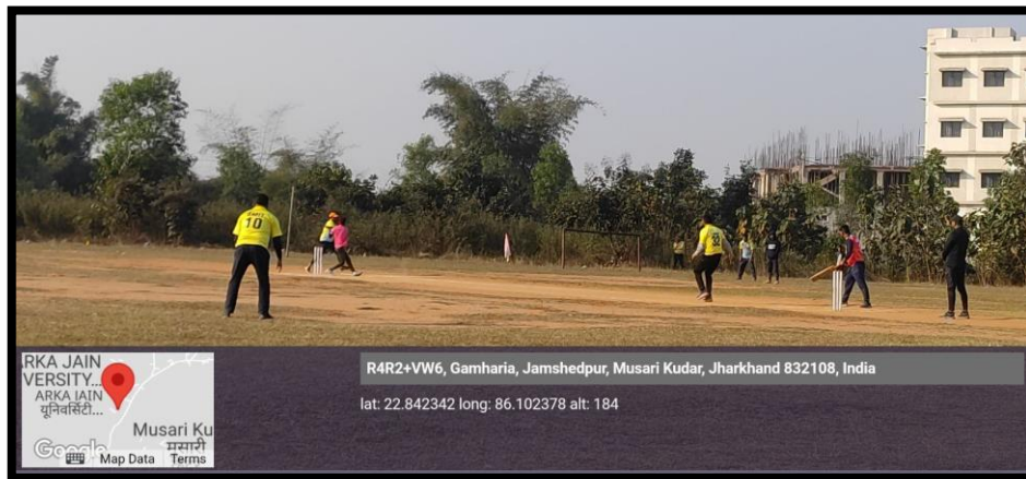
Figure 23: Knock out Match in progress during Runbhoomi 2023