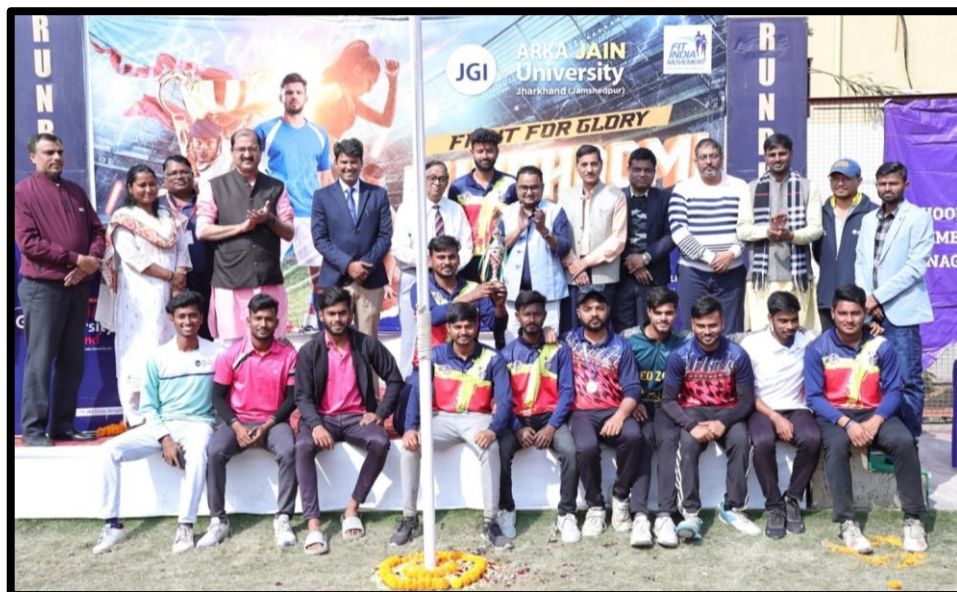
Figure 29: The overall Championship- School of Engineering and IT