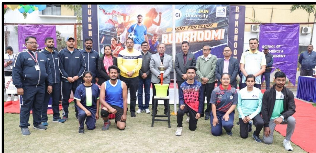
Figure 6: The Torch Bearers