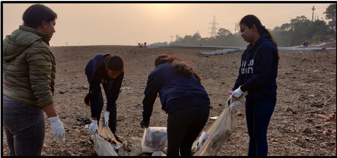
Figure 2: Students of Arka Jain University cleaning the river bank