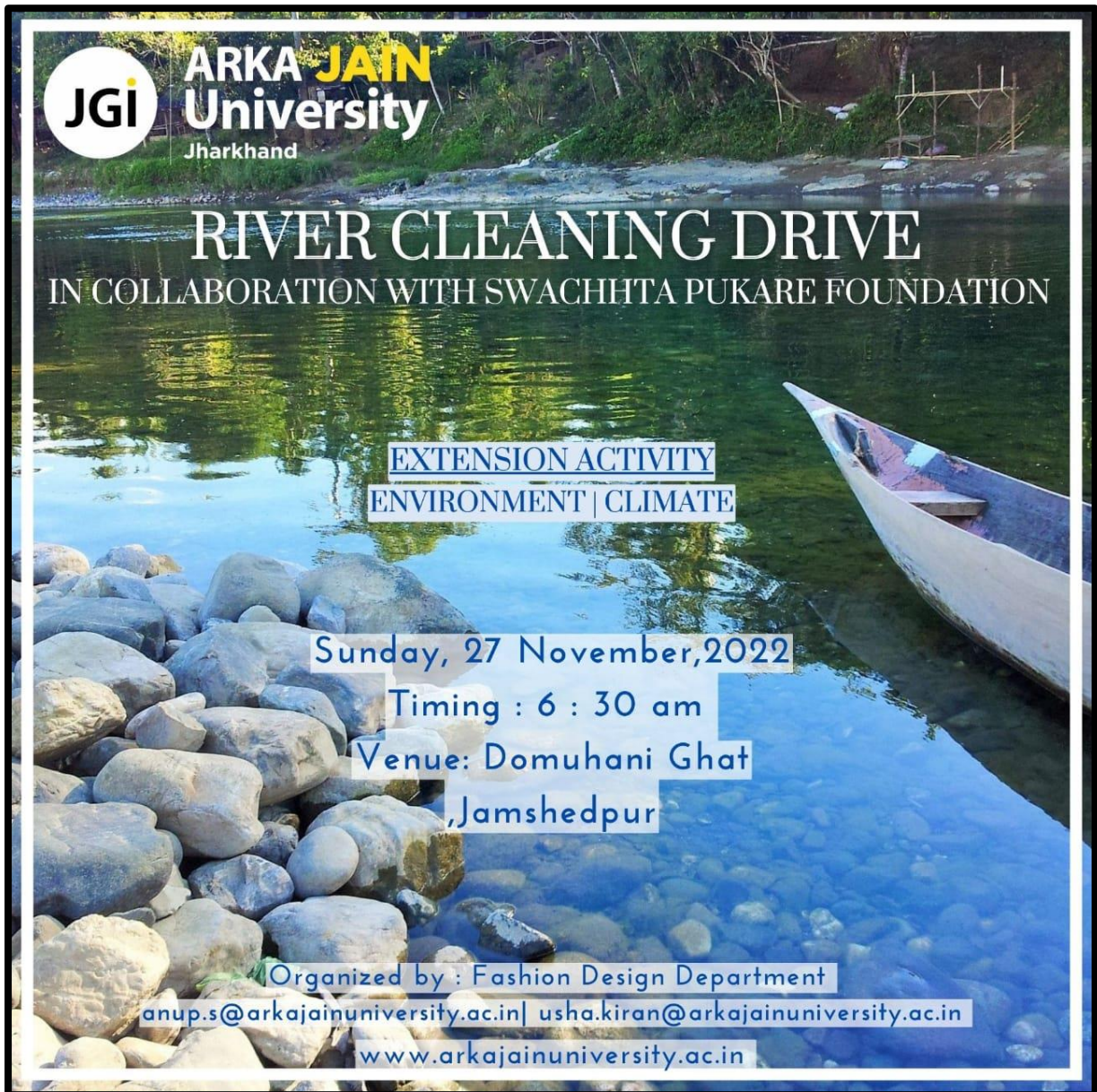
Figure 1: Poster of the River Cleaning Drive