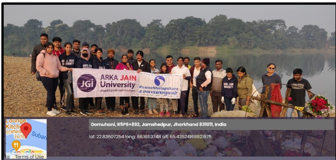
Figure 3: Group Photo during River Cleaning Drive