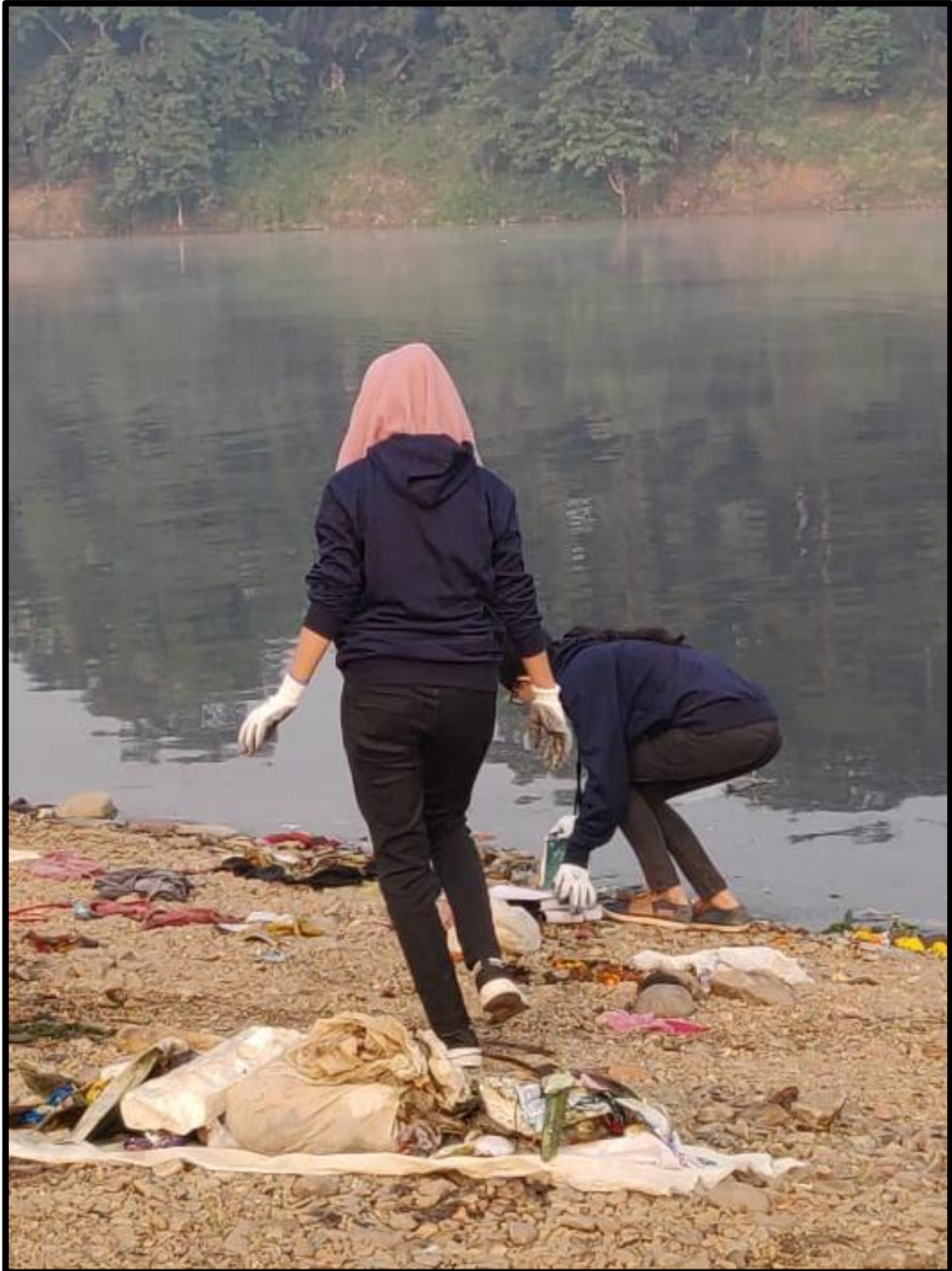
Figure 4: Students Collecting Garbage from the River Bank