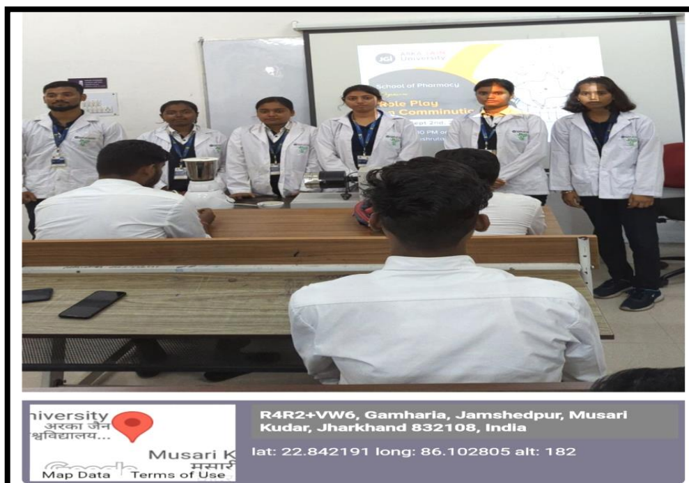
Figure 3: The participants of Role play session