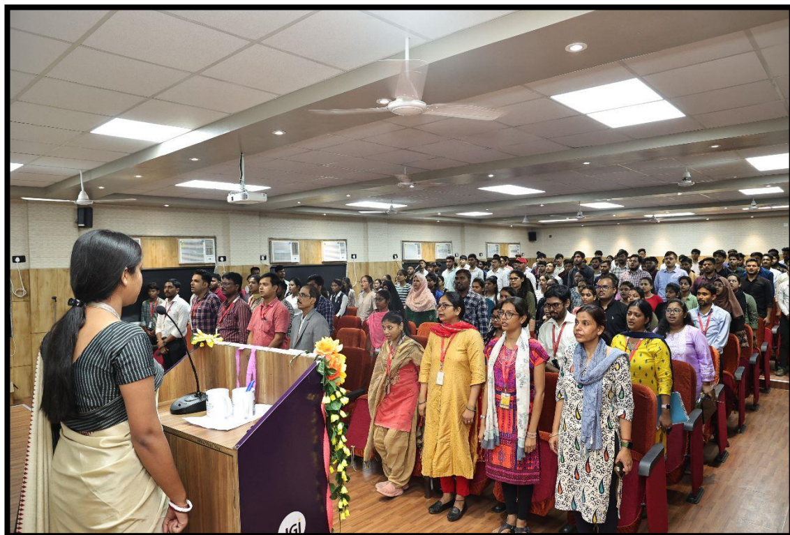
Figure 17: Distinguished guests, faculty, and students standing united, displaying pride as they join in singing our National Anthem.