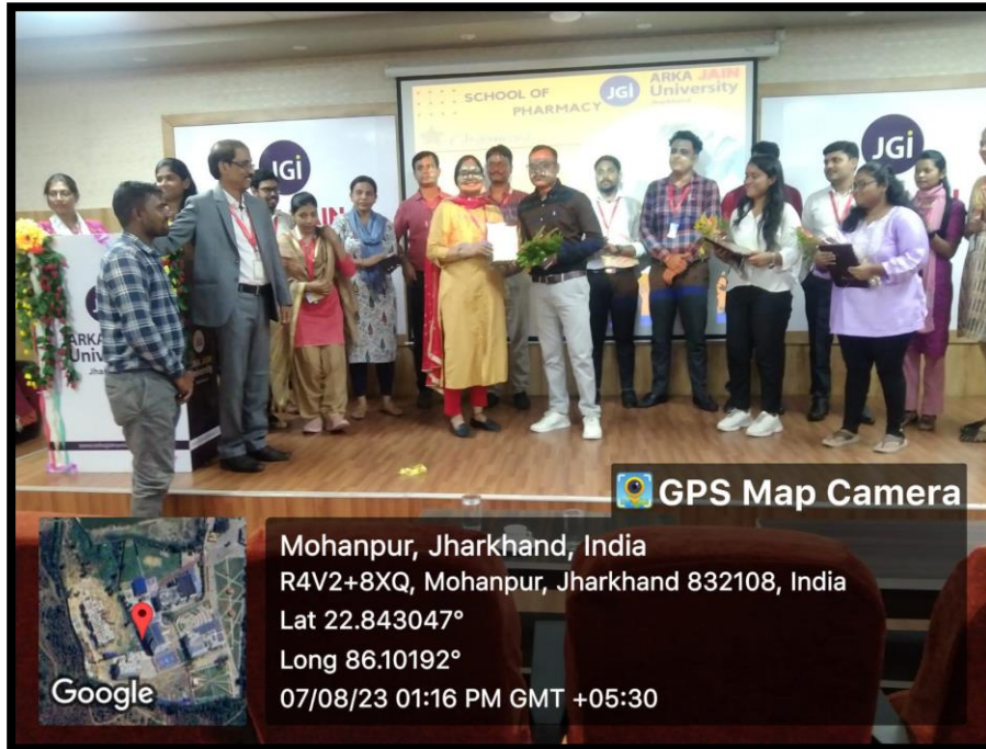
Figure 2: B.PHARM student being presented with token of appreciation.