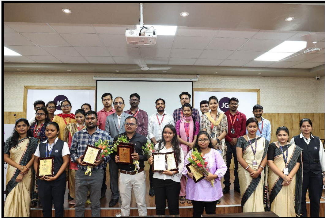
Figure 16: Faculties with “GPAT and NIPER 2023 ”qualifier