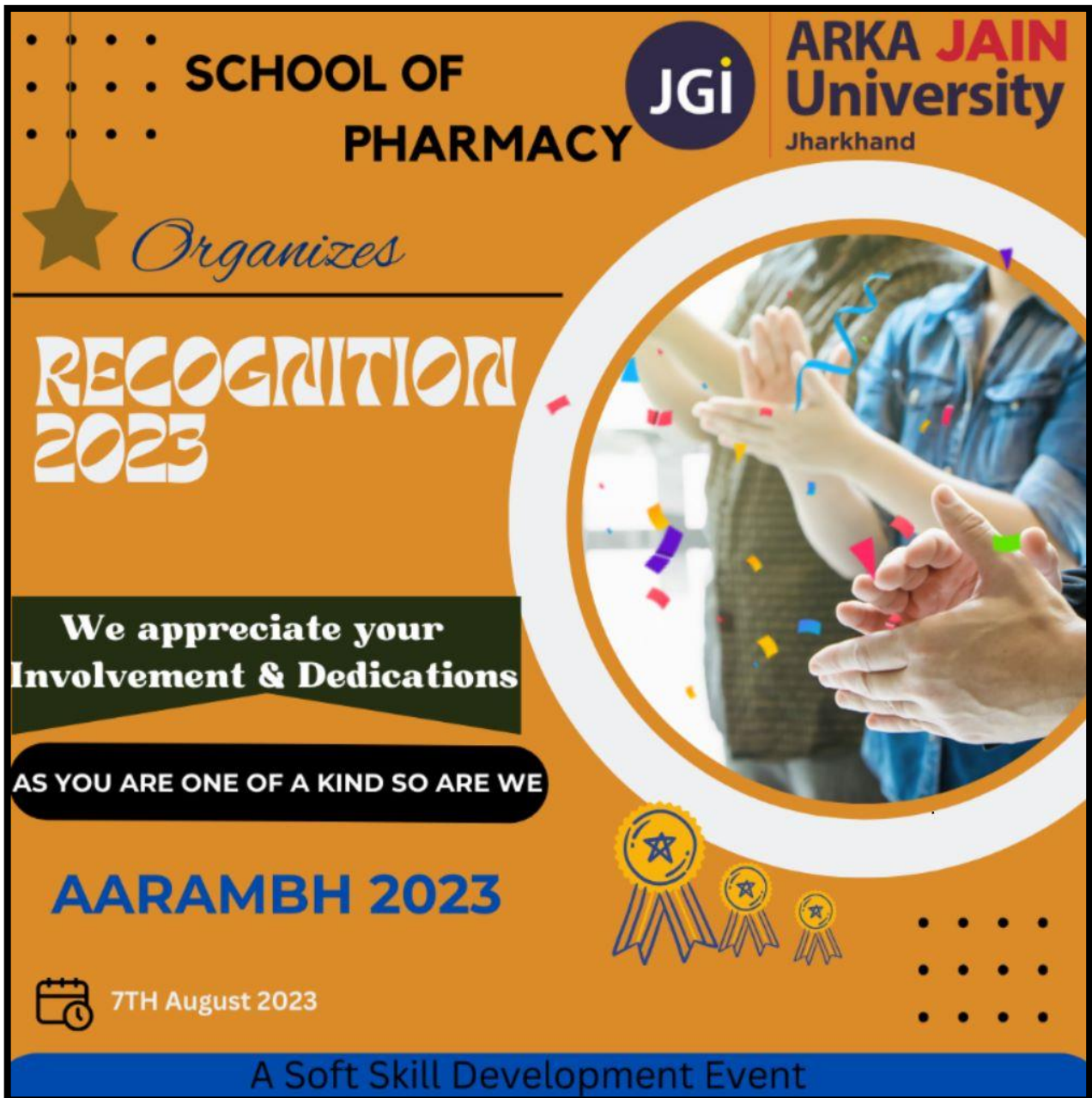
Figure 1: Poster of Recognition