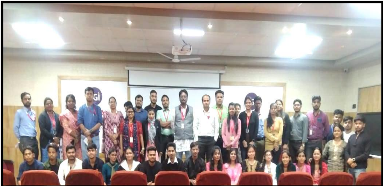
Figure 10: Students, along with faculty, during the NPW 2023 celebration