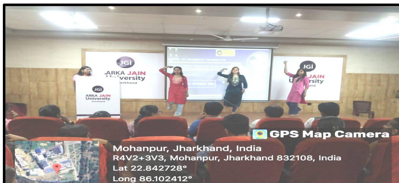
Figure 6: Students performing during the cultural day