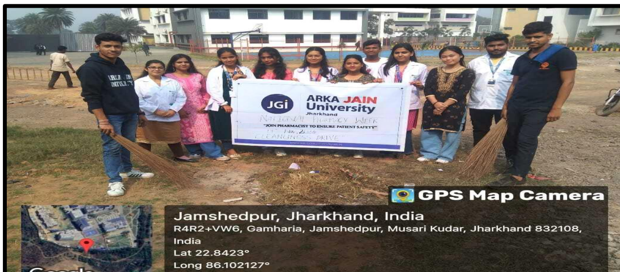
Figure 5: Enthusiastic students actively involved in a campus-wide cleanliness initiative