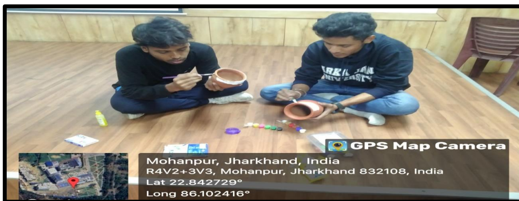
Figure 3: Students engaged in pot painting activity