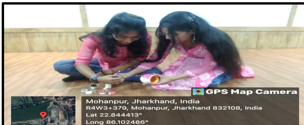
Figure 2: Students engaged in pot painting activity