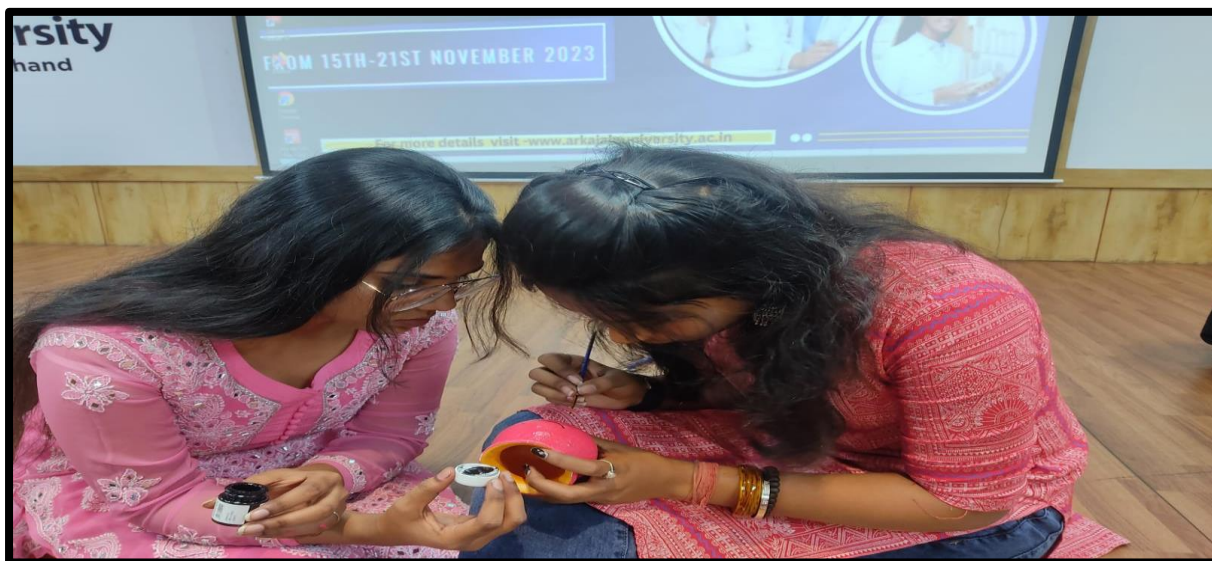
Figure 11: Students, engaged with pot painting