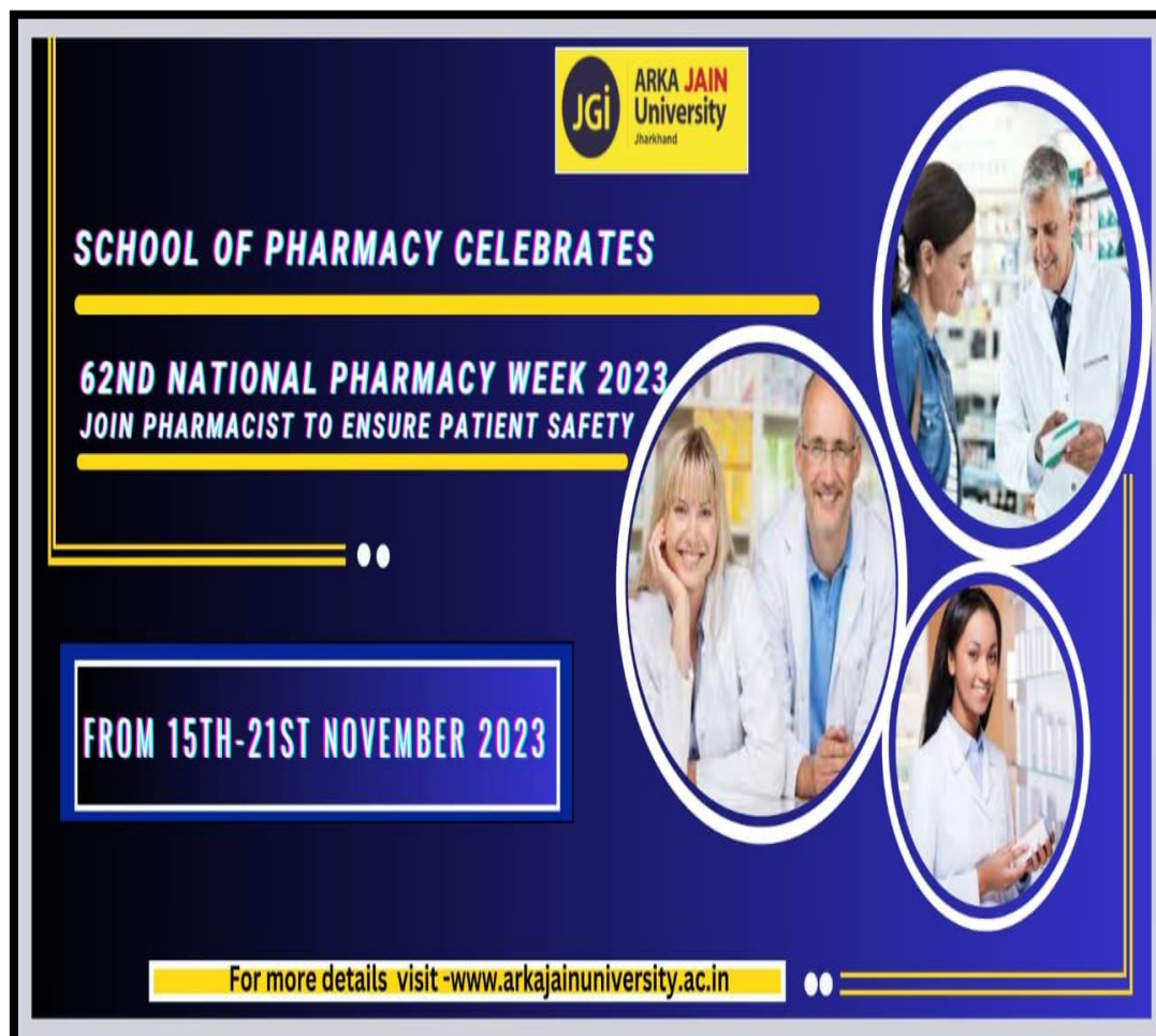
Figure 1: Poster of NPW