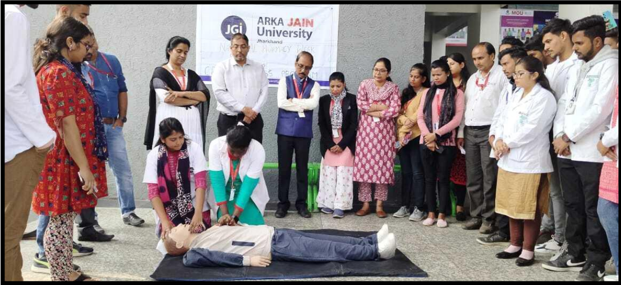
Figure 9: Experts giving demonstration during NPW 2023