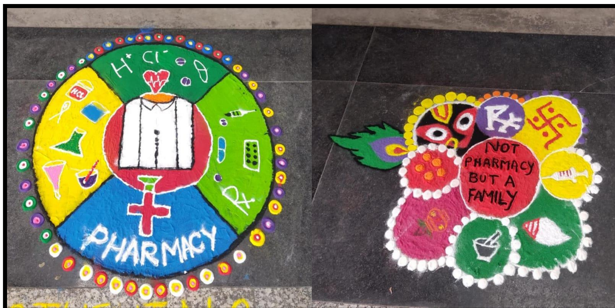
Figure 8: Rangoli made by students during NPW