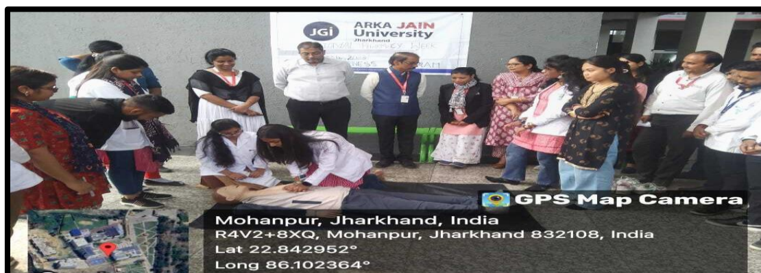
Figure 4: CPR demonstrations