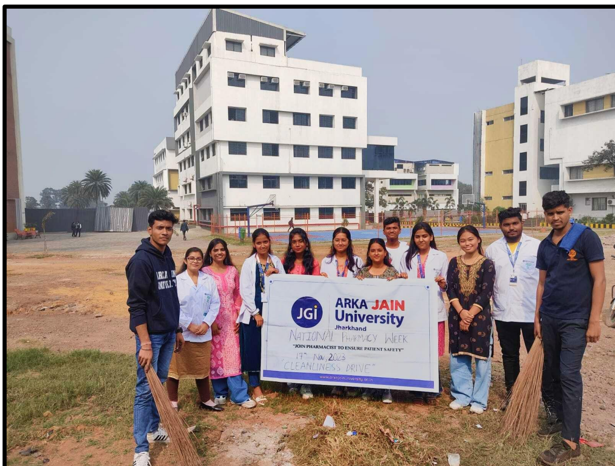
Figure 12: Swachhata Abhiyan Campus Cleanlines by the students during NPW 2023