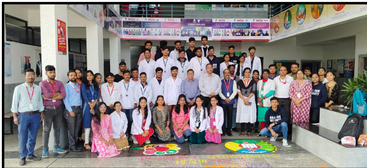
Figure 7: Students, along with faculty members during the NPW 2023 celebration