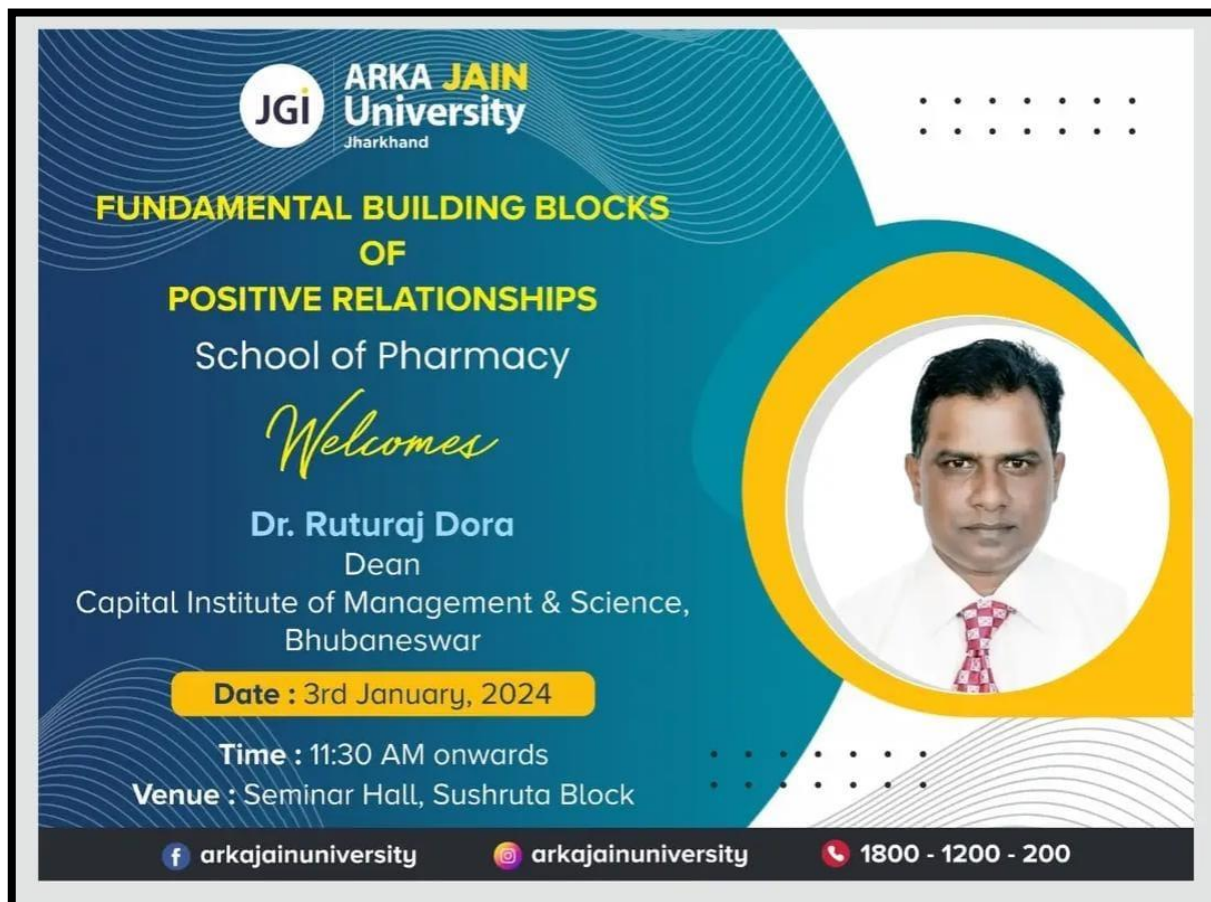
Figure 1: Poster of Fundamental Building Blocks of Positive Relationship