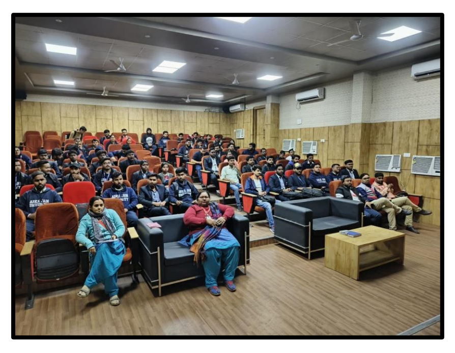
Figure 2: All Participants listening carefully