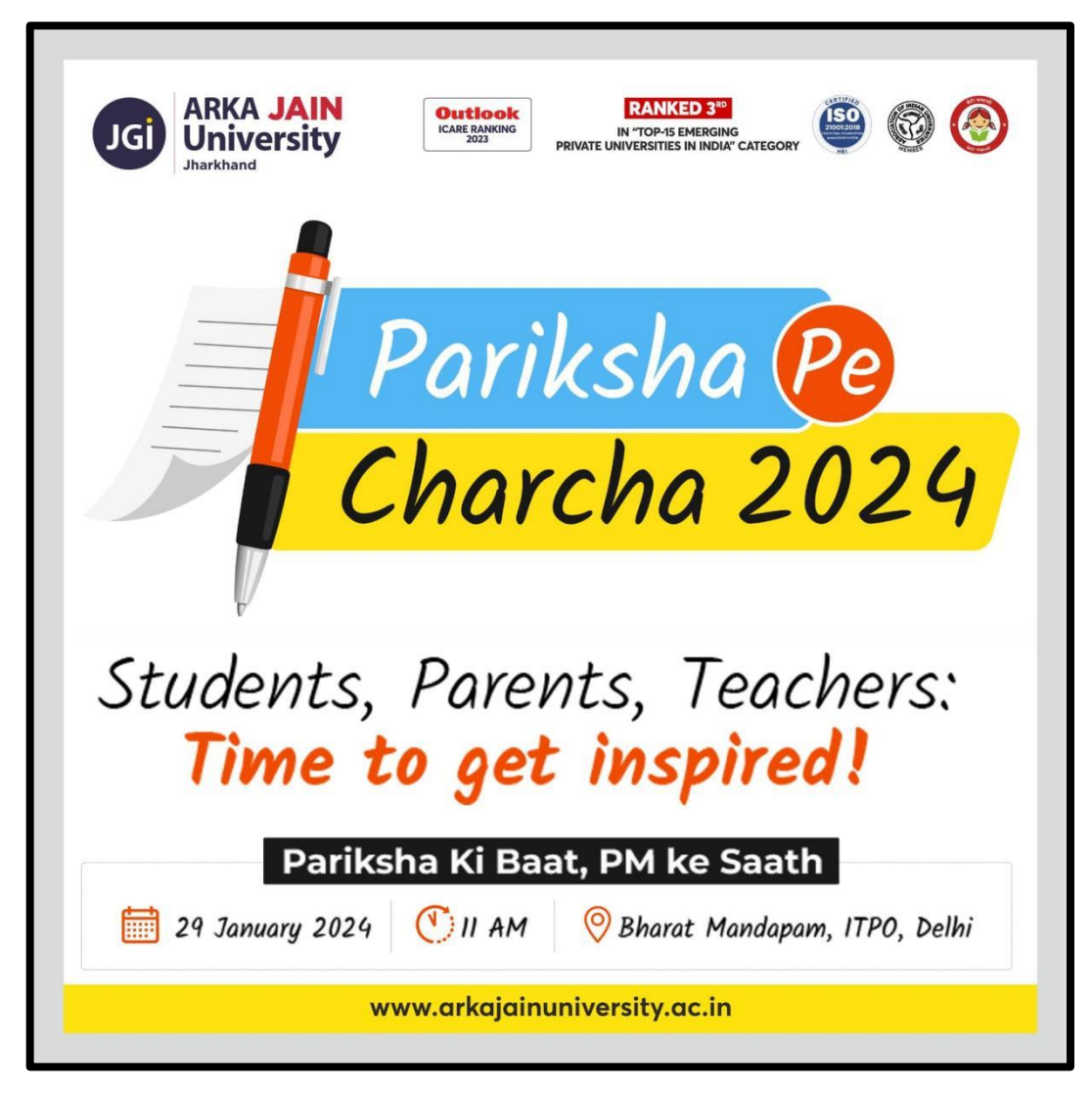
Figure 1: Poster of Pariksha Pe Charcha