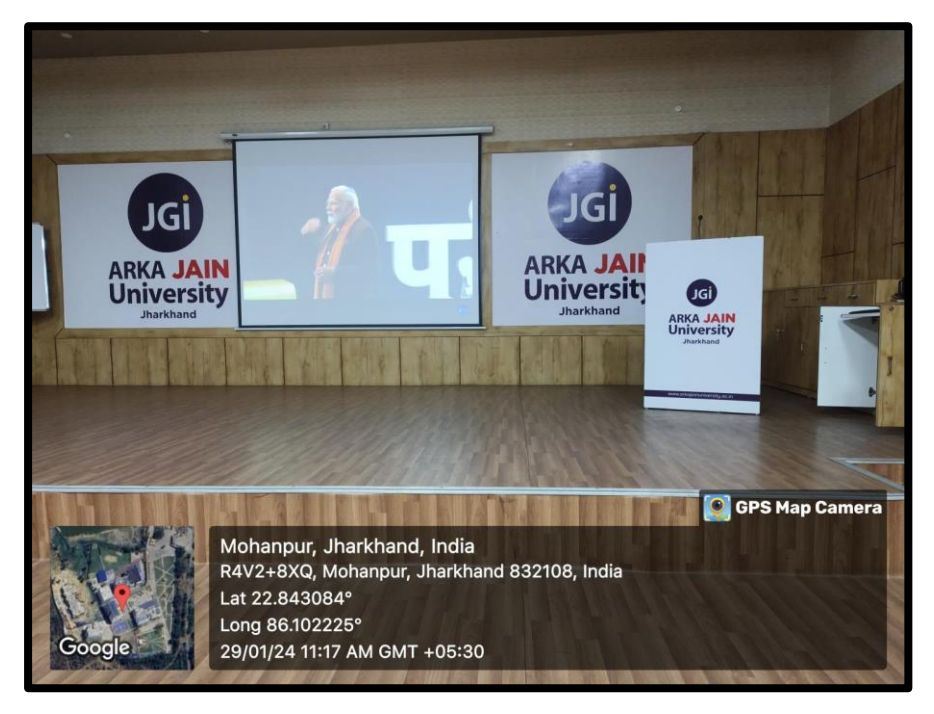
Figure 2: Prime Minister is live during the session