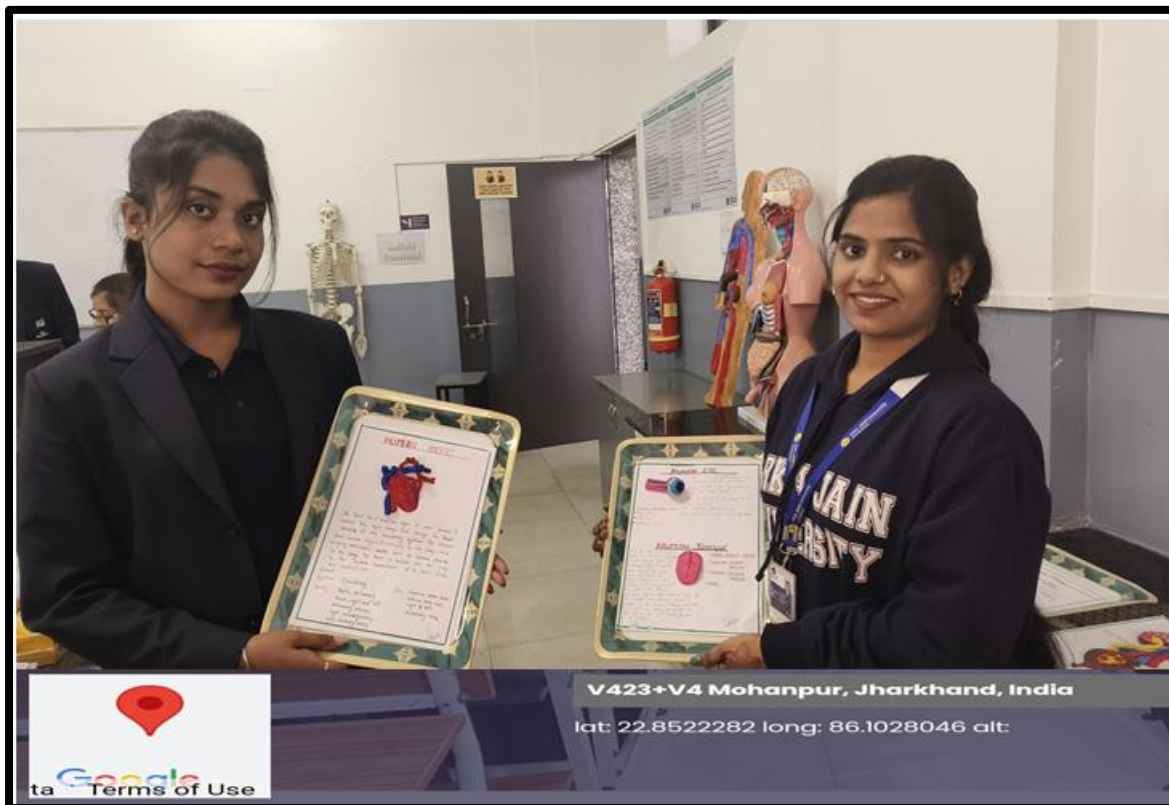
Figure 3: Students with finished model