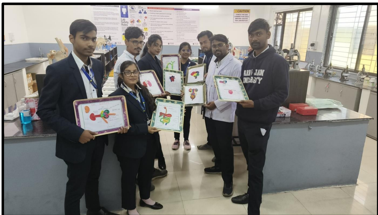
Figure 4: Participants with their prepared models