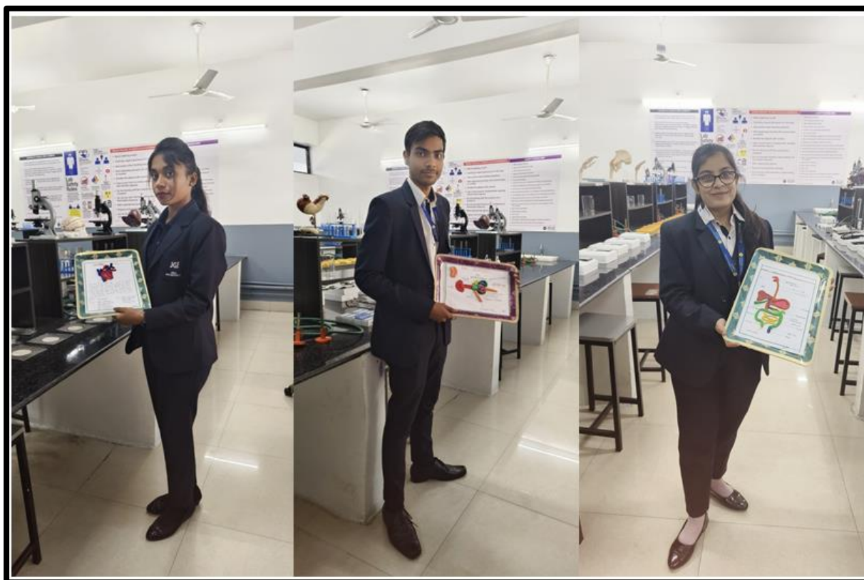
Figure 5: Students executing models prepared by them selves