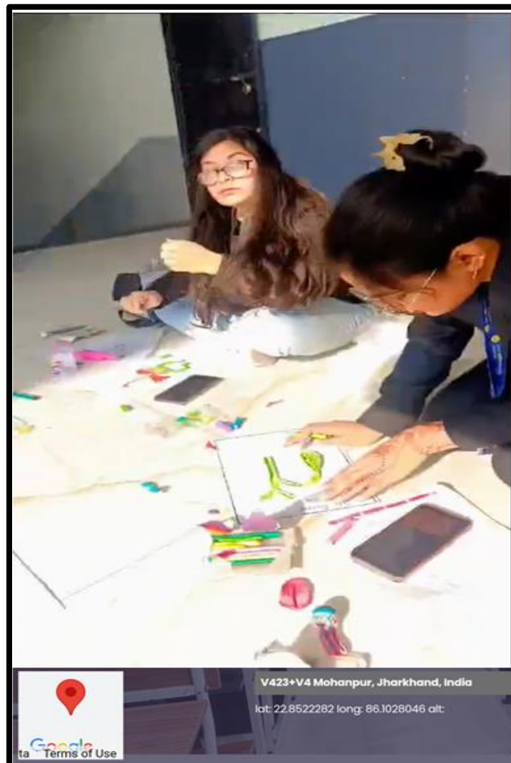
Figure 2: Students are engaged with model making