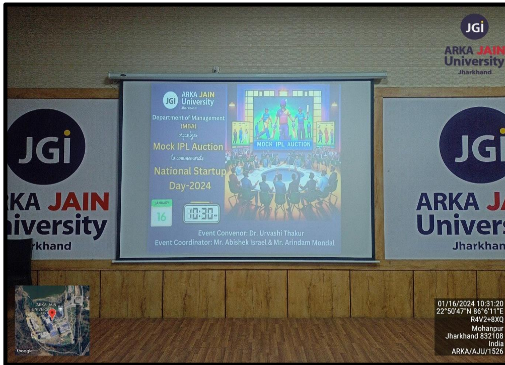
Figure 2: Geo Tag Photo