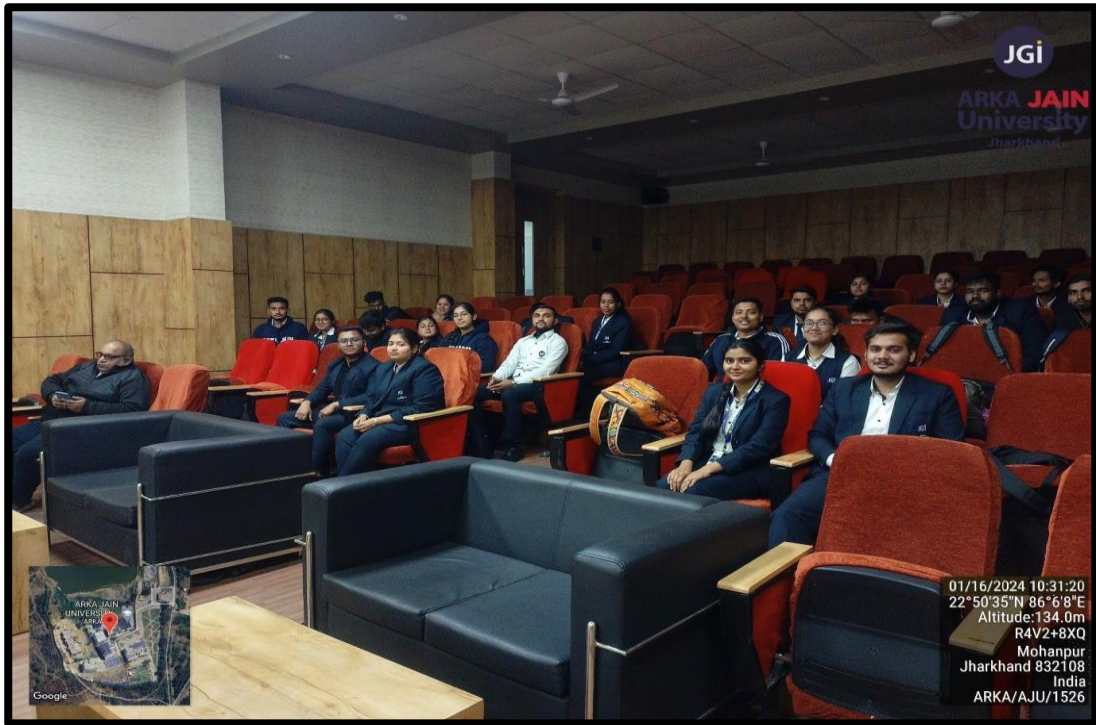
Figure 4: students Paying attention towards the speaker.