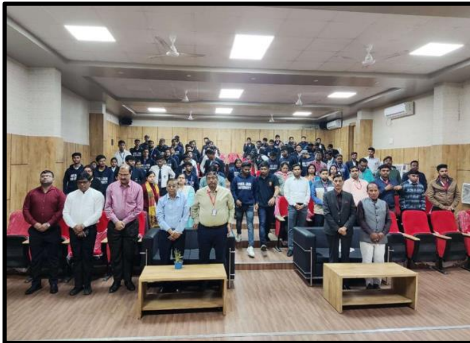
Figure 6: All the participants passionately remembering their martyrs.