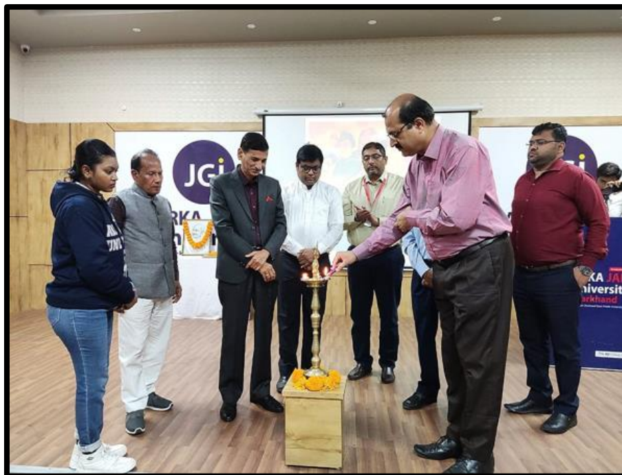
Figure 3: Inaugural Session