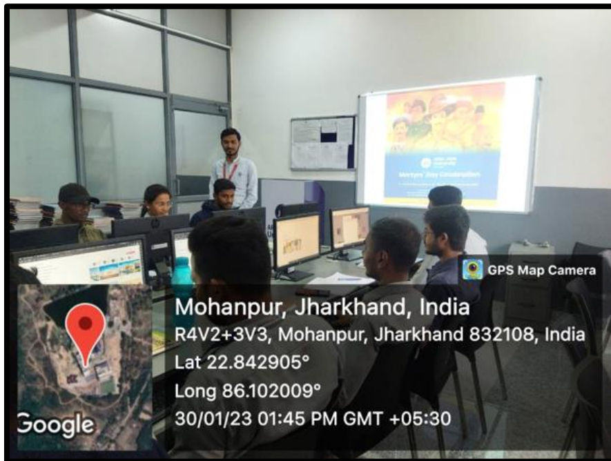
Figure 2: Geo Tag Photo of the Event